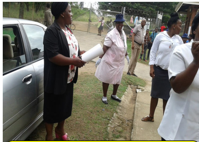
Staff and patients evacuating the clinic to the assembly points.

During the evacuation, staff and patient should assemble at assembly point area to avoid scattering causing blockage of main entrances.