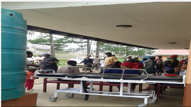
Patients waiting in the waiting area at Ensingweni Clinic

Patients were evacuating after given order to evacuate.