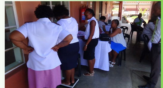
During weighing of weight and height

This Healthy Lifestyle and Wellness event was done on 23 February 2016 for all permanent and contracted staff including staff for outsourced services. Screenings were done by specialized staff . There were also financial advisors from outside who were