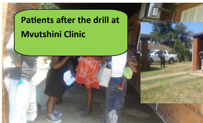
Patients after the drill at Mvutshini Clinic

During the evacuation, staff and patient should assemble at assembly point area to avoid scattering causing blockage of main entrances.