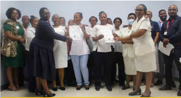
Medical wards, newly opened, are already getting compliments