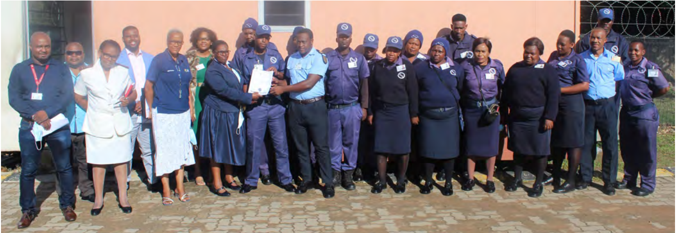
The Catherine Booth Hospital's Management Team handing over a certificate of recognition to the Kenyon Security Services.

A Joyful Day As Units Receive Certificates of Recognition For Excellent Service Provided.