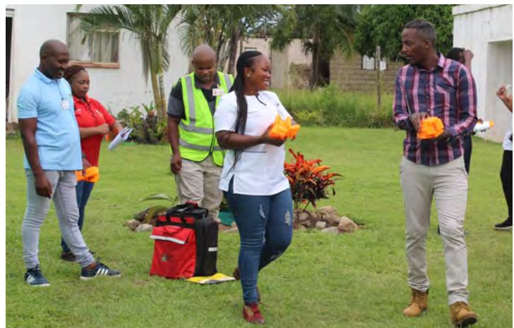
Pills containers distribution: These are containers that can be useful especially to chronic patients because the are divided into 7 parts, each part can be used to store pills the