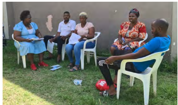
The TB team at one of the households at Obanjeni Area providing healthcare services

The services that were provided to the community included TB screening and testing, HIV/AIDS testing, family planning, and chest X-Ray screening and testing. The community was delighted for this initiative because Obanjeni area do not have a fixed clinic as yet, they get their services from the mobile clinics which visits