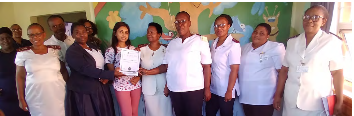
Certificate hand over to the Paediatric ward staff members