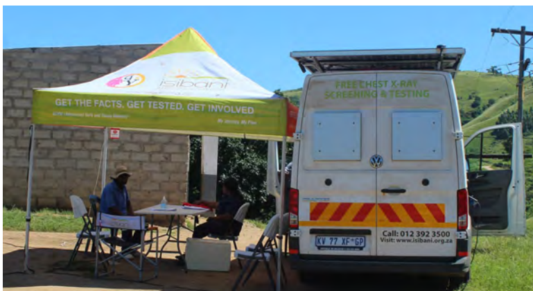
Makhilimba, Ezingwenya and Obanjeni community were receiving chest X-ray screening and testing services at their door