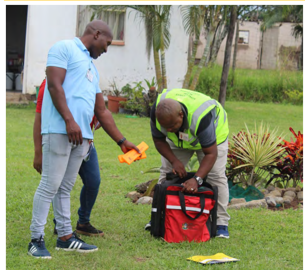
Working together was the order of the day