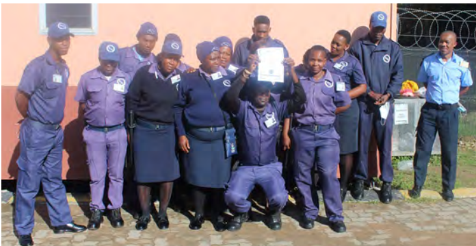
Security services personnel's: Happiness was written all over their faces after receive the certificate