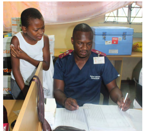
The school health team also used this opportunity to distribute TD to learners that were due. This is a campaign that takes place every February and in August