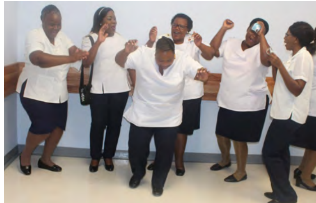
Songs and slogans expressing gratitude were sang during the handover