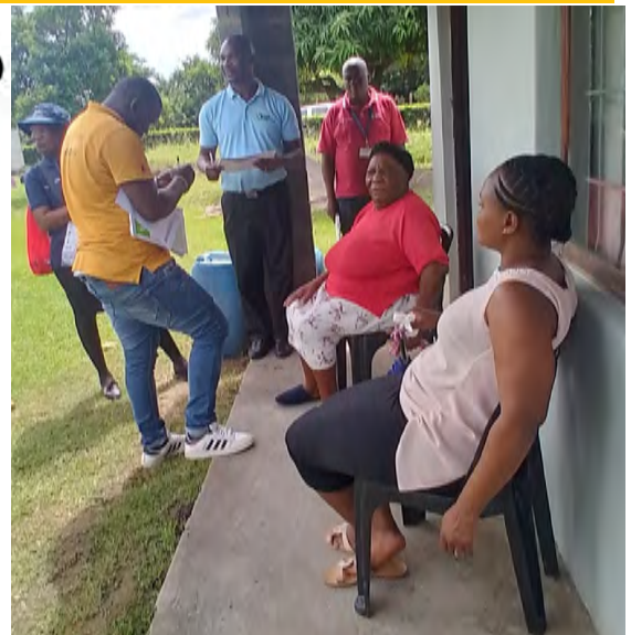
TB Team at one of the household at Obanjeni during the BLITZ campaign.