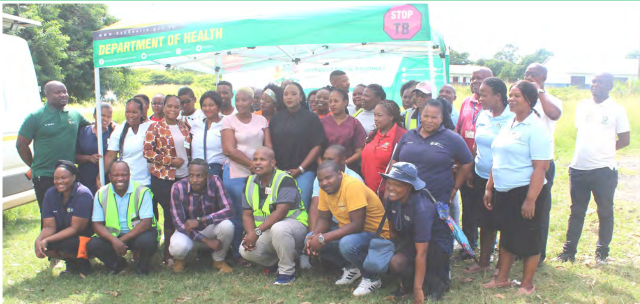
King Cetshwayo District 2023 BLITZ team at Obanjani Area in the morning briefing before door-to-door campaign began. RAED MORE ON PAGE 1-2.