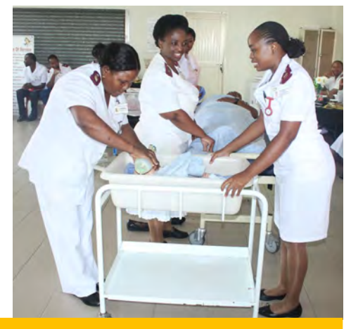
Stage Play—Maternity ward demonstrating emergency delivery