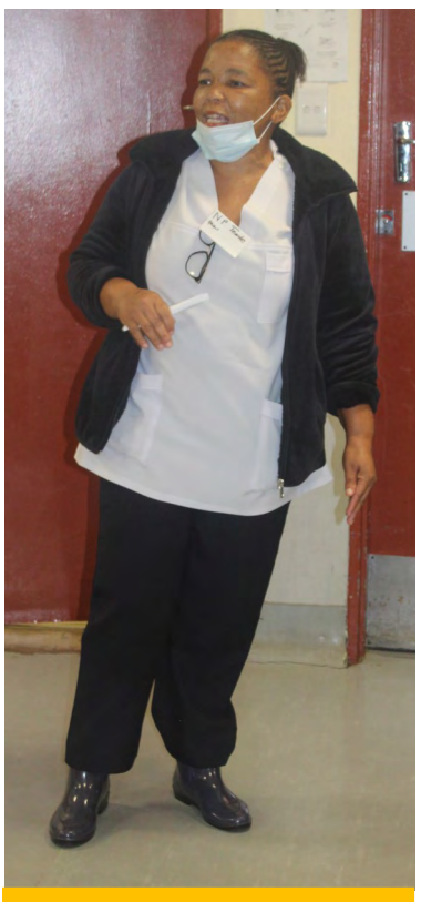
Sister Tembe during TB Awareness held at OPD waiting area.