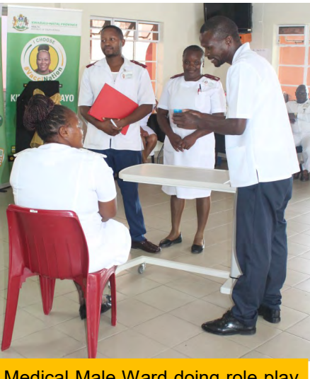
Medical Male Ward doing role play about professionalism.