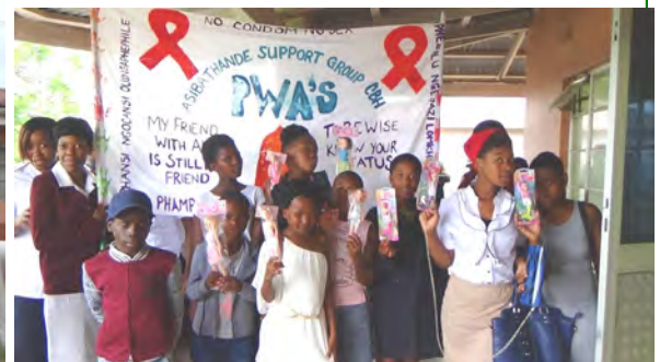
Catherine Booth Hospital would like to thank Pep Store at Gingindlovu for the toys that were given to children on the day.

Catherine Booth Hospital commemorated World Aids Day on the 1st of December 2016 with the aim of educating and encouraging the community to live a healthy lifestyle. Members of the support group, children and other stakeholders attended the event with one word “ I cannot be killed by HIV, I love myself” Event was done for all clients serviced by the catchment area of the hospital. Living a healthy lifestyle is the key to the free society which can beat HIV / Aids. Infected children were also happy to meet with other peers and shared their experiences.