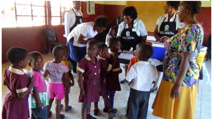
Umnyango wakwa PHC eNyezane Primary School

Baningi abantwana abathola ukusizakala ngesikhathi kunomkhankaso wokugoma abantwana ezikoleni nasemphakathi. Abantwana base Nyezane Primary baba ngabanye babantwana abathola ukugonyelwa ezikoleni ngesikhathi salomkhankaso kaZwelonke wokugoma abantwana abanemin-