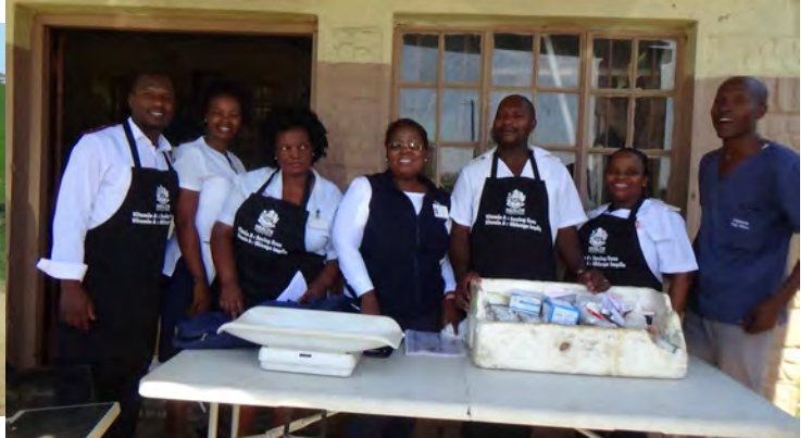
Abasebenzi bakwaPHC kanye nosonhlalakahle nge campaign.