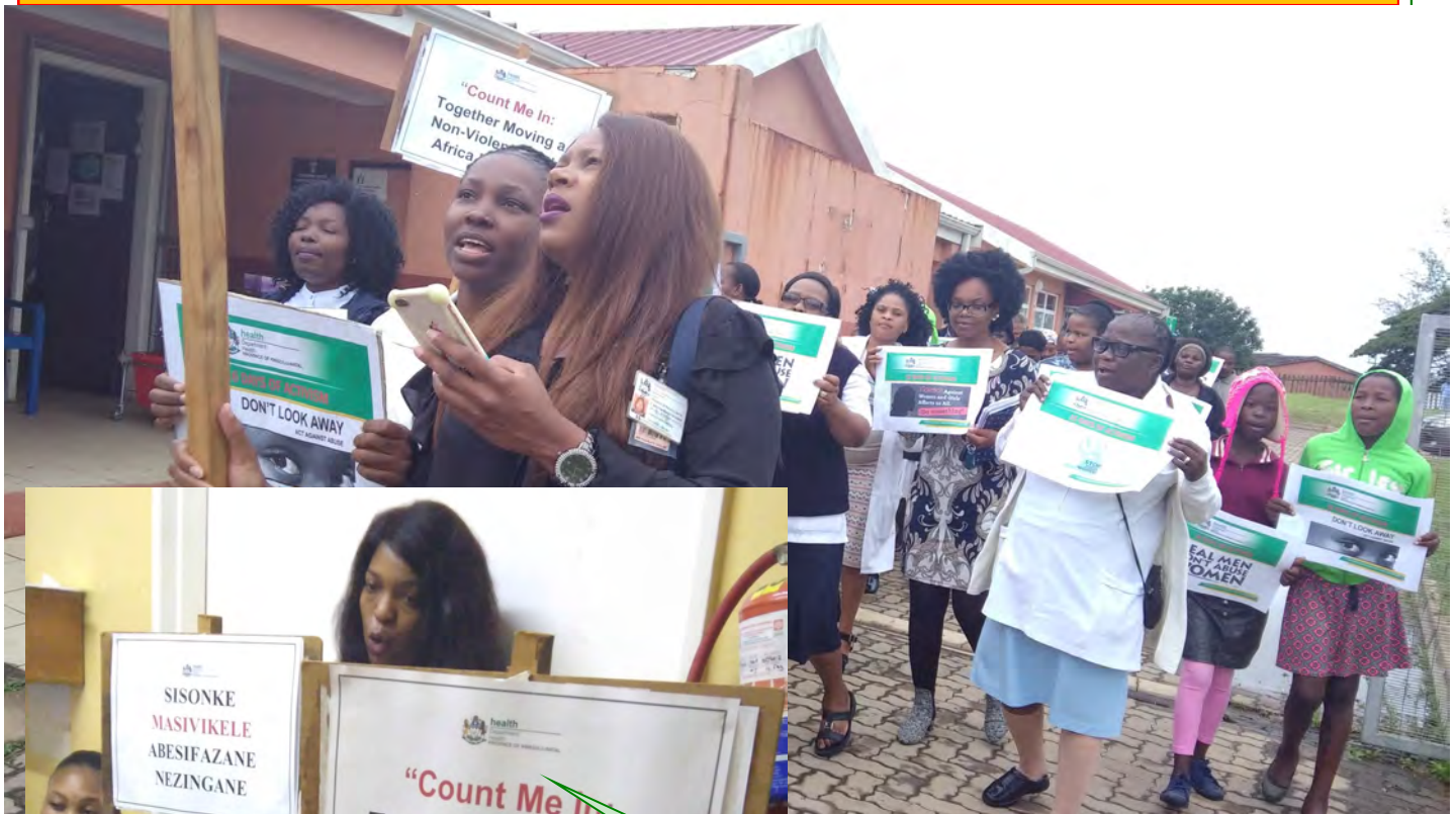
Walk against Women and Children Abuse in the hospital on 05 December 2017

“Sisonke Masivikele Abesifazane Nezingane, sibike ukuhlukumezeka esikubona emphakathini”