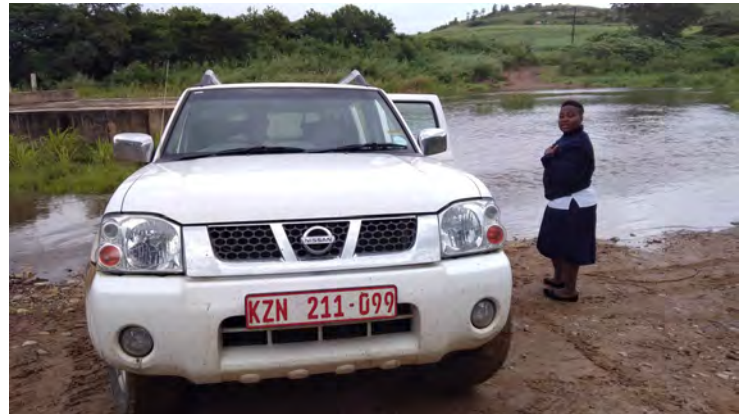
Unesi engasakwazi ukuwelela ngaphesheya ukuyojova abe TB

Isibhedlela sisebenza imiphakathi esezindaweni zasemakhaya. Kunophiko lwabasebenzi abathungatha iziguli ezingasayilandi imishanguzo yazo ikakhulukazi eye TB neyisifo esithelelanayo ukugwema ukubhebhethekisa lesisifo emiphakathini. Lelithimba liphinde lijove iziguli ezinesifo sofuba emakhaya. Kuba nzima-ke ukufinyelela kweminye imizi enabantu abajovayo uma kuke kwaba khona izimvula ngenxa yezinqala sizinda. Imigwaqo ivalwa ngamanzi kungadluleki ukuya emizini engaphesheya nokuphoqa ukuba kuhanjwe ngezindlela ezijikelezayo ukufika kuleyomizi okanye kucelwe iziguli ukuba beze emitholampilo eseduzane ukuze zizojova.