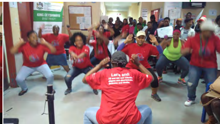
Aerobic session as part of the promotion of Healthy lifestyle