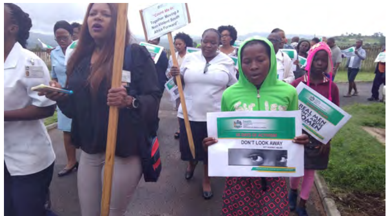
Abasebenzi besibhedlela nomphakathi kumkhankaso ka 16 Days Of Activism Against Women & Child Abuse