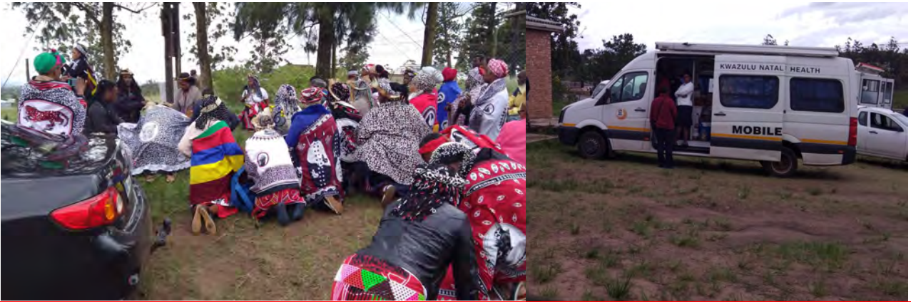
Abelaphi bendabuko basebenzisana nomnyango wezempilo ekulweni nesifo segculaza negciwane laso.