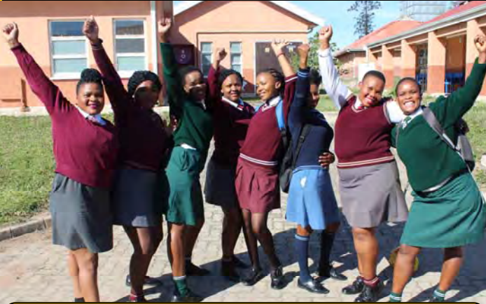
"AMANDLA!!!" abasebenzi bekhombisa ubumbano kululusuku olugujwa minyaka yonke.