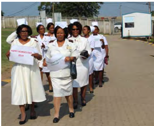
This is what they mean if they say "Walk like a Nurse" Nurses started their celebration by a walk with plug cards written positive messages for them.

FIGHTING DISEASE, FIGHTING POVERTY, GIVING HOPE