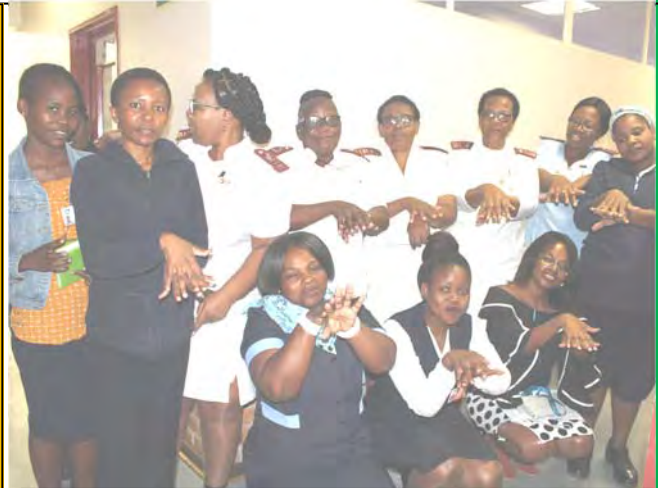
Clinical and non-clinical staff demonstrating steps of hand washing in the health care facility

Ngomhlaka 23 KuNhlaba isibhedlela I Catherine Booth saba nomkhankaso wokuqwashisa ngokugezwa kwezandla owawubhekiswe ngqo kubasebenzi besibhedlela. Inhloso yalomkhankaso kwakuwukhuthazana nokukhumbuzana ngokubaluleka kokugezwa kwezandla ngendlela ephile njengabezempilo.