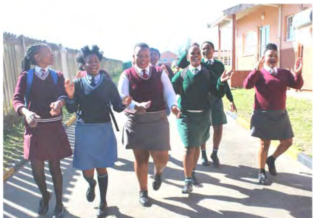
Abasebenzi begqoke imfaniswano yesikole bebhuyoza isibhedlela sonke becula amaculo omzabalazo.

FIGHTING DISEASE, FIGHTING POVERTY, GIVING HOPE