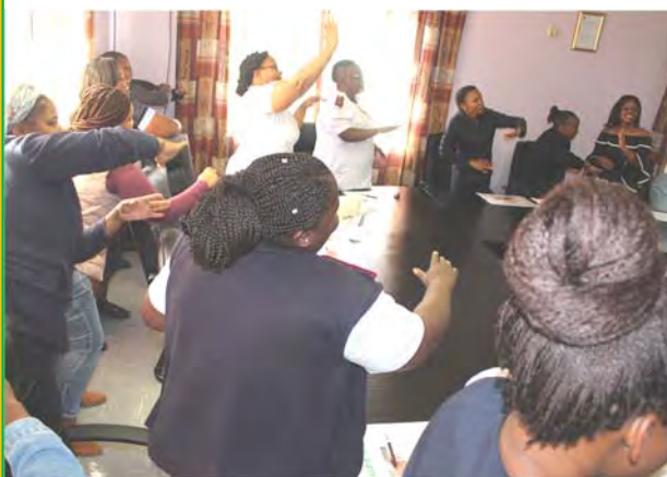
Health care workers demonstrating steps for hand washing for health care workers.

“Patient’s wellbeing in the health facility depends on us and we should not infect them of gems because of our failure to practice basic things like hand washing” Hands washing should be done before and after touching a patient. A song on hand wash and demonstration was watched on the screen and was practiced in the boardroom while dancing as part of the awareness and it was fun!