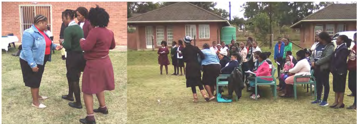
Kudlalwa umdlalo weshashalazi ofundisa nonqanda isihlava sokukhulelwa kwezingane ezisencane nezesikole

nokuyiyona enengqikithi yosuku, babecula amaculo omzabalazo, befunda nezinkondlo ezakhayo begqugquzela ukubaluleka kwemfundo entsheni. Ukugujwa kwalolusuku kwakungenye yezindlela okwakugqugquzelwa ngazo abantu abasha ukuba bazithukise ngokwemfundo nangamakhono benze okuncono kunalokhu okwenziwa yintsha yango 1976.