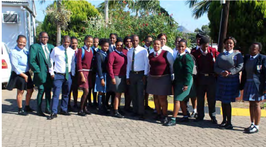
“Learners from CBH” wearing school uniform celebrating youth day

On the 21 th of March 2019 Catherine Booth Hospital staff members were celebrating the youth day in the facility encouraging staff members to empower themselves with more knowledge. All staff members were wearing school uniforms from different schools, it was an awesome day, they