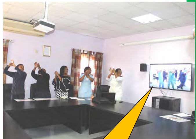
Abasebenzi babedansa umdanso wokugeza izandla bebukela kumabonakude

FIGHTING DISEASE, FIGHTING POVERTY, GIVING HOPE