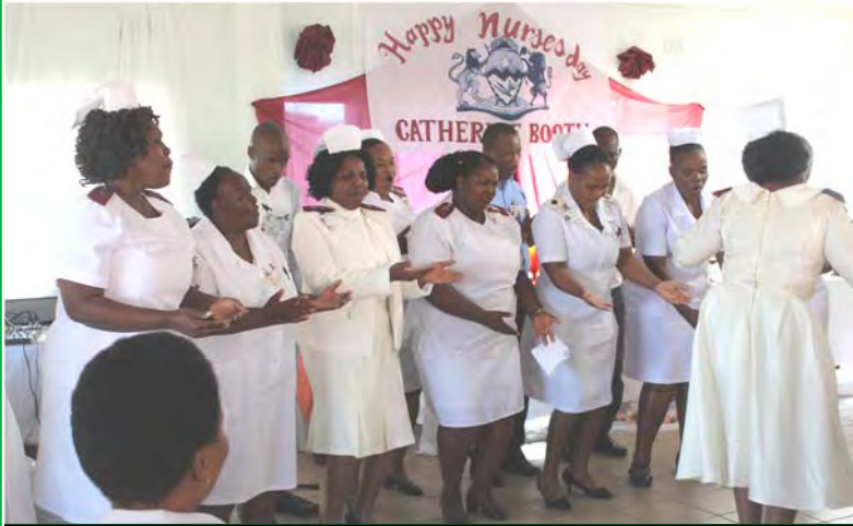
Kwavumbuka ikhono elalingaziwa amanesi ecula umculo wemizwilli