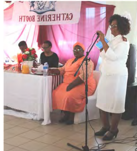
uMatron WSM Gcabashe owabe eyisikhulumi sosuku edlulisa amazwi akhayo kubahlengi naku-bahlengikazi.