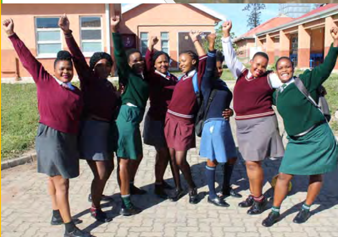
Catherine Booth staff during the Youth Day celebration.