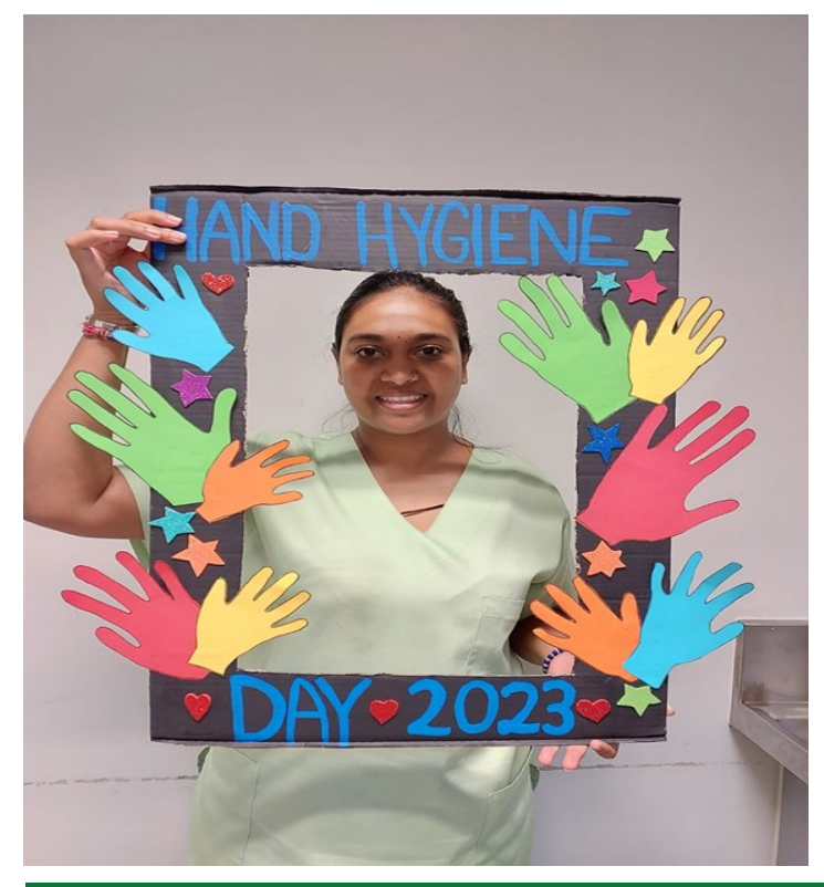
Cato Manor CHC Infection Prevention and Control representatives standing united in promoting