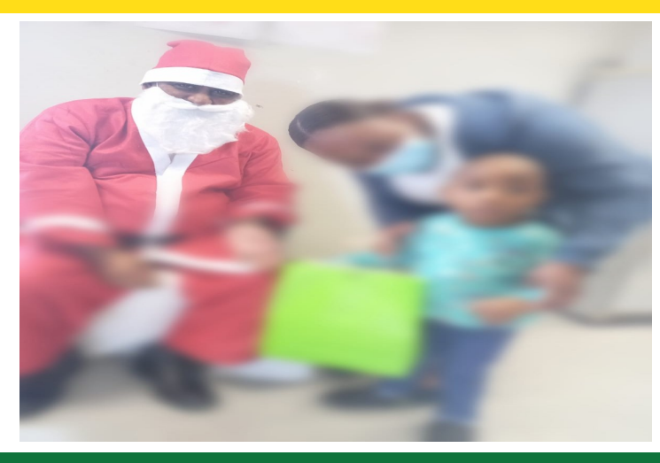
Father Christmas handing over Christmas gift s to patients