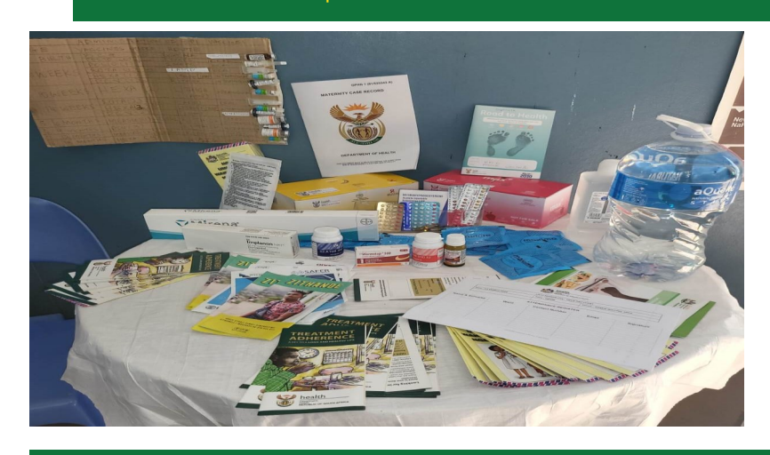
MOU Department table