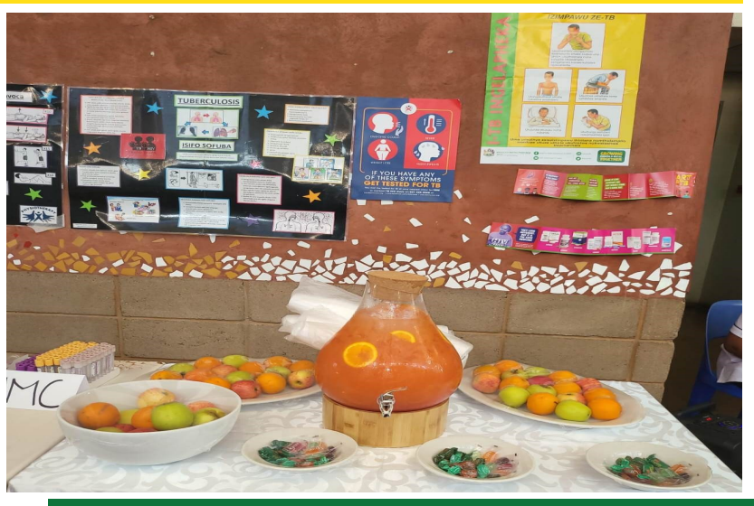
Chronic Department table

All departments that awarded with a Certificate of Appreciation with an aim of boosting staff moral.