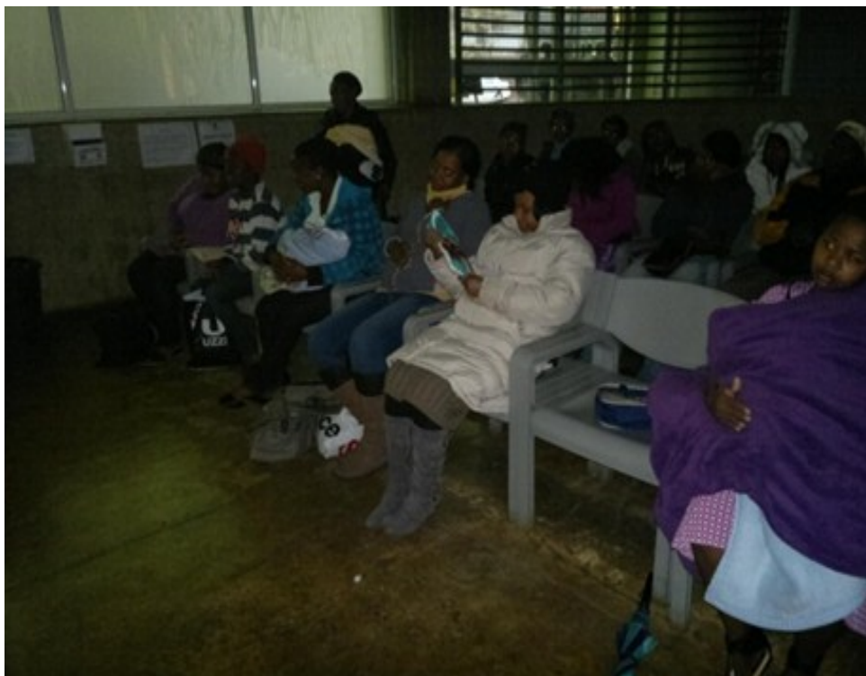
Mothers observing demonstration done by a new mother