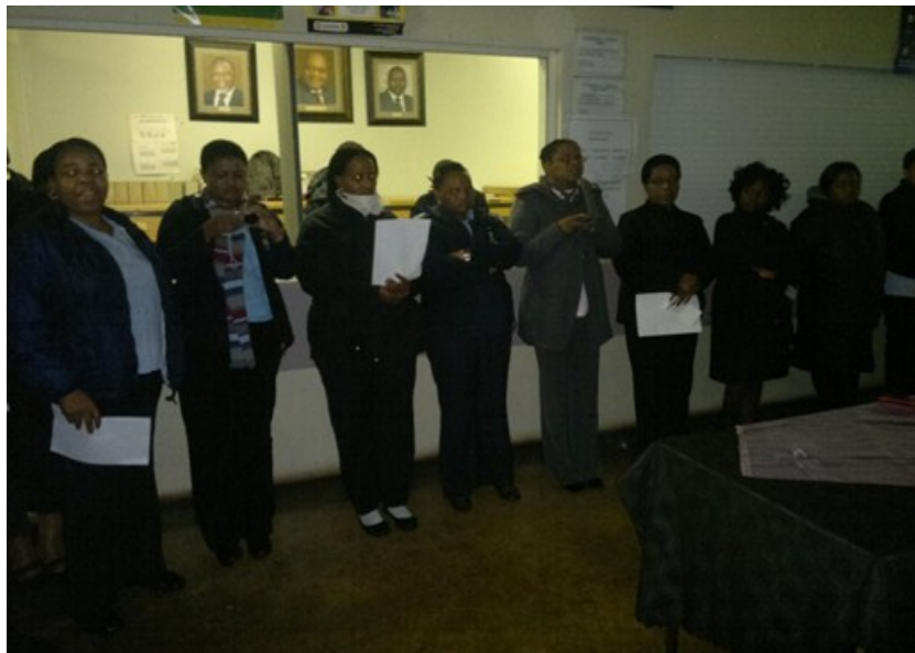
Musical item by Cato Manor staff