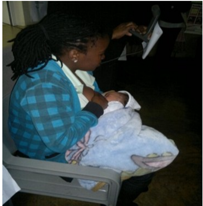
Demonstration by a new mother