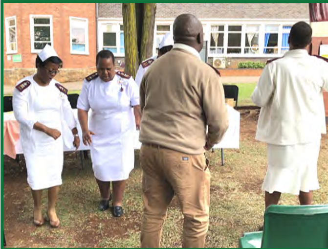
Nurses dancing during a praise and worship session