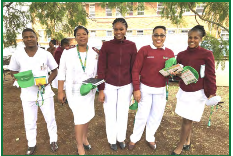
Nurses with their gifts courtesy of our sponsors