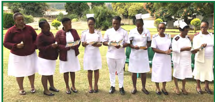
Nurses reciting their pledge