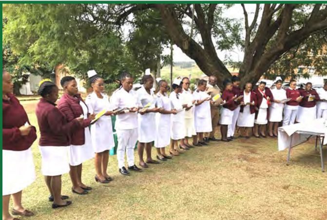
Nurses reciting their pledge