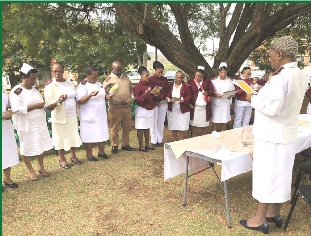
Christ The King Hospital Nursing Staff

Christ The King Hospital hosted an International Nurses' Day event on the 12th of May 2023 at the hospital's assembly point.