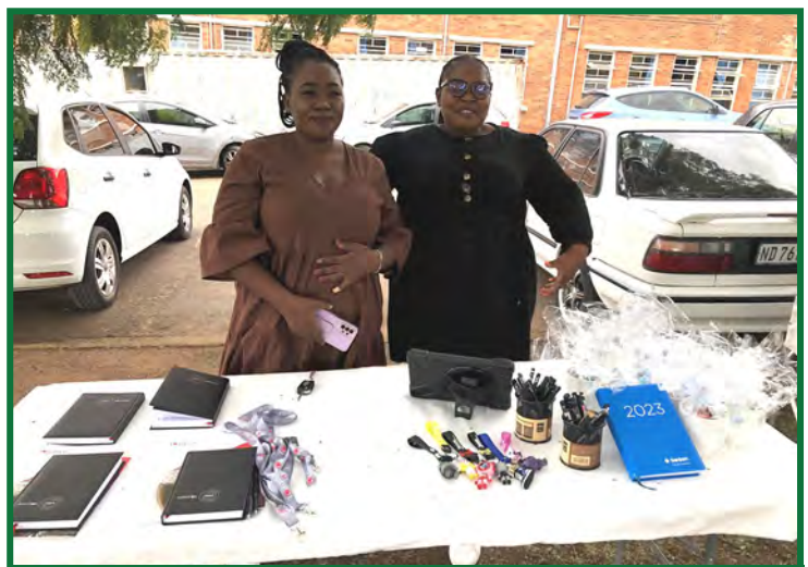
Representatives from Sanlam and their sponsored gifts