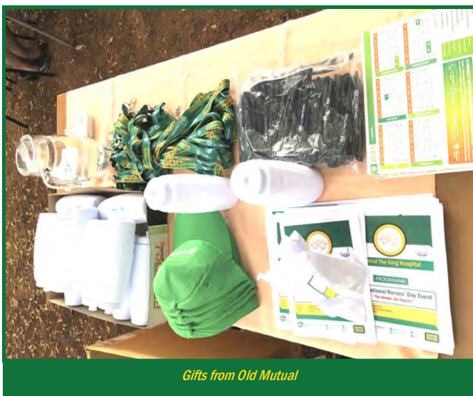
Gifts from Old Mutual