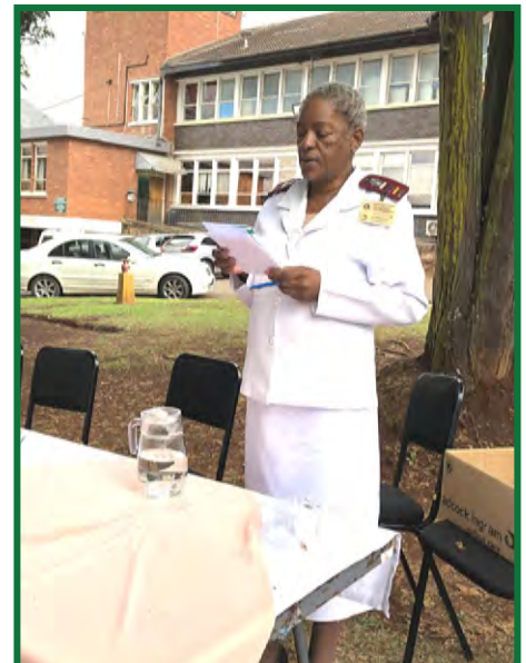
Ms Mthembu coordinating the nurses pledge