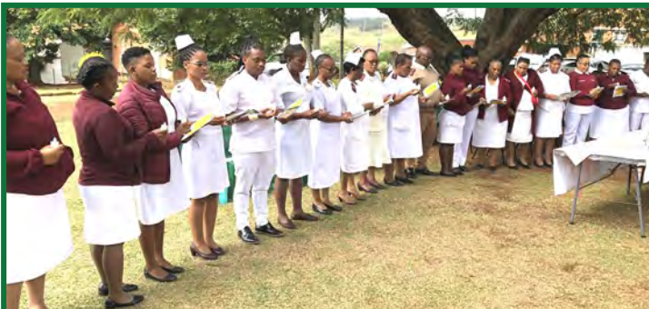
Nurses reciting their pledge