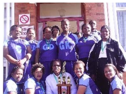
CTK Netball team "Ogogo"

Hopefully team spirit lives on after the Tournaments and overflows into the work situation, and we excel just as well in services delivery but only if we accept and embrace our differences that make us unique. Gogo's we salute you!