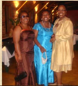
Where can I get that outfit? Mmm..?