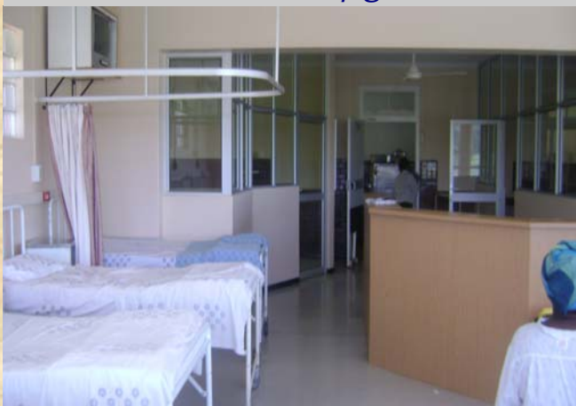
Newly upgraded Post Natal ward

Though I am not a pediatric expert and I am in no ways claiming to be one, I do however believe that what a new-born sees on their very first glance will somehow shape their outlook to the world when they become adult.