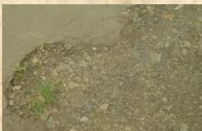
Road surface before