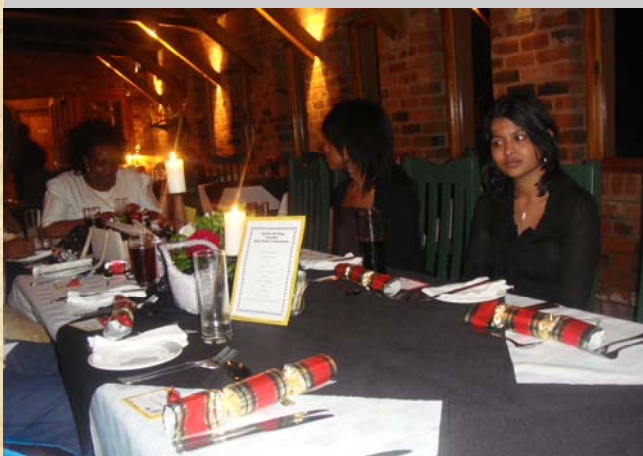
What's the next item? It was eating time at the Christmas party

The year 2009 was rough economically, not only to CTK Hospital but to the international community at large. Due to economic instabilities, fiscal adjustment plans and redirection of scarce resources had to be implemented. All had to be done without a slightest compromise to service delivery