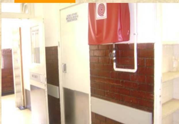
Home Affairs offices near Labour ward

“.....It is a requirement that each hospital must have a Home Affairs office.... “