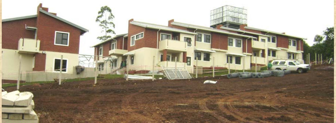
Main picture: Another view of the about-to-be-finished staff residence. Inset: Lecture hall

The building is currently 96% finished, the constructor is putting finishing touches and expected to finish by March 2010.