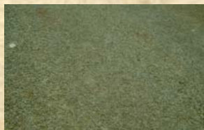
Road surface currently

Every citizen has got a right to conveniently access the services they are entitled to. It is the responsibility for all public service facilities that care for their clients, to ensure that their service and premises are customer-friendly.