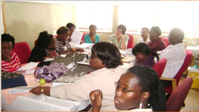
Hard at work: Make Me Look Like a Hospital team left no stone unturned.

took rounds, checked files and conducted interviews with clients and staff. The results of the survey confirmed that we do look like a hospital; we scored an amazing 99%.