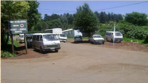
Taxi rank just outside Christ The King Hospital