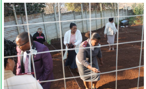
67 MINUTES FOR MANDELA... READ MORE ON PAGE 3