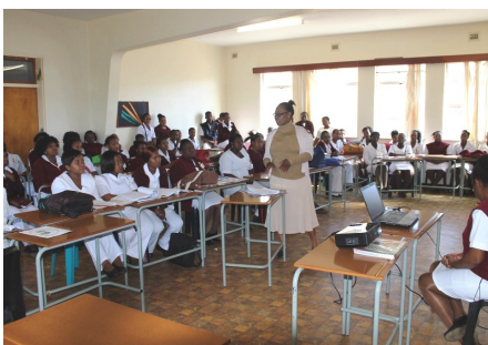
HAND HYGIENE AWARENESS... READ MORE ON PAGE 1