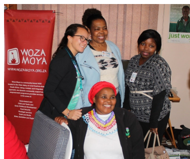
WOZA MOYA ANNIVERSARY... READ MORE ON PAGE 2