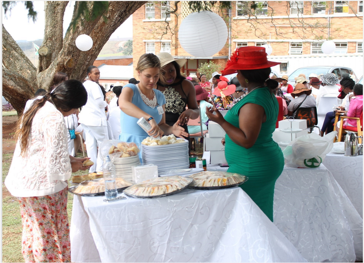
Pictured: CTK Staff preparing for the Tea party

G iven patriarchal nature of the society we live in is inherently oppressive towards women. The above is evident in more ways than one; be it in school, workplace, church etc.