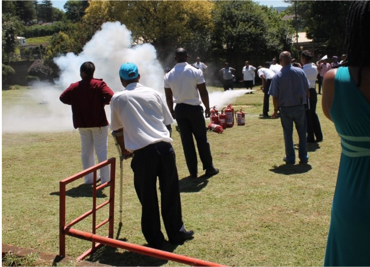
Pictured: During the practical part of the drill, staff members got a chance to test their fire extinguishing skills.

S n accordance with disaster management protocols, any institution especially one such as a hospital must train its staff members on their role in case of fire. The hospital or any health facility must do its best to prevent or minimize loss lives during fire or any disaster. Disaster is defined in simple terms as “A serious disruption of the functioning of society, causing wide spread human, material, or environmental losses which exceed the ability of the affected society to cope with using its own resources”