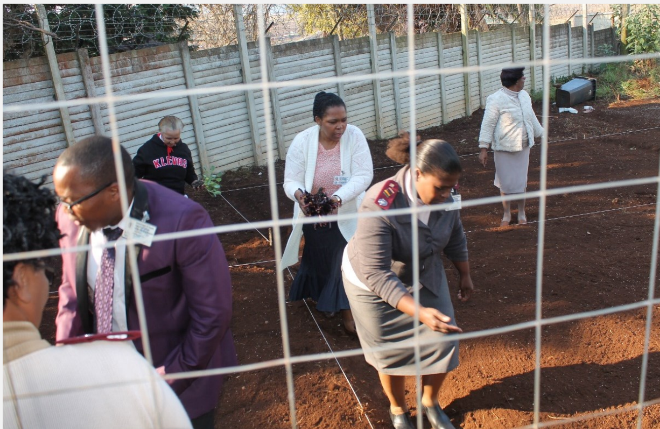
CTK Hospital Health Care Workers on the garden for their 67 minutes

Nelson Mandela International Day (or Mandela Day) is an annual international day in honour of Nelson Mandela, celebrated each 18 July (on Mandela's birthday). The day was officially declared by the United Nations in November 2009, with the first UN Mandela Day held on 18 July 2010. However, other groups began celebrating Mandela Day on 18 July 2009.