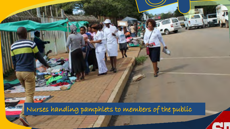
Nurses handing pamphlets to members of the public