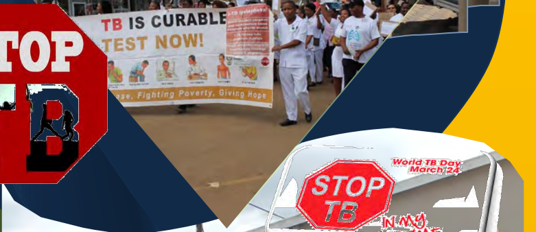
TB IS CURABLE TEST NOW! Fighting Disease, Fighting Poverty, Giving Hope