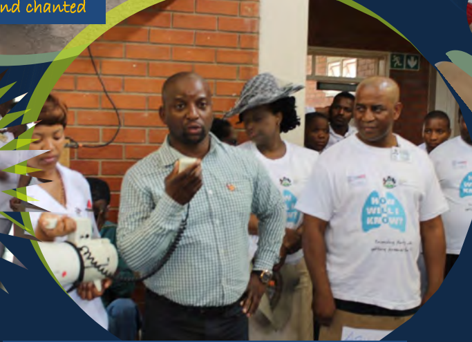
Prince Nhlenganiso giving a moving talk @ OPD