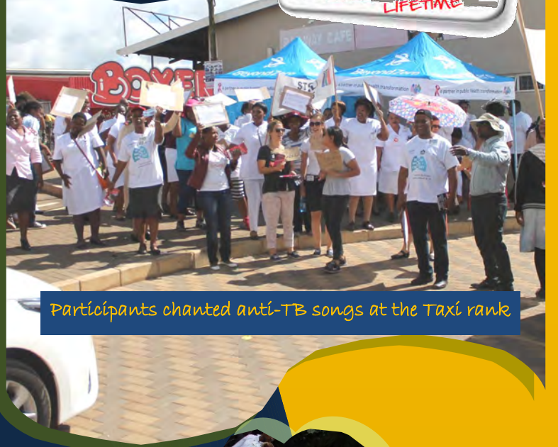
Participants chanted anti-TB songs at the Taxi rank