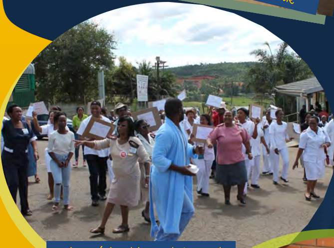
Patients joined in and chanted