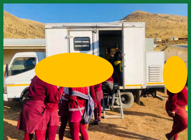
Nonkwenkwane High School pupils queuing for HIV and TB testing.