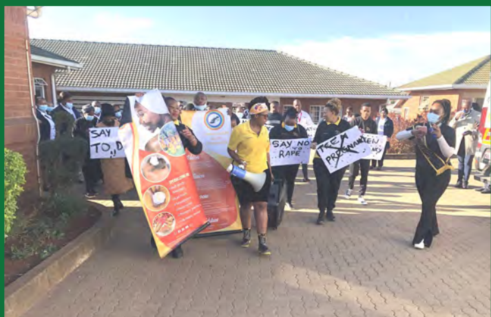
Ixopo Clinic staff starting the marching.