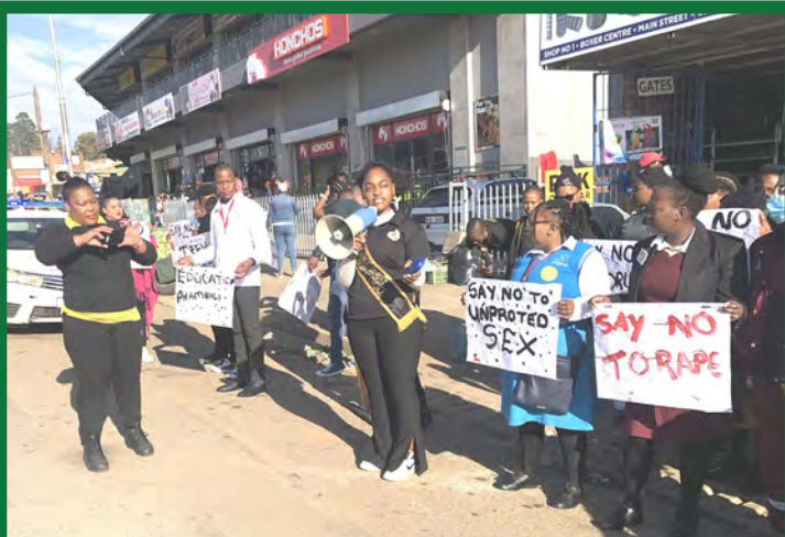
Representative from Uthingolwami Youth Foundation giving her talk.