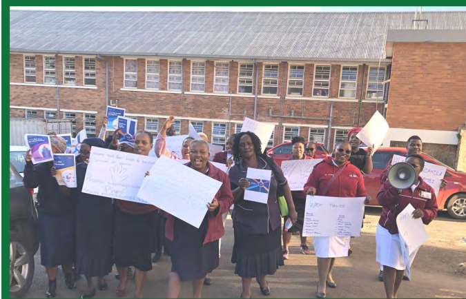
Gateway Clinic staff together with the community health workers.