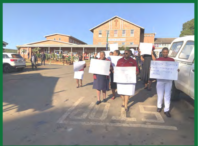
Gateway Clinic staff going to the main hospital entrance.