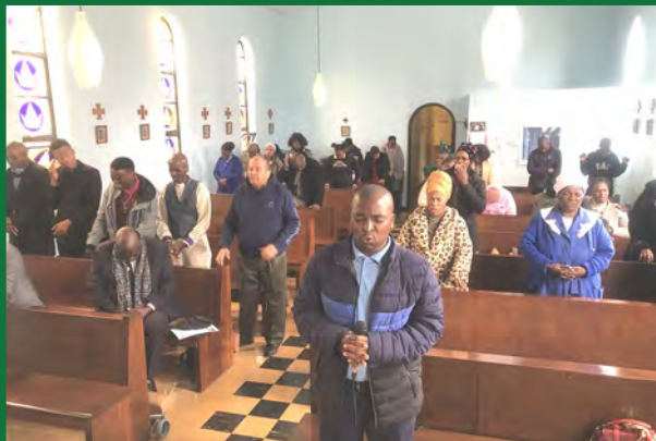
Congregants during the prayer session.