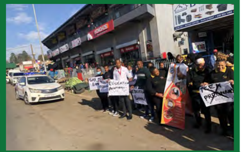
Ixopo Clinic staff with Ixopo Traffic Department.

Ixopo Clinic Adolescent Youth Friendly Services hosted a Youth Day march on the 15th of June 2023 from the clinic premises to Ixopo Taxi Rank as part of the Youth Day celebration.