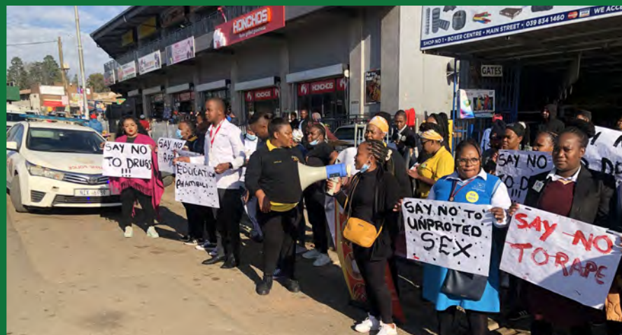
Ixopo Clinic staff and AYFS team giving health talk at the march.