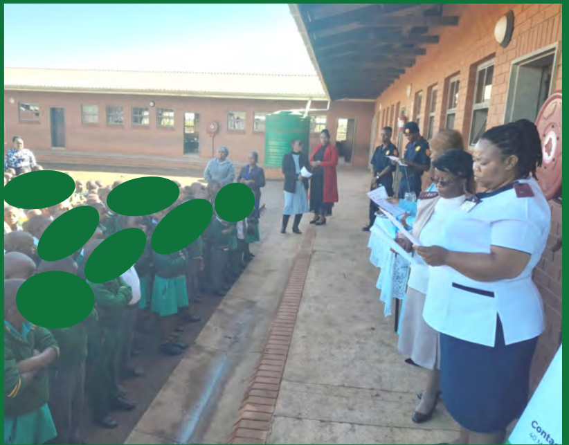
Ndwebu Clinic Outreach Team doing health education.