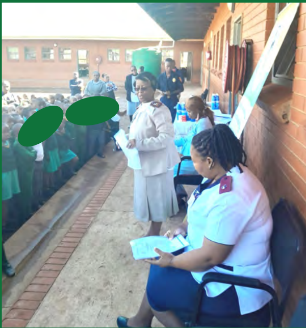
Mrs Zondeka (CPC - IPC) doing health education.