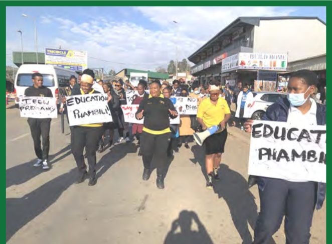
Ixopo Clinic staff marching.