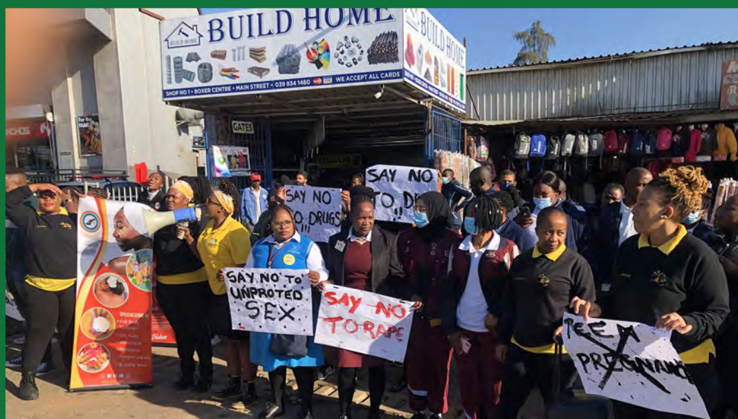
Ixopo Clinic staff and partnering organisations at the Youth Day march.

Ixopo Clinic Adolescent Youth Friendly Services hosted a Youth Day march on the 15th of June 2023 from the clinic premises to Ixopo Taxi Rank as part of the Youth Day celebration.