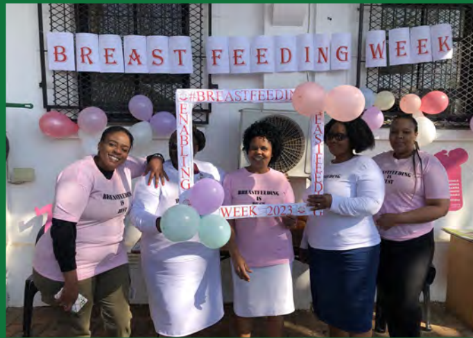
Team at the photo booth.