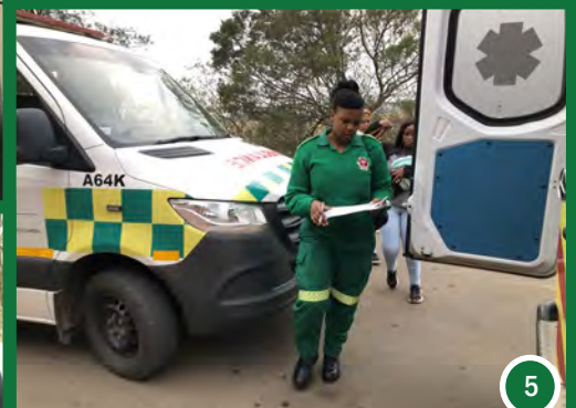
Picture 1 - Paediatric Case Picture 2 - Ambulance Arriving Picture 3 - Doctors and Nurses busy with the child. Picture 4 - Paramedics arriving with the paediatric patient. Picture 5 - Paramedics arriving with the paediatric patient. Picture 6 - Leading team preparing for the drill. Picture 7 - Paramedics with the mother of the child. Picture 8 - Management observing while the doctors and nurses are busy with the patient.