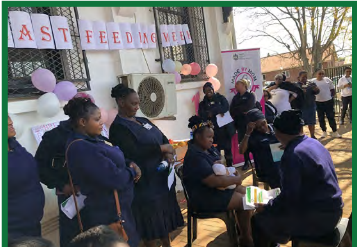
Role play by the Community Health Workers.