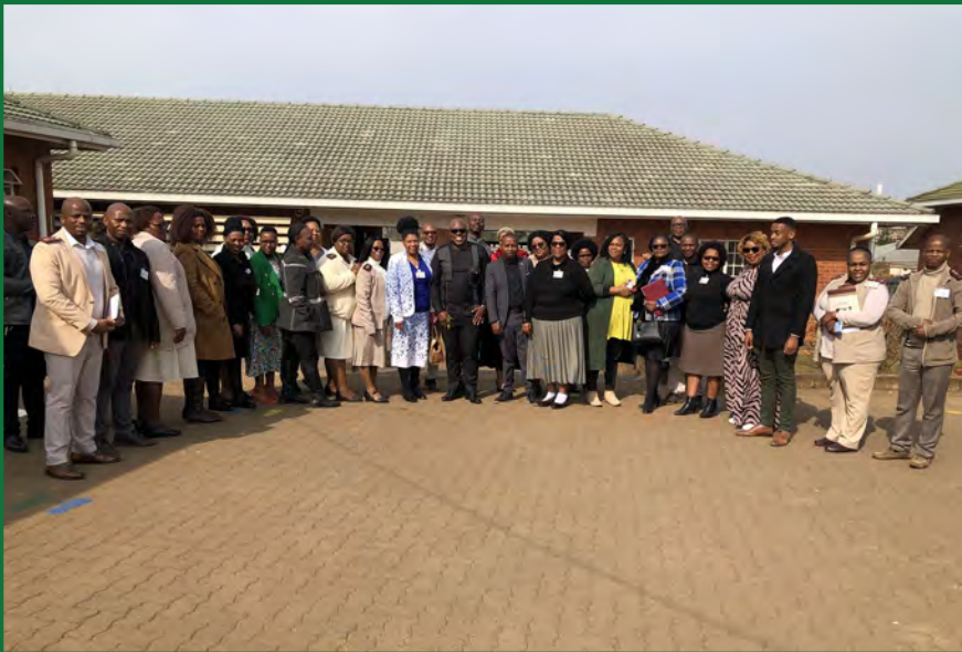
KwaZulu-Natal Legislature team with the representatives from department of public works, KZN health head office, district office and other health institutions within Harry Gwala Health District Office.