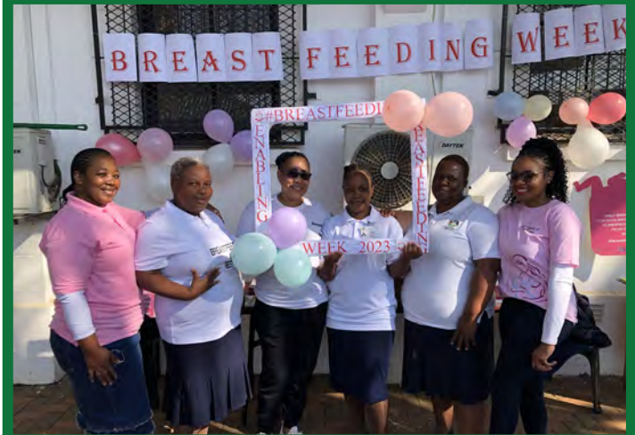
Team at the photo booth.