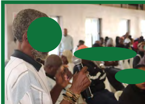
Picture 1 - Discussions during the event. Picture 2 - Sr Mlangeni giving her speech.

Different conversations were held by the stakeholders together with the attendees. The boys were offered a platform where they can hear other boys, and men, share their stories and understand that they are not alone.