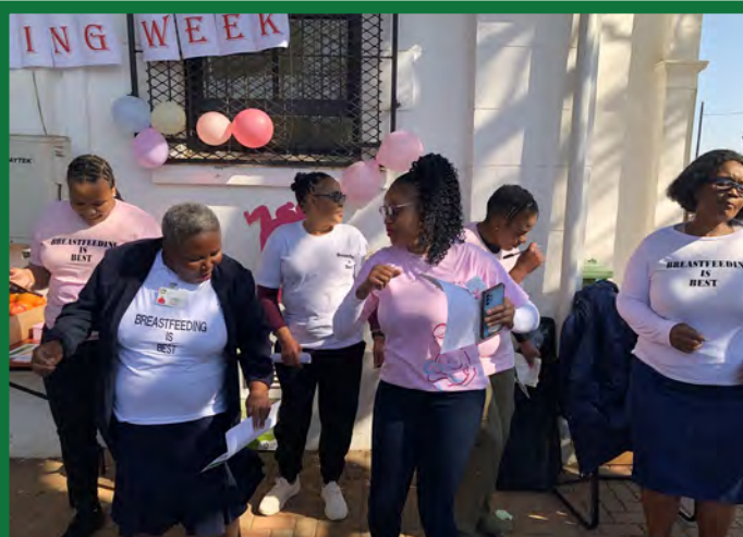
Singing and dancing during the event