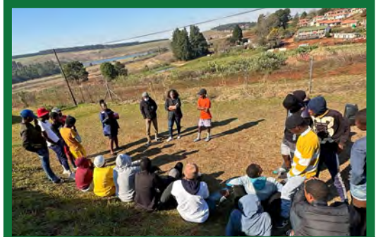
Discussions during the camp.