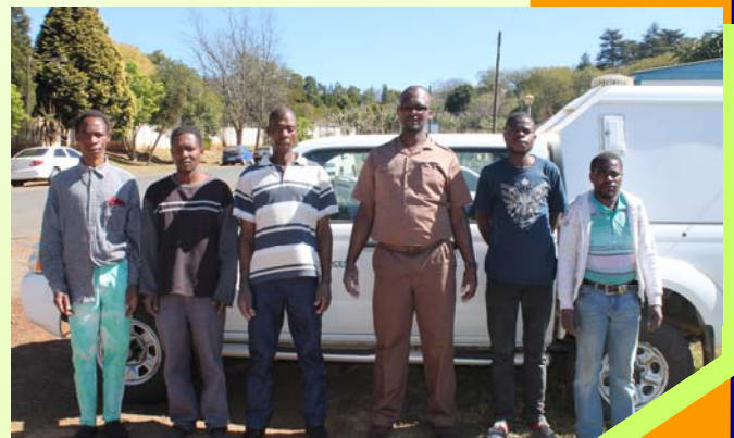
Correctional Services provided five inmates to assist with cleaning on the day

"...A winning team is the one, whose members stick to and carry out their allocated tasks, work towards condensing each contribution so as to produce a desired outcome."