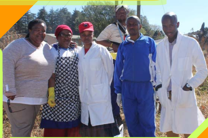
From left: CEO, DENOSA, NEHAWU, Labour Relations Officer and Waste Management Officer.

As part of the Hospital CEO's concerted effort to ensure a creation of a conducive working environment within the Hospital, it is of paramount importance that all stakeholders within CTK community are taken on board about our tactical approach towards achieving the vision of the Hospital. It was out to such conviction that the consultative meeting between the CEO and Organized Labour em-