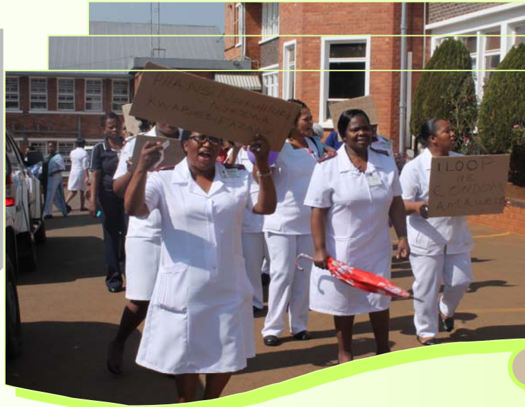
Main pic: Staff members marched throughout the Hospital to raise awareness

"...Apart from acknowledging the role women played in the past, this day is also used to propel their role as frontrunner in the building of a new SA.