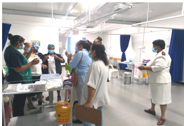
Vaccinators receiving refresher training

Commendations from the CEO were well received by all staff who were happy to share their experiences since the beginning of vaccination.