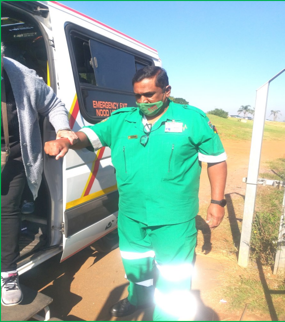
Paramedic assisting client at the Vaccination site