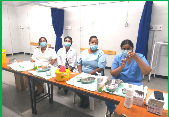
Staff members preparing vaccines ahead of the vaccination drive