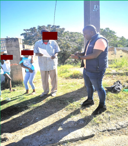
PRO during vaccination social mobilization