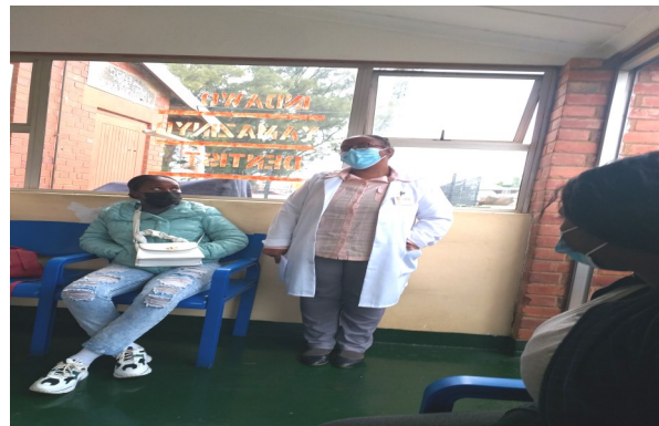
Social Workers and Gateway Clinic Operational Manager during commemoration of the Child protection week