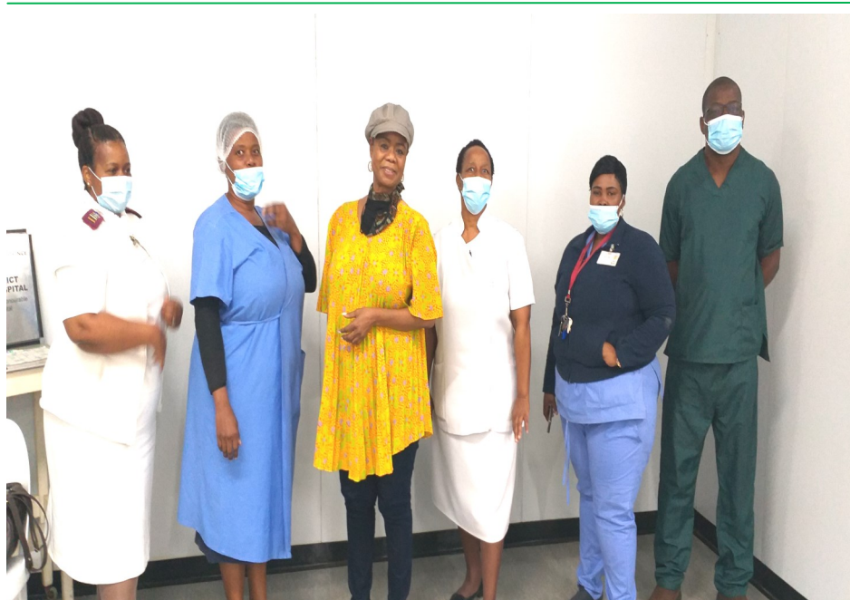
Clairwood hospital staff with Actress Thembi Mtshali

South Africa has so far vaccinated over 7 million people and Clairwood hospital is among the facilities which are contributing to these figures and continues to ramp up its vaccination programme against COVID-19 virus. The hospital health care workers are working tirelessly to ensure that vaccination becomes a good experience for everyone. It is a common knowledge that there are less number of people who have