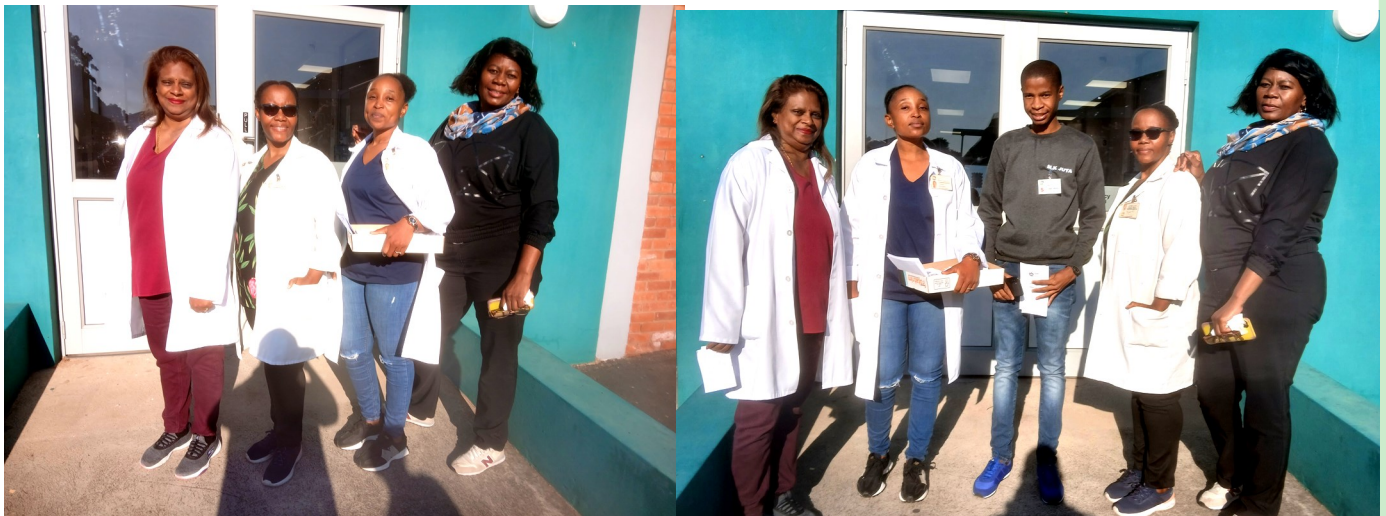
SOCIAL WORKERS DURING CHILD PROTECTION WEEK

Child abuse and neglect are a silent epidemic hidden in the shadows of society. In South Africa alone, according to Makwati J. and Snyman SP from South African Medical Journal in 2017, over 5000 cases of child abuse are reported every year and still a high number of cases go unreported. With these sobering statistics in mind, a team of social workers from Clairwood Hospital embarked on a campaign to raise awareness for child protection.