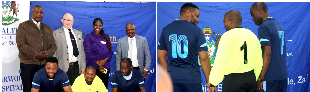
SOCCER TEAM PLAYERS DISPLAYING THE NEW SOCCER KIT