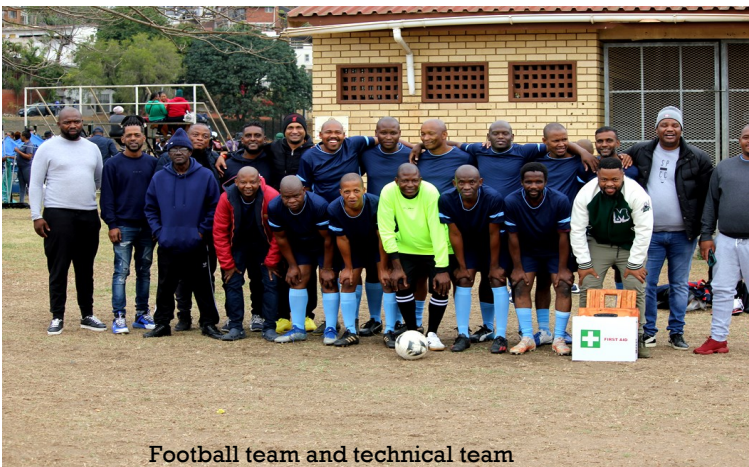
Football team and technical team