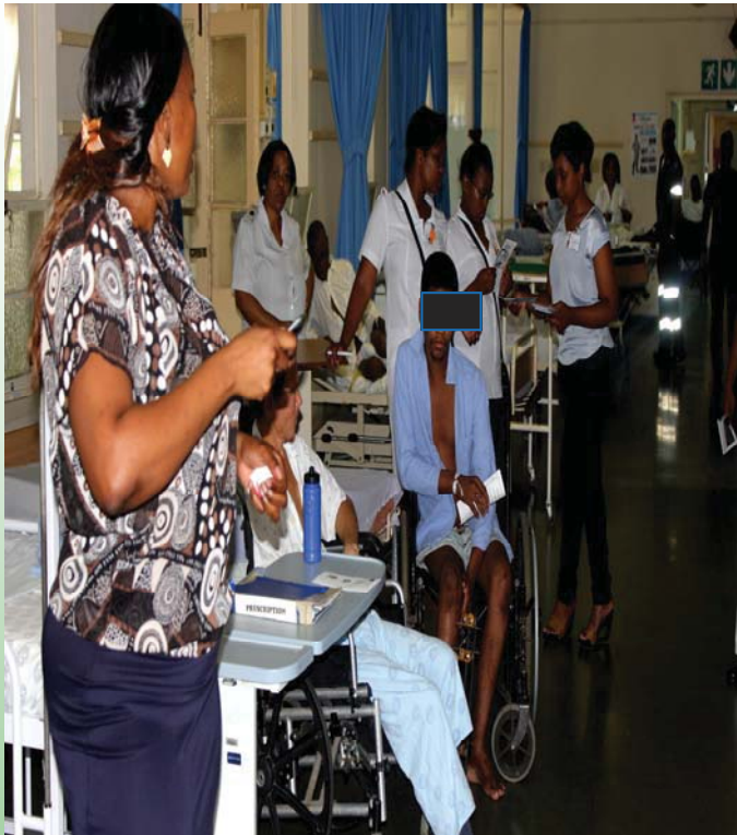
Social work dept. during 16 days of activism campaign