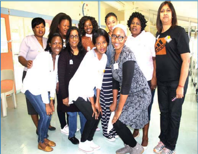
De la crème from Clairwood Hospital