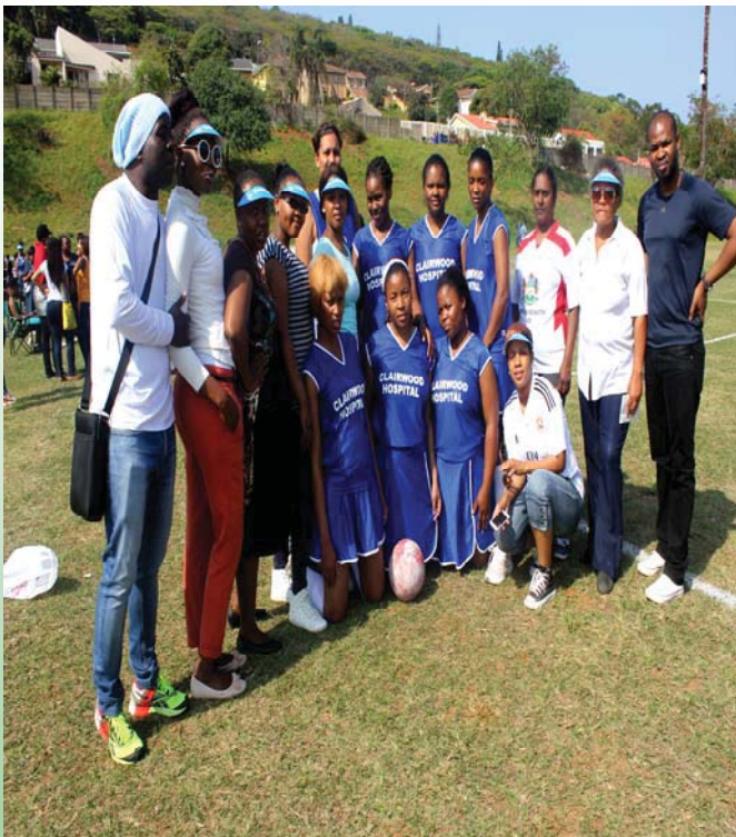
Netball team during the district sports tournament