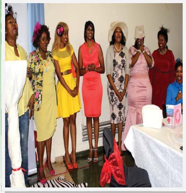
Staff members during Women's Spring event