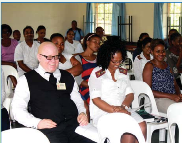
Injabulo ibhalwe ebsweni kubasebenzi ku Mkhuleko wokuphetha unyaka ( Ebenezer)