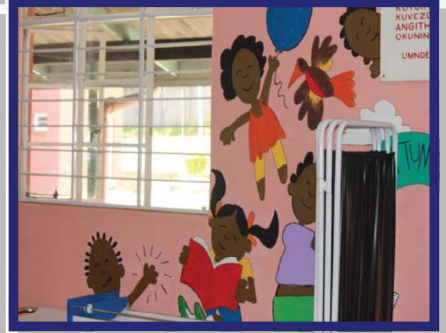
Coptrust volunteers at Clairwood Hospital, Paediatric clinic during their outreach programme.

The fulfillment that one can get out of working for God through the community by changing lives cannot be measured, this was echoed by The Community Outreach Program Trust (COPtrust) Volunteers who came to decorate the children's clinic at Clairwood hospital.