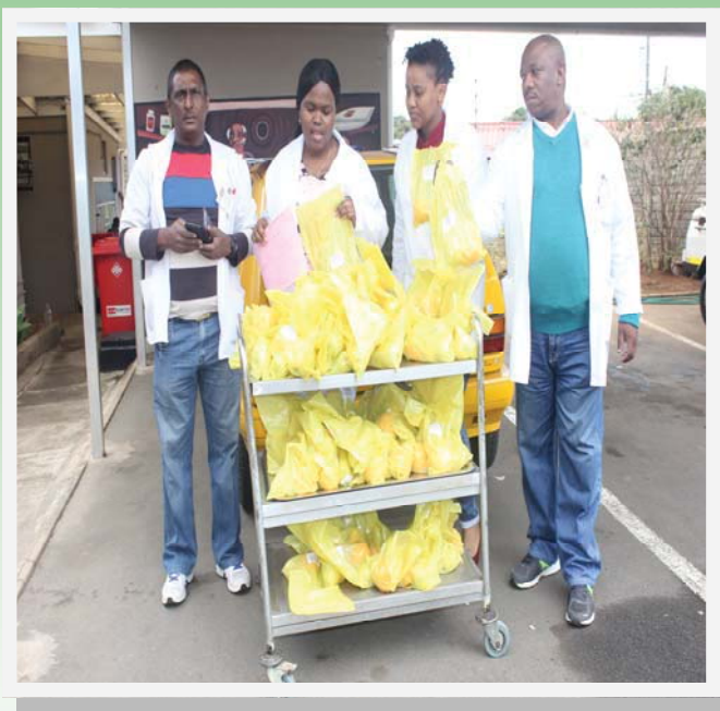
Pharmacy staff during Pharmacy week initiative