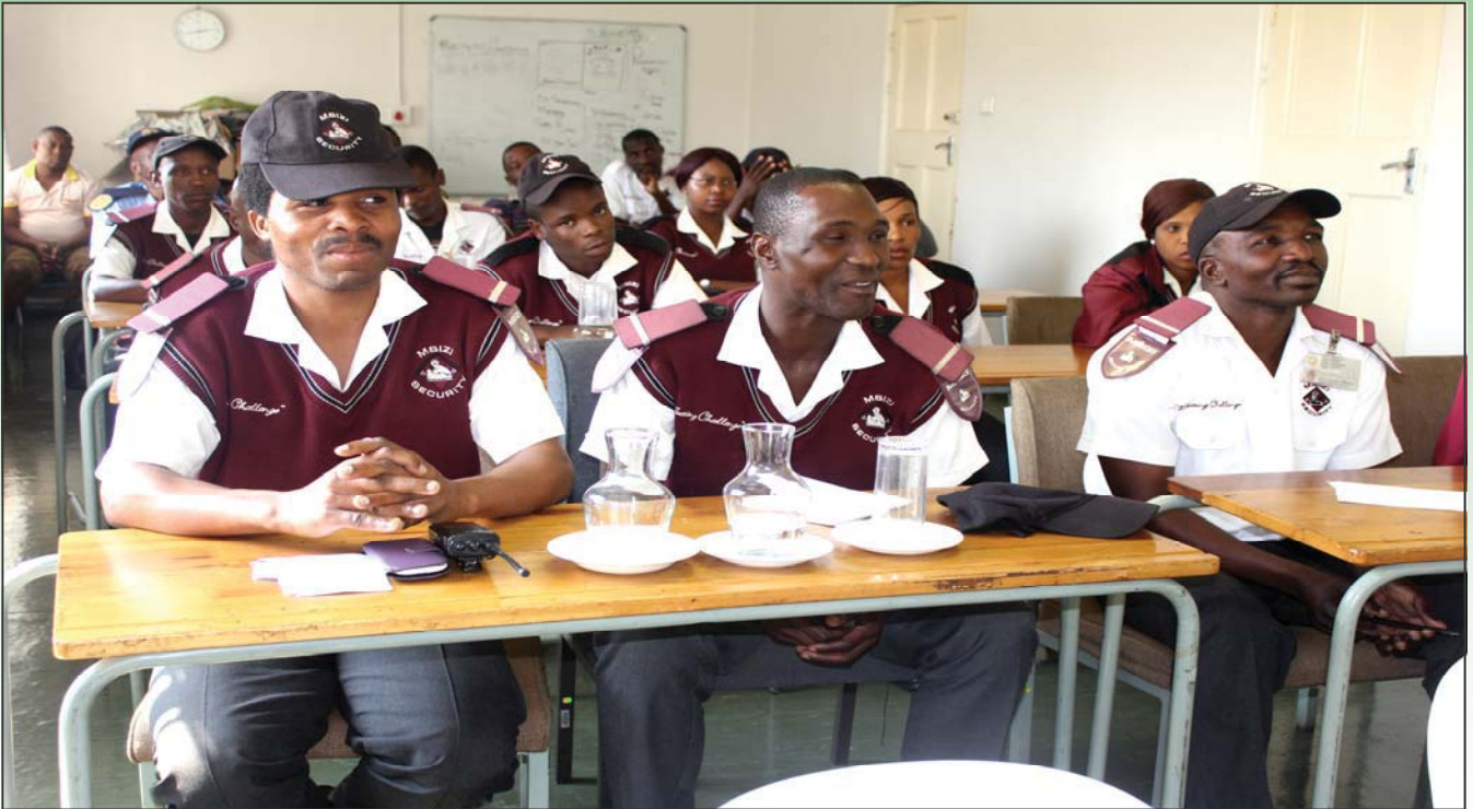
Security officers during Customer care workshop

Any organization's success depends on how much effort it puts in customer care. The Batho-Pele principles are the most important principles that guide all public servants on how to accelerate service delivery effectively and efficiently.