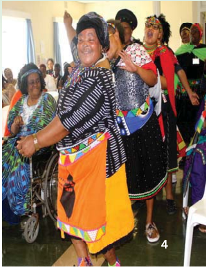
Pic 1,2,3,4 were taken during Heritage day celebration