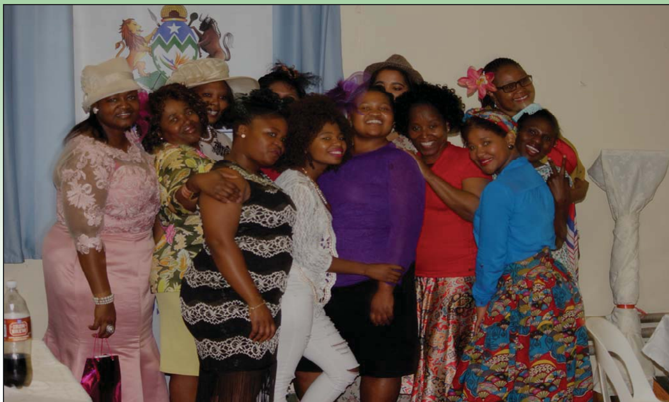
Hospital staff welcoming summer with their beautiful bright colours

Clairwood Hospital women's celebrated the end of women's month on 1st September 2015, together with spring day to welcome the summer season. Anyone could tell that this day was arranged for and by women. The standard was so high one would have mistaken the day with Durban July event.