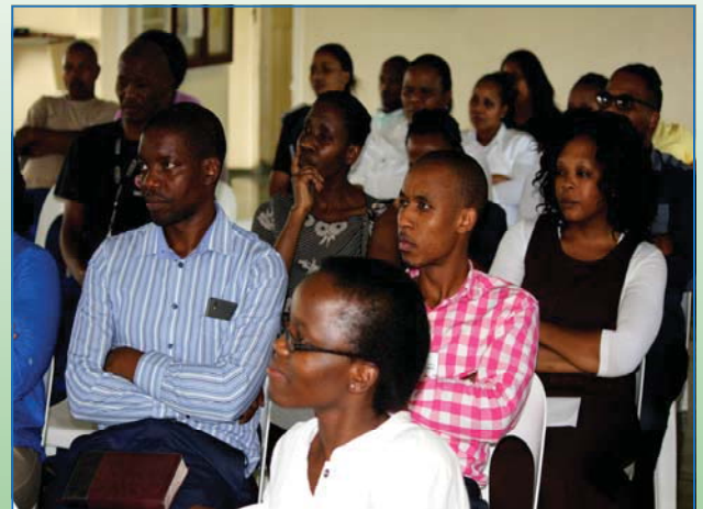
Kwakubuye kushube isimo kuwo lomkhuleko wokvala unyaka intshumayelo igaya kwasani