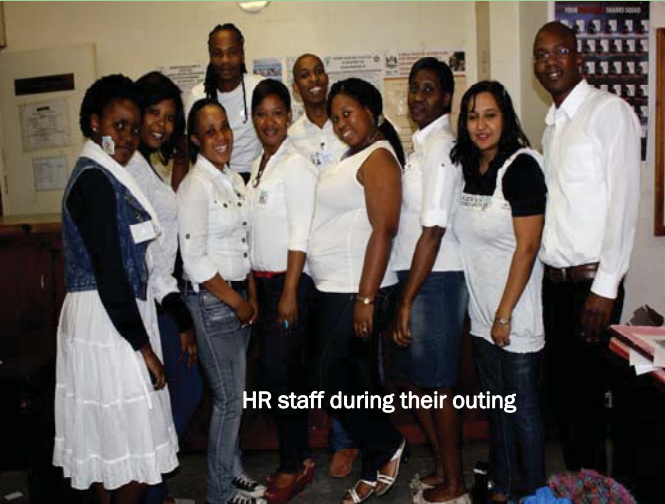
HR staff during their outing