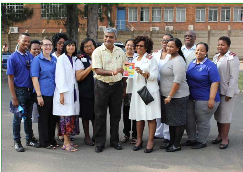
Medipost and Clairwood Hospital staff during CCMDD launch