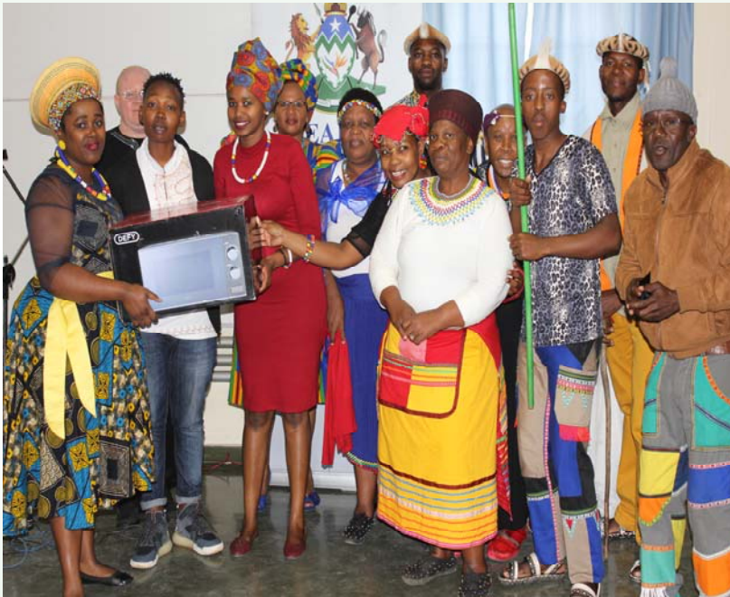
Finance component receiving the 1st prize during heritage Day