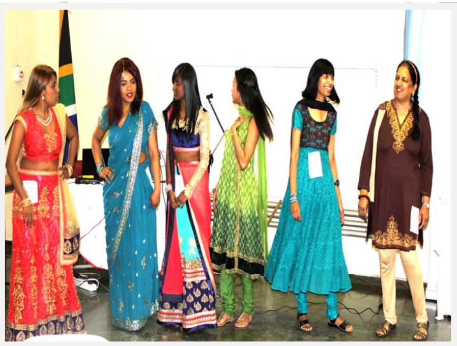
Staff members showcasing outfits during heritage Day