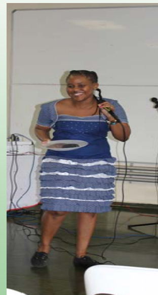
Ms. Tlaila during heritage Day