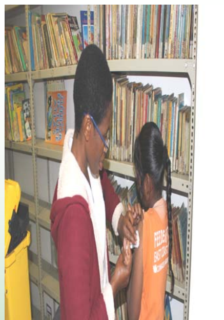
PHC team during HPV Campaign at Ningizimu special School