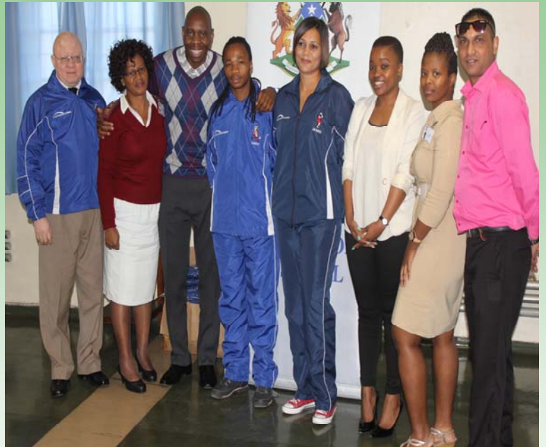
CEO, Deputy Manager Nursing and Hospital Soccer and Netball Players receiving track suit sponsor .