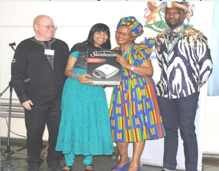
Management with Pharmacy Manager during Heritage Day