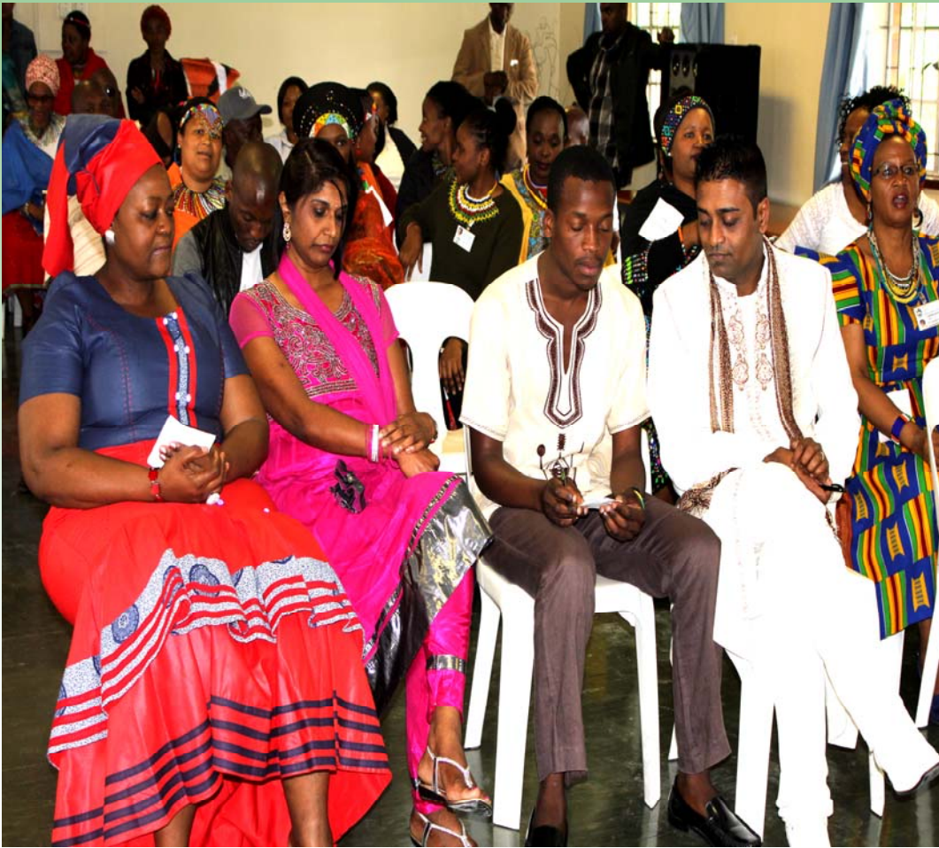
Staff members attending heritage Day