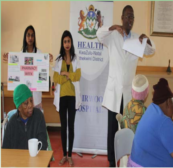
Pharmacy staff during Pharmacy week At Issy Geshen