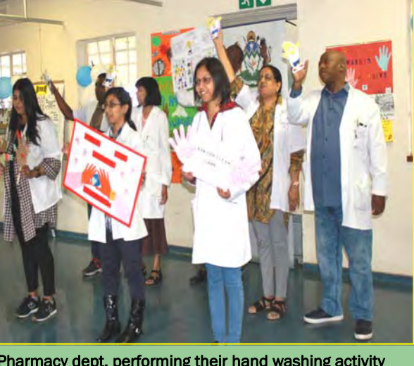
Pharmacy dept. performing their hand washing activity