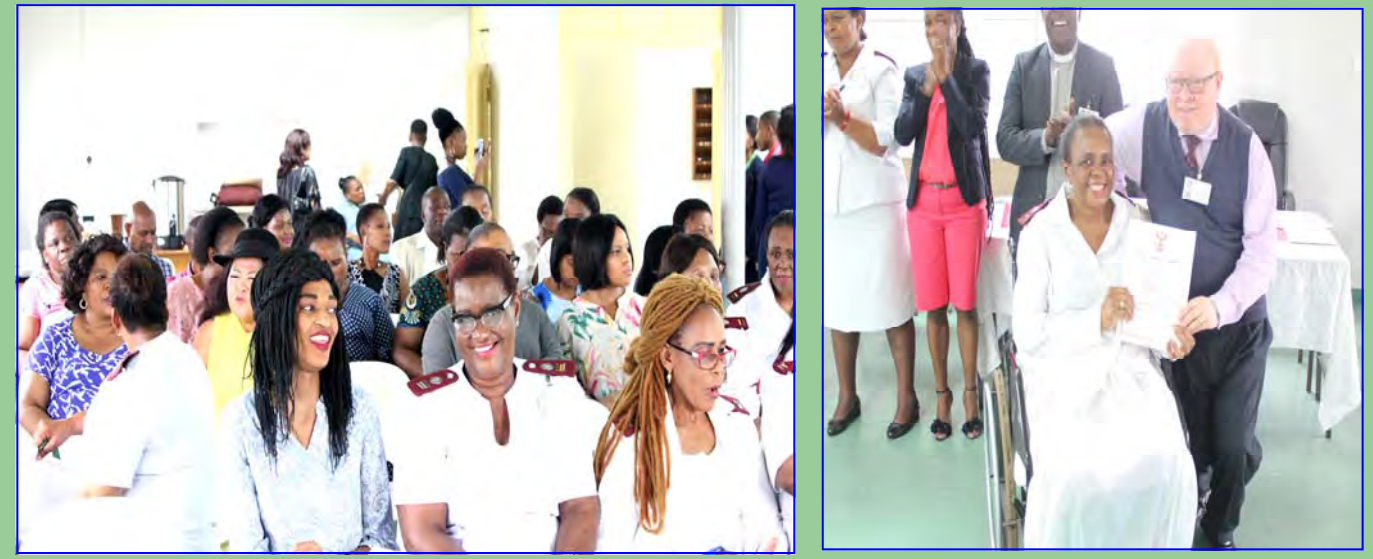
Award recipients enjoying speeches on their special day