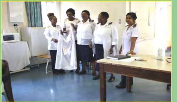
Ward 02 and KMC preparing to showcase their item