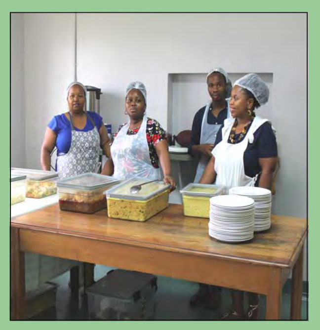
HR Staff waiting to serve employees at the long service award ceremony