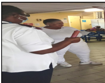
P. 01-02 Condom week awareness.