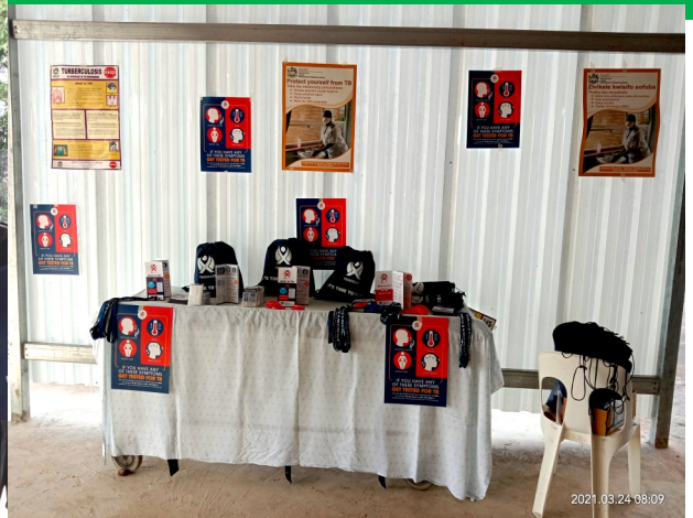
TB day screening table