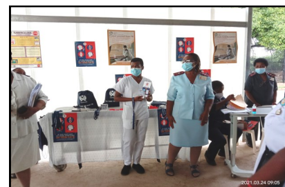
P. 04 TB Awareness Day