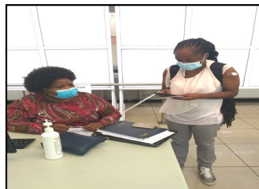
P.3 COVID-19 vaccination