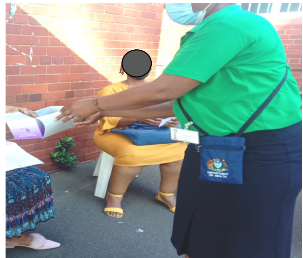
A client taking condoms for her grandchild

With the increasing numbers of patients diagnosed with sexually transmitted infections visiting our facility, the hospital plan is to spread campaign to the community and local factories in the area. Monitoring effected to evaluate the impact of such campaign in behavioural changes.