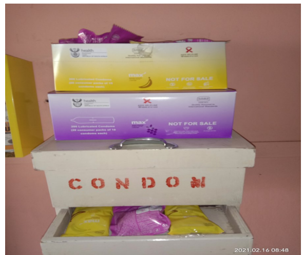
Males and female condoms dispensing box

Sexually transmitted infections are prevalent with people who are sexually active with more than one partner and not practicing safe sex . Discussion around ones sex life hardly takes place in families due to the embarrassment, cultural and religious factors. The fear of talking about sex life and sexually transmitted infections and diseases makes it difficult for one to seek help in health care settings. Clairwood hospital without fail always ensure that STI health education and condom distribution takes place every year. The primary aim is to give information to the public about STIs and to promote not just the use but proper use of condoms .