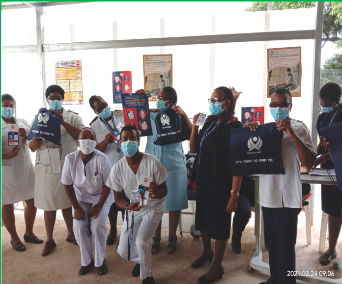
Staff during TB day event