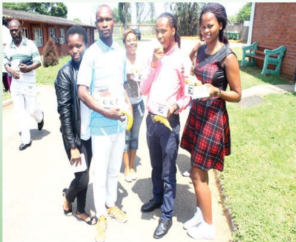
Hospital Staff members during P.R Open day.