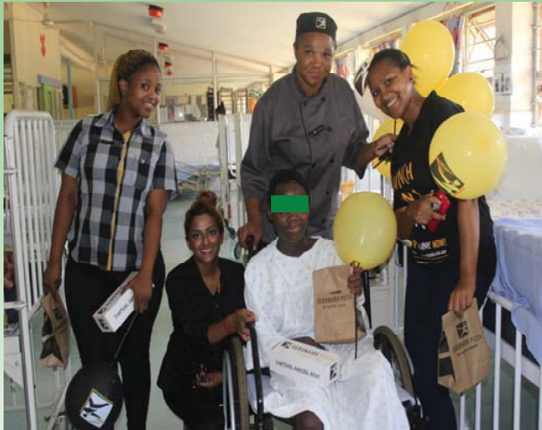
Debonairs handing over the gifts to Children at ward.