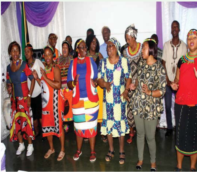
Hospital Choir entertaining during quality day.