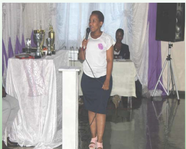
Waste manager doing presentation about the quality they did in their job.