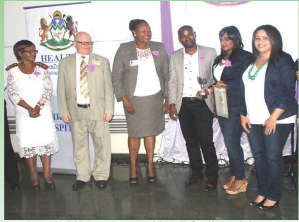
Hospital Management with O.T Staff receiving an award.