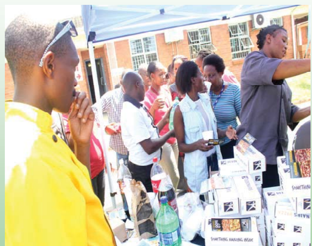
Debonairs team during Public Relations Day..