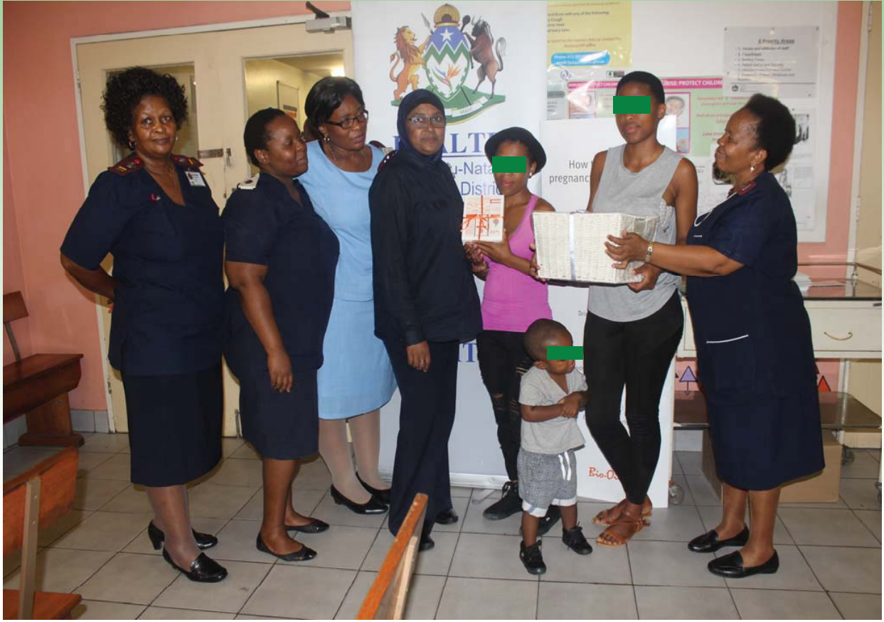
PHC Professional Nurses with customers during Pregnancy awareness day

The Department of Health uses pregnancy awareness week to strengthen pregnancy education and stress important issues that promote healthy pregnancy and safe motherhood.