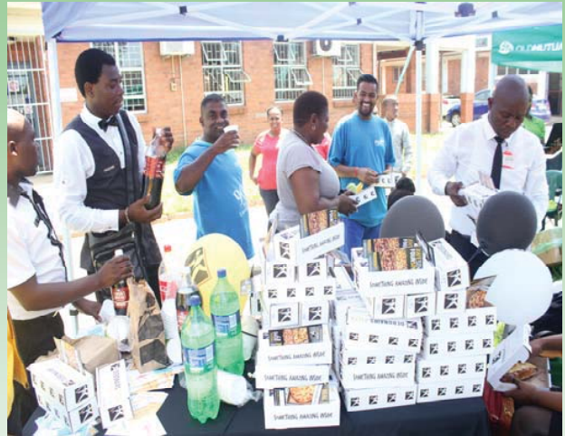
Refreshments from debonairs during P.R Open day