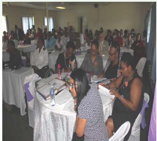
Judges and audience listening presentations during quality day.