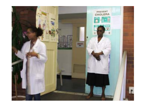
Display in the pharmacy on the pharmacy week