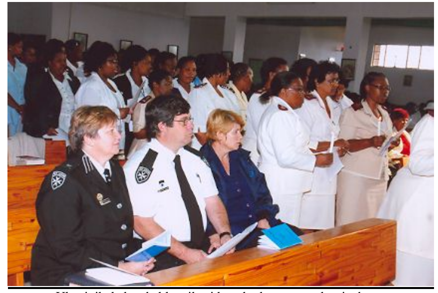
Ukuzinikela kwabahlengikazi kwethu kuyancomeka siyabonga