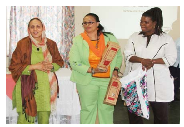
Guest speakers handing out gifts to the Hospital chaplain