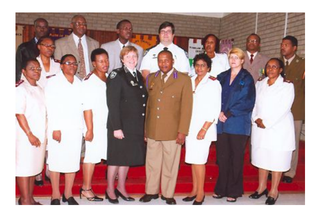
Managers of public service department

The collection of the day went to the Zamimpilo HIV / AIDS committee which is a home based care organization.