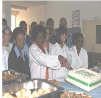
STAFF CUTTING THE CAKE