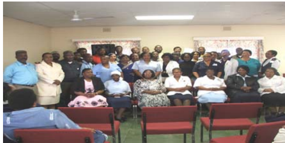
Long service excellence awards for 20 years staff