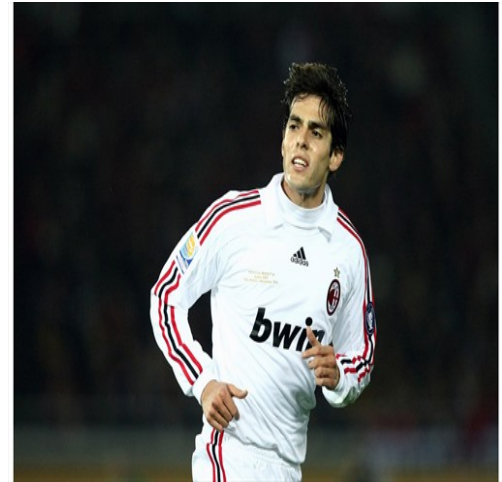
Kaka the AC Milan and Brazil player who was named the 2007 world footballer of the year

award is for the club as a whole. Foremost in my thoughts is the Fondazione Milan [the club's charity foundation], an organisation I'm closely involved with." With Kaka what you see is what you get. I'm happy to have helped AC Milan add their name to the list of tournament