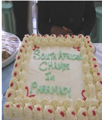
CAKE FOR STAFF

To all the staff who contributed is such achievement.