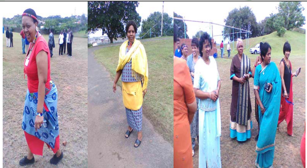
Pics taken from Heritage Day celebration