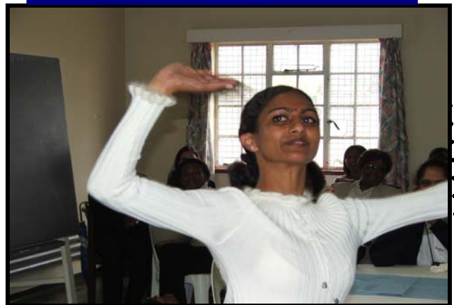
Who said only Zulus can do Zulu Dance.