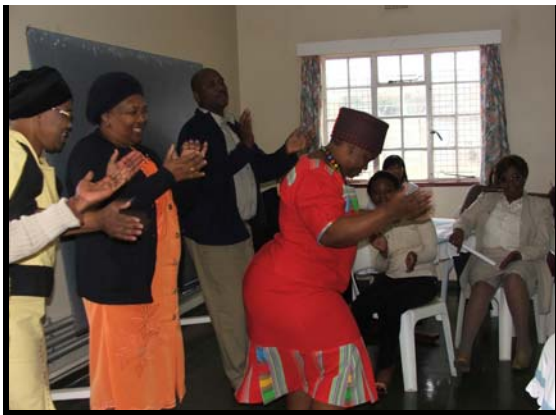
Zulu Dancers doing their thing