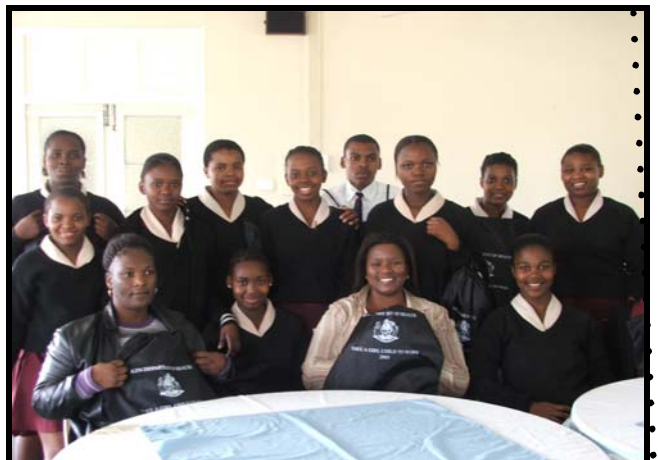
Abafundi base-Lamontville High School

Njengomnyano wezempilo siyaziqhenya kakhulu ngokuncanyana esakwenza ezimpilweni zalaba besifazane abancane, sengathi bangakhula babe omama obaqotho kusasa.