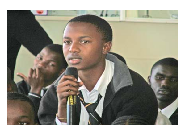
Lelibhungu lalizitika ngembuzo ye TB e AJ Mwelase