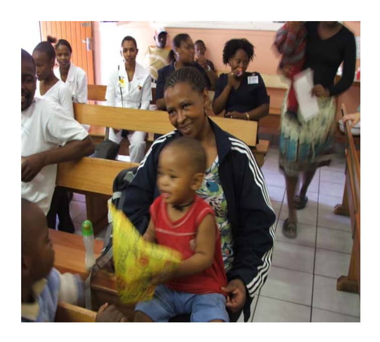
Kids receiving goodies on Celebral Palsy week