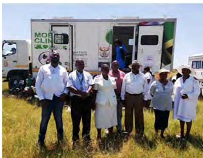
Qo qo qo operation READ MORE ON PAGE 2