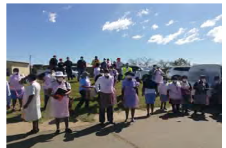
Mass screening launch READ MORE ON PAGE 7