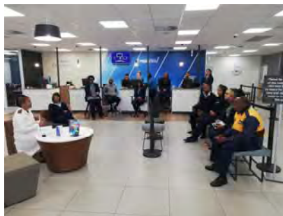
COVID-19- awareness's READ MORE ON PAGE 3