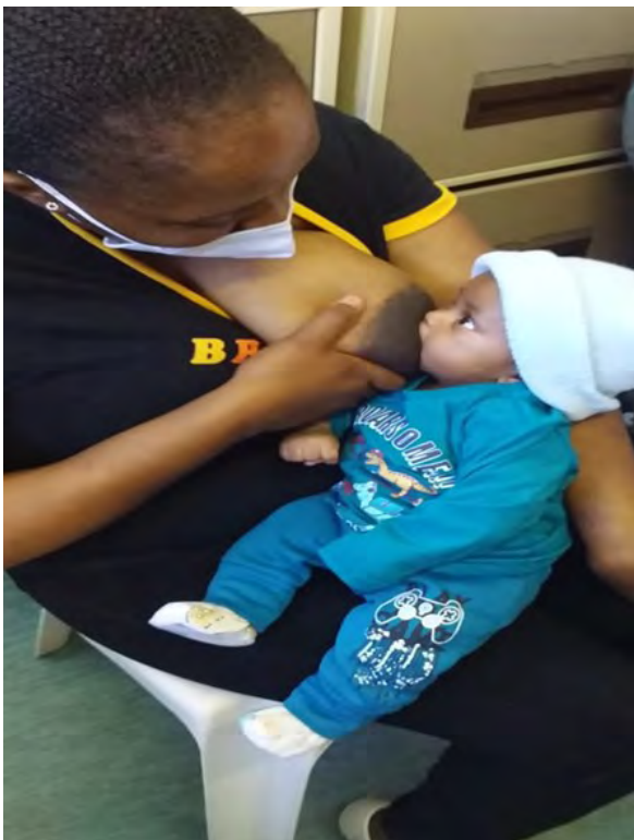
A mother demonstrating how she breastfeed her baby.

They were also informed about the possibility of HIV transmission if the virus is not suppressed. Mothers who were HIV negative were also advised to take PREP (especially if they are sexually active during breastfeeding). Breastfeeding women were also taught about safety of breastfeeding while on medication (PREP, ART, Contraceptives). Also false beliefs/ myths that were contributory factors to poor breastfeeding were also addressed.