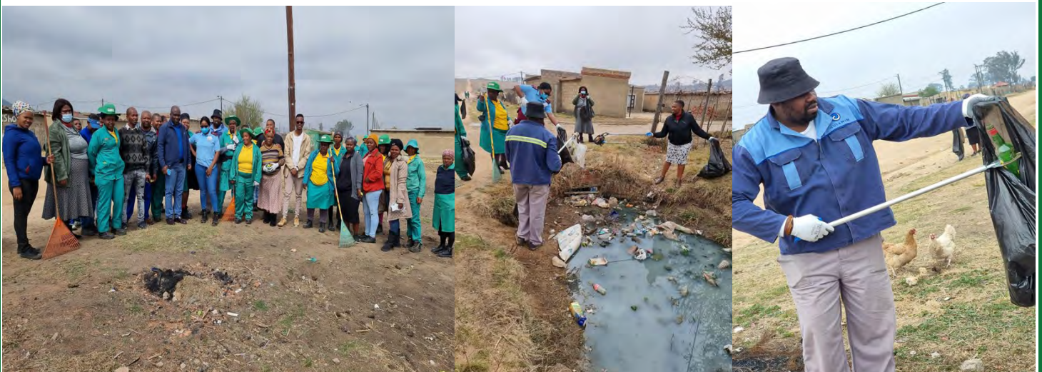
Participants on the day of the campaign

The clean up campaign was a huge success and hope that the community and all departments will come together to maintain the cleanliness