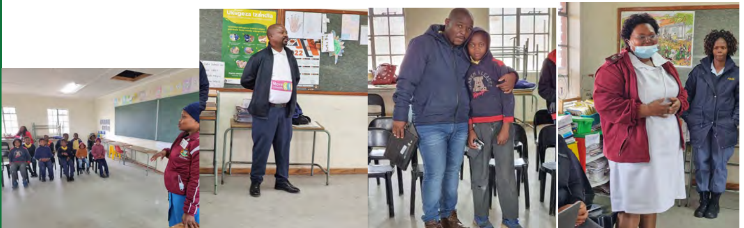
Activities on the day

She also mentioned that Covid-19 vaccination is still available and still an active program facilitated by outreach team.