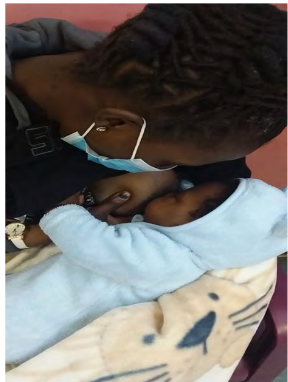
Another breastfeeding mother being taught the right technique to breastfeed