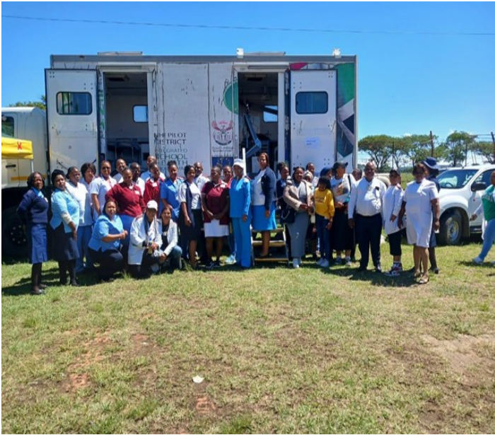
I team yase wasbank Clinic.

Isibhedlela Kubantu senziwe ku Lwezi (November) 2024 Wasbank ngaphansi kwesigodi I kameelkop . Kwakukhona abahlengikazi , odokotela , I physio , I rehab kanye ne pharmacy.