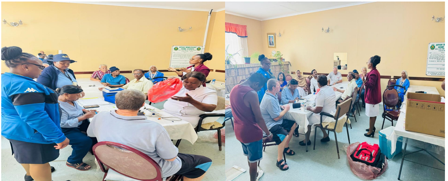
Healthcare workers addressing people at the old age home.

The Glenridge outreach team commemorated the World diabetes day at the ABH old age home on the 19th of November 2025. Screening and testing for communicable diseases and non communicable diseases was done together with health education. #DiabetesAwareness #TakeControl #KnowTheSigns