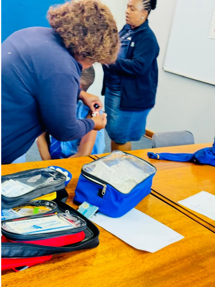
Screening was conducted

Health screenings were conducted at Sarel Ciliers High school on the 6th of September 2024. Optometrist, Dental services , Audiologist, fine motor skills and nutritional status was amongst the services provided on the day.