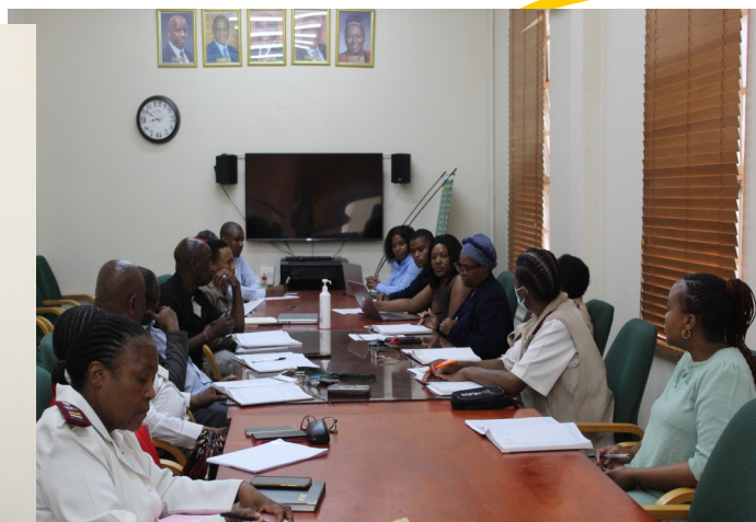
Dundee hospital board with the internal auditors