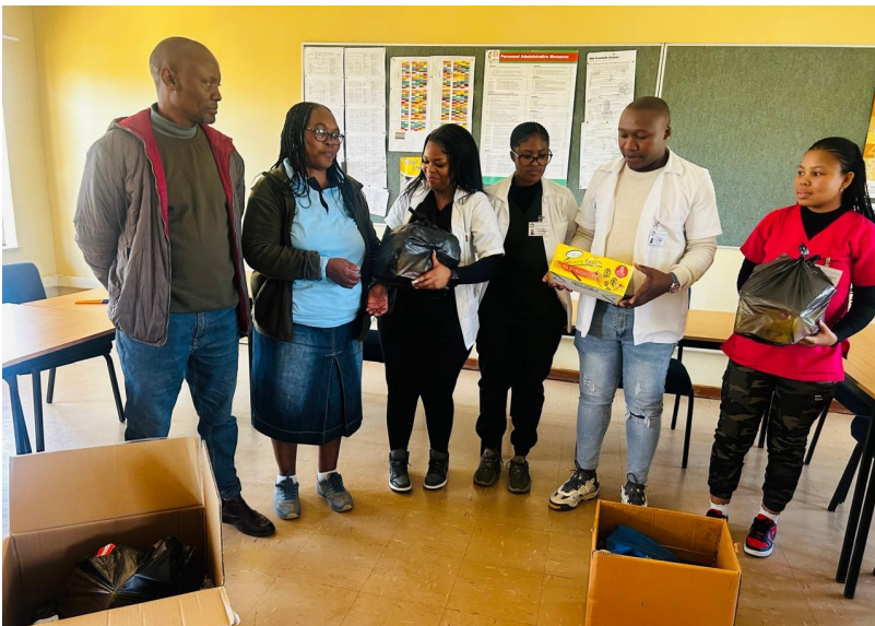
The handing over of school shoes