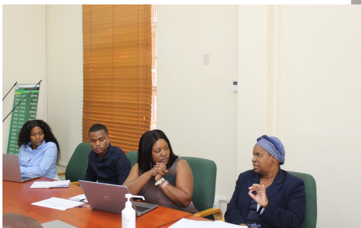
CEO with the internal auditors