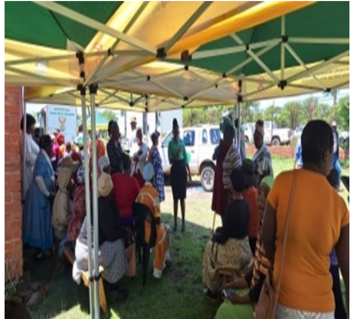
I CHW ikhuluma nomphakathi wase kameelkop.