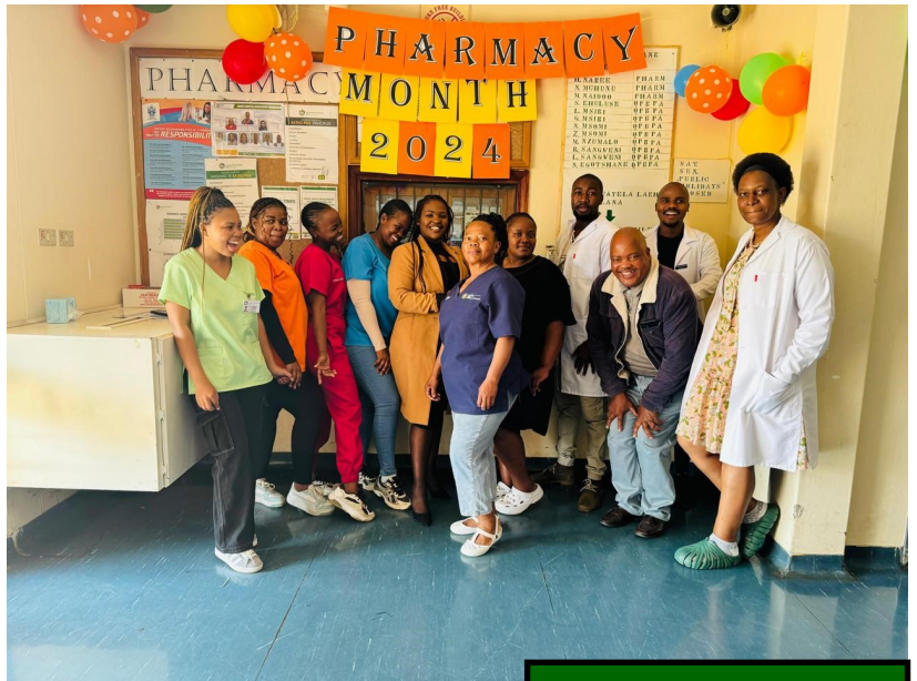
The Pharmacy team

We would like to thank the pharmacy team and those that participated in making our activities a success.