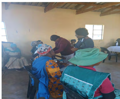
Healthcare workers providing health services