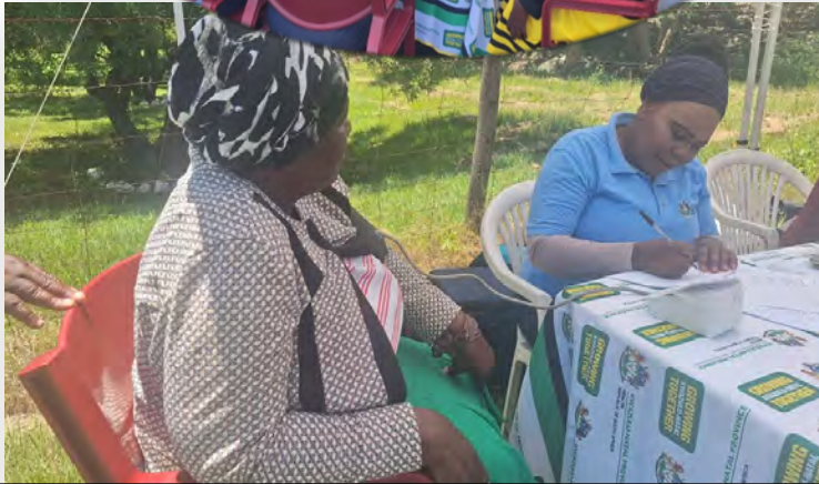
CHW providing health services to the community member