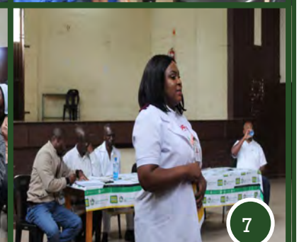
Picture 1- community screening for TB