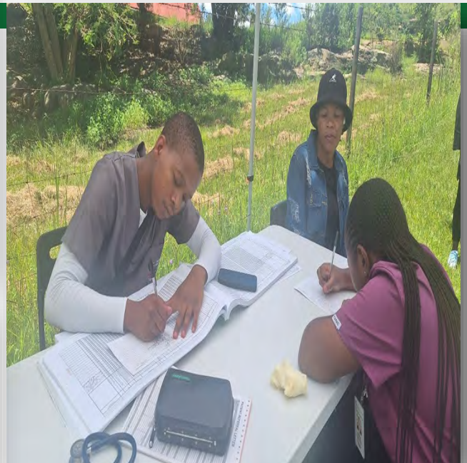
DOCTOR AND PHYSIOTHERAPIST OFFERING HEALTHCARE SERVICES TO COMMUNITY