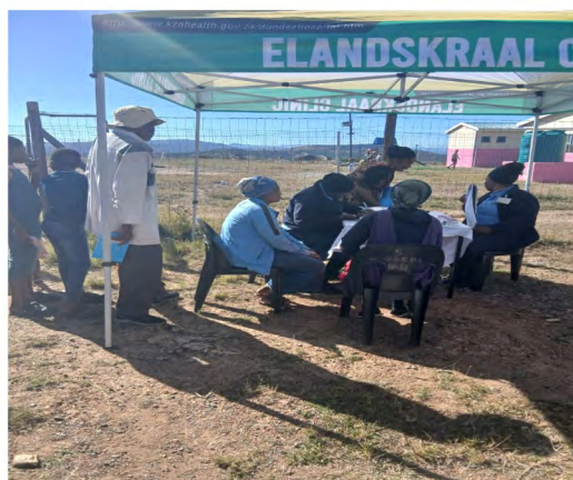
Community waiting to be assisted