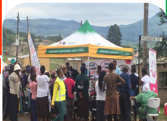
Sithembile Clinic Community at Entabeni Street

Support from the Health District Office was greatly appreciated as they also supported the initiative with the Dental and Eye Services.