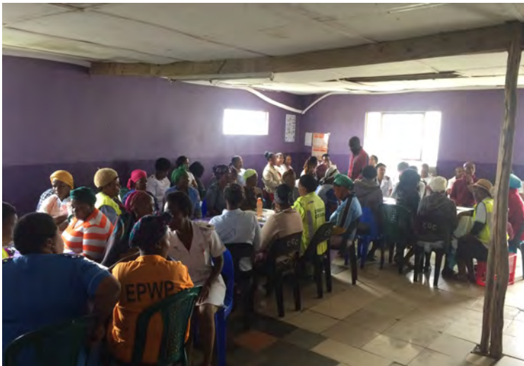
COMMUNITY DIALOGUE AT KWASITHOLE HOSTED BY EMPATHE OUTREACH TEAM