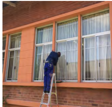
DUNDEE HOSPITAL RENOVATIONS UNDERWAY