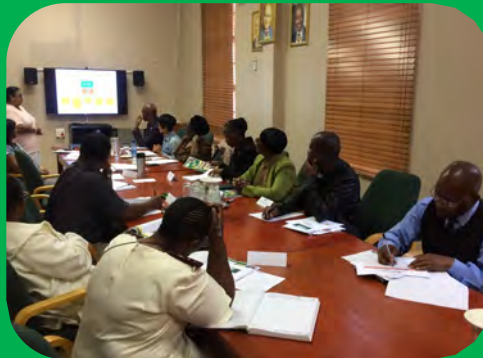
INDUCTION AND TRAININGS FOR HOSPITAL BOARD AND CLINIC COMMITTEES