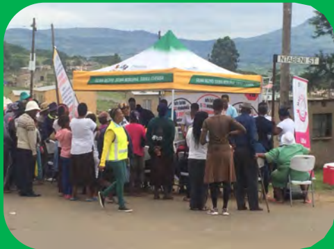
TB AWARENESS CAMPAIGN