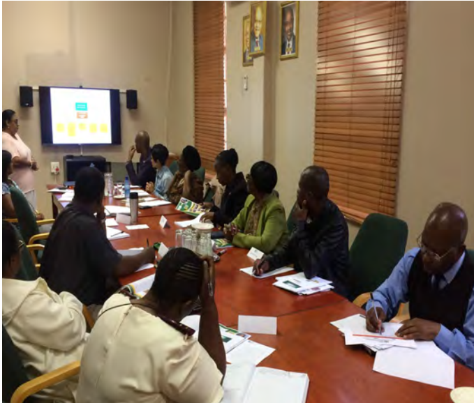
Endumeni and Nquthu Sub District Board Members

The joint sitting for the Training and Orientation of the Board Members for Endumeni and Nquthu Sub District alongside the Managed was arranged at Dundee Hospital on the 11th January 2018.