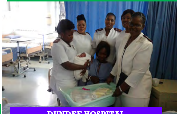
DUNDEE HOSPITAL WELCOMES CHRISTMAS BABIES WITH GIFTS