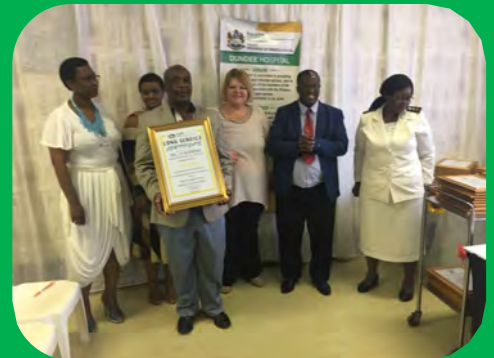
DUNDEE HOSPITAL QUALITY AND LONG SERVICE AWARDS