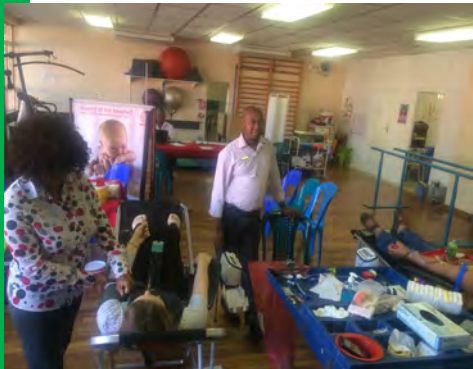
DUNDEE HOSPITAL DONATES BLOOD