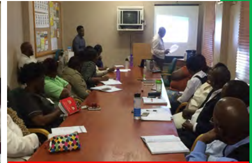
ENDUMENI & NQUTHU SUB DISTRICT ETHICS IN THE WORKPLACE WORKSHOP