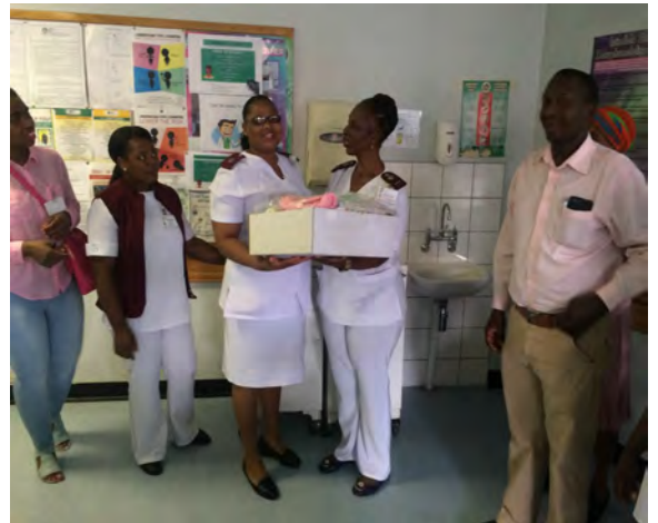
DUNDEE HOSPITAL MATERNITY RECIEVES GIFTS FROM THE LOCAL CHURCH