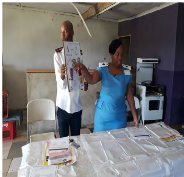
Empathe Outreach Team at KwaSithole Health Awareness Campaign

This day was conjoined with the Mobile Clinic which uses the similar site to visit the community Kwa-Madonsela Tuck Shop. This initiative was greatly appreciated by the community within this area as they got an opportunity to be enlightened on the health services as some overcame the fear of inserting Implanon s and some were booked for Medical Male Circumcisions.