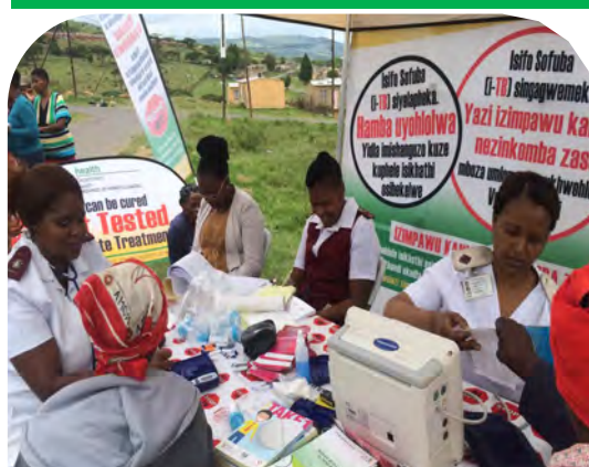
Endumeni Sub District Clinicians Checking Vital Signs.