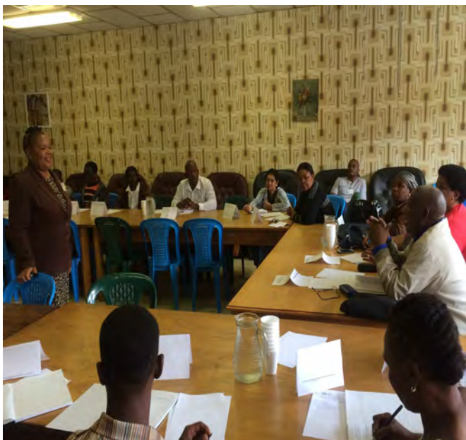
Endumeni Sub District Clinic Committee Members

Umzinyathi District has 53 fixed PHC facilities and 13 Mobile Clinics therefore it is mandatory that the Clinic Committees cover and cater to the PHC facilities as per the requirement to ensure that there is governance structures that oversees and the PHC facilities are accountable to.