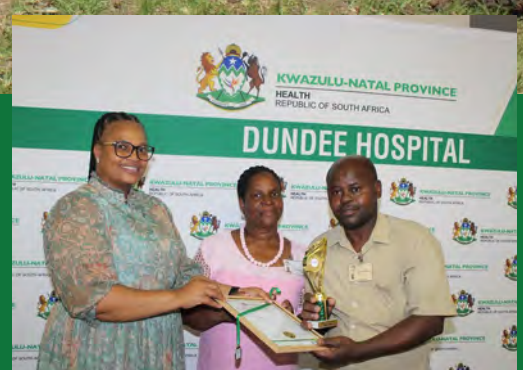
QUALITY CELEBRATION DAY