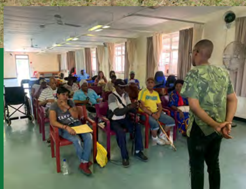
VISUALLY IMPAIRED MEETING