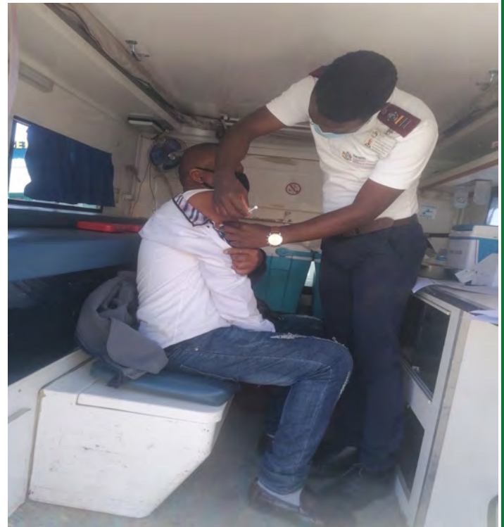
INDIVIDUAL VACCINATING AT THE MOBILE AT THE RANK

Endumeni residents coming for shopping & other activities in town got an opportunity to vaccinate & killed two birds with one stone.