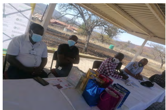
The TB Coordinator , Helpmekaar police and Elandskraal nurses attending the open day