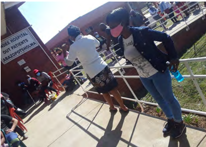
DUNDEE NURSE EDUCATING PEOPLE ABOUT TEETH

Cut down on how often you have sugary foods and drinks. Visit your dentist regularly, as often as they recommend . Limit your coffee intake.