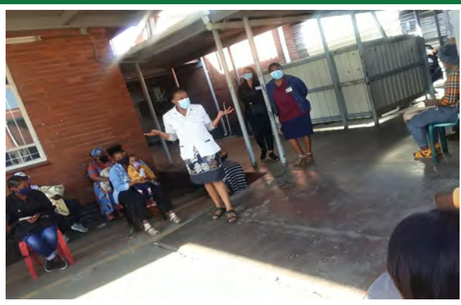
THE NURSE IS TEACHING PEOPLE ABOUT THE HEALTY DENTAL CARE