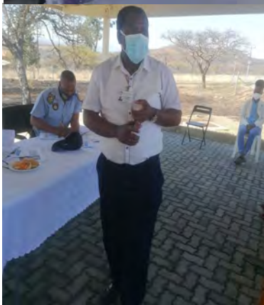
Open day at Elandskraal