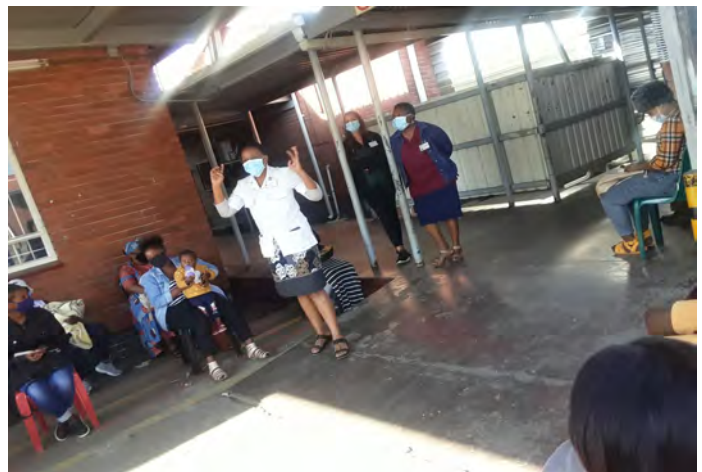
THE NURSE EDUCATING PEOPLE AT THE GATEWAY CLINIC