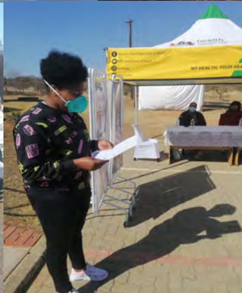
Open day at Rorkesdrift