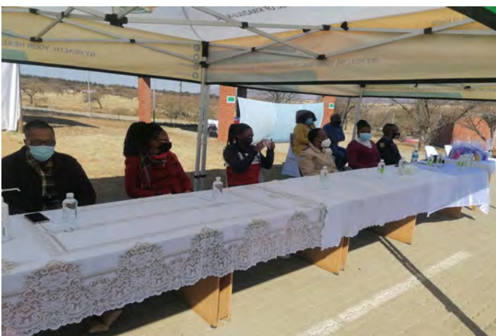
The nurses were holding an open day event at Rorkesdrift clinic