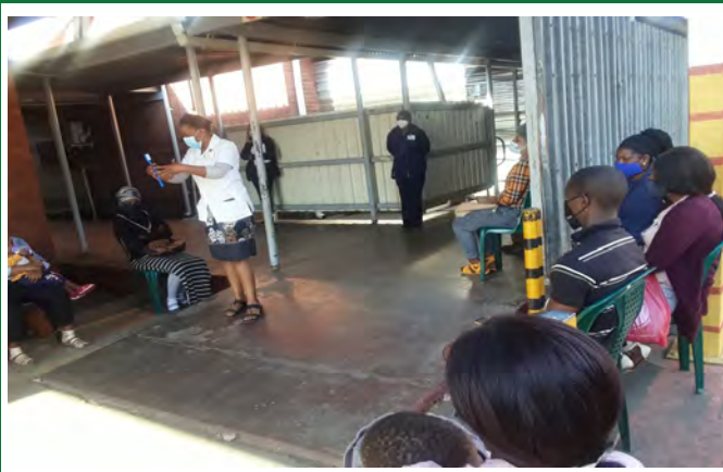
EQUIPING NURSES ABOUT THE IMPORTANT OF CHANGINMG TOOTH-BRUSHES