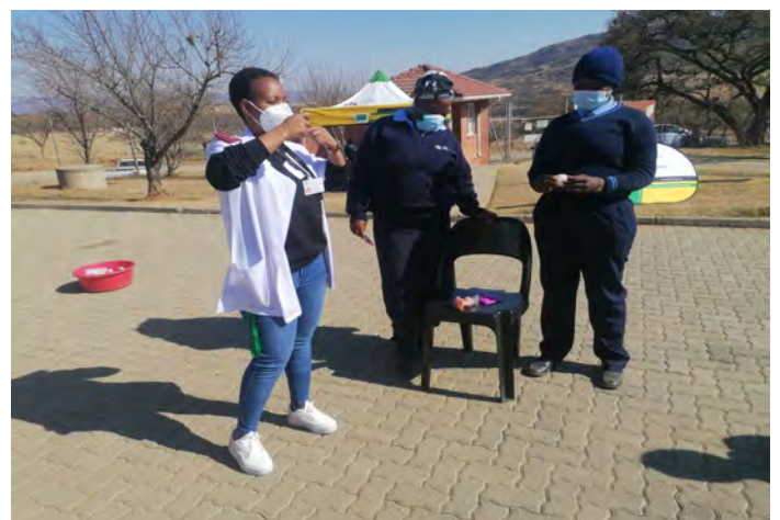
The Rorkesdrift staff were at the Rorkesdrift clinic