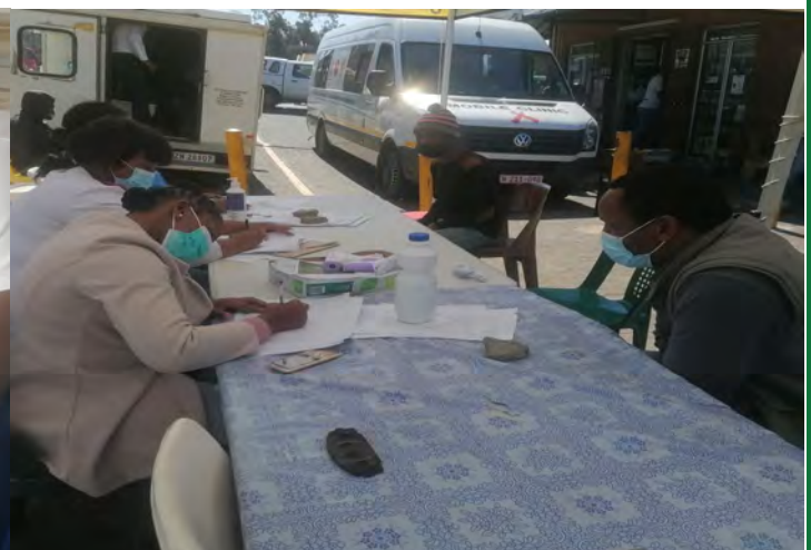
DUNDEE NURSES REGISTERING PEOPLE AT THE TAXI RANK

"I AM VACCINATING BECAUSE I WANT TO PROTECT MY FAMILY, MY COLLEAGUES AND PEOPLE THAT HAVE SURROUNDED ME", SAID ENDUMENI MUNICIPALITY WORKER.