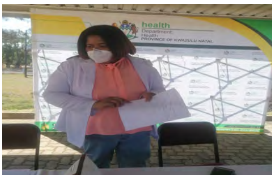
The MC was presenting the open day event

You can break the silence of Violence by assisting the victims with empathy and care; inform victims of their rights and opinions. You can offer practical support, such as accompanying the person to the police