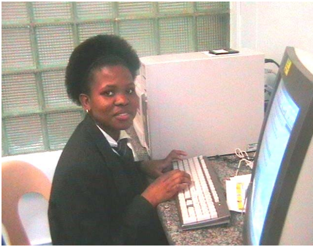
Slindile Gwala Dundee Secondary School