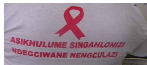
Slogan on the T-shirts won during the campaign