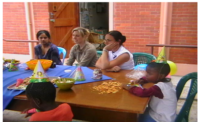
Rehab Team and kids