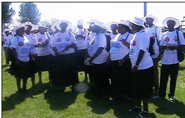
Community Health Care workers came out in numbers