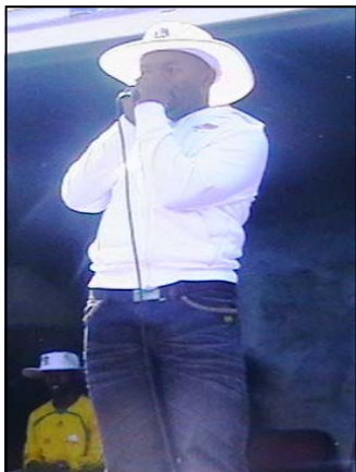
Tzozo entertaining the crowds