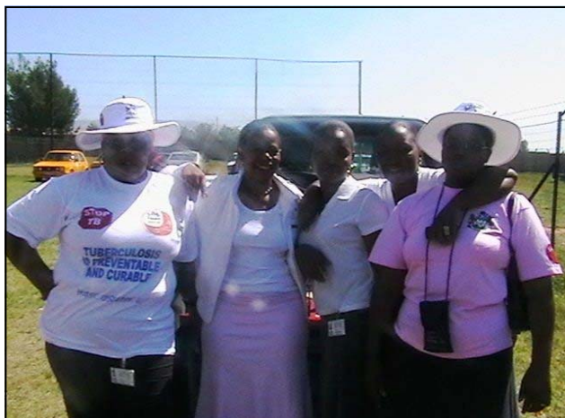
Dundee Hospital Staff