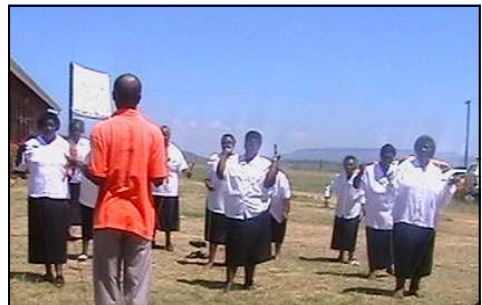
"Move for your health" Senior citizens showing the crowd how its done.