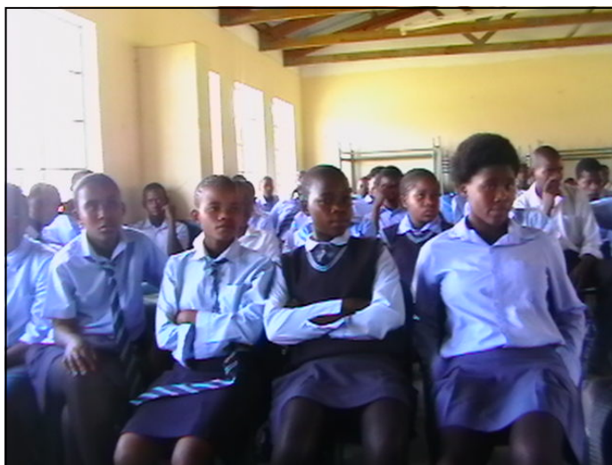
Students from Shiyane High School listening attentively

On the 21 st and 28 th February 2008, Dundee Hospital's Social Worker and Occupational Therapist visited Shiyane High School in Rorkesdrift and Busi Combined School in Wasbank respectively to give talks on Teenage Pregnancy and Stress Management.