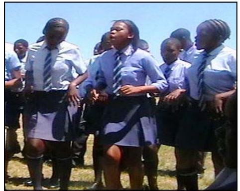
Enyanyeni Combined School Choir

All in attendance were treated to great entertainment by a group of senior citizens from Dundee, who demonstrated how they stay fit and agile in their old age