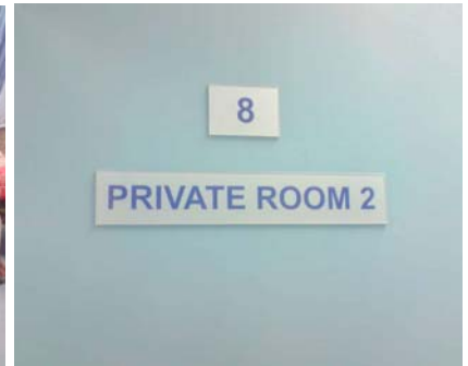
One of the Private rooms