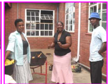
CHW preparing lunch