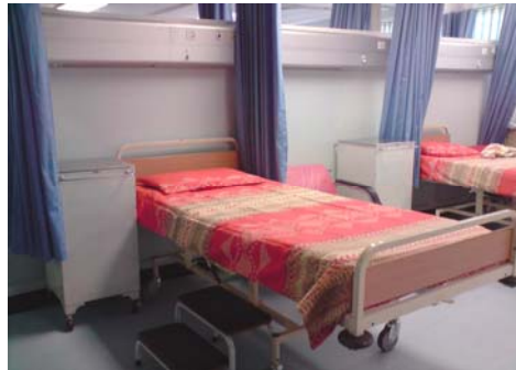
Therapeutic patient environment