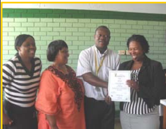
Receiving RPL certificates: