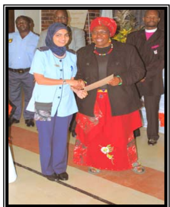
At the function Certificates of Appreciation. from the Office of the MEC for Health were awarded to Community Service Officers