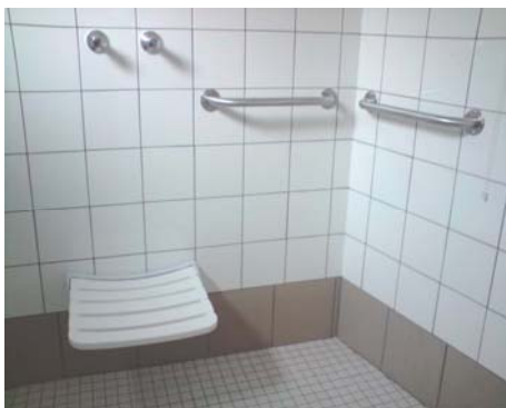
Disabled friendly bathrooms