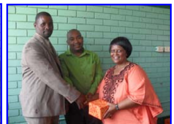
Z Khambule KZN PPHC