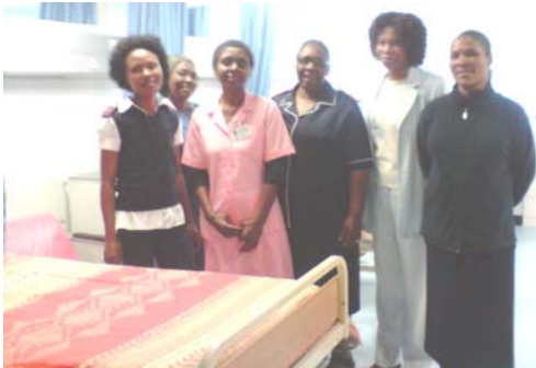
Mat 2 Staff ready for ward occupation

In May renovations to Maternity 2 were completed. Previously the ward had little to offer in terms of a conducive environment. Maternity 2 now proudly boasts state of the art equipment, an ICU for sick and premature babies. The ward is open to all patients regardless of medical aid or not. Careful detail was paid to infra structure to be infection control compliant to prevent Klebsiella. The management thanks all stakeholders for the success of this project. On the 11 June 2009 the Hospital Board toured Maternity 2. Patients interviewed very happy with the