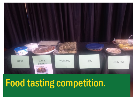
Food tasting competition.