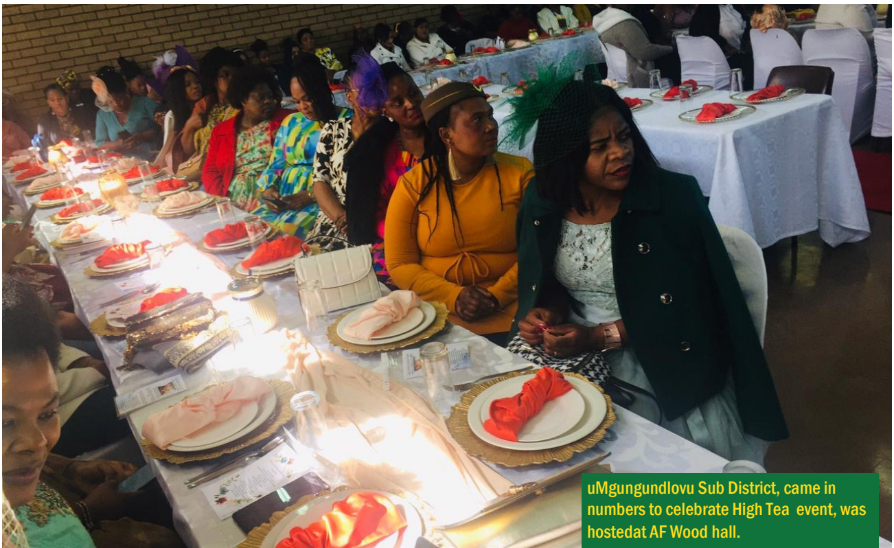
uMgungundlovu Sub District, came in numbers to celebrate High Tea event, was hosted at AF Wood hall.