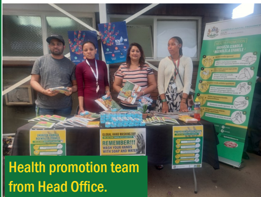
Health promotion team from Head Office.