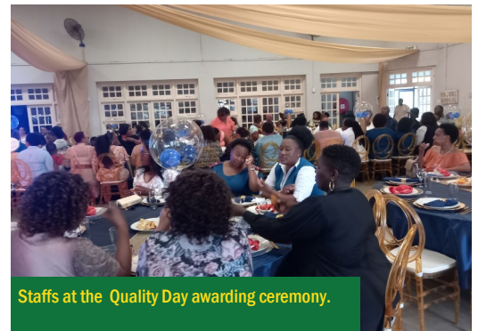
Staffs at the Quality Day awarding ceremony.