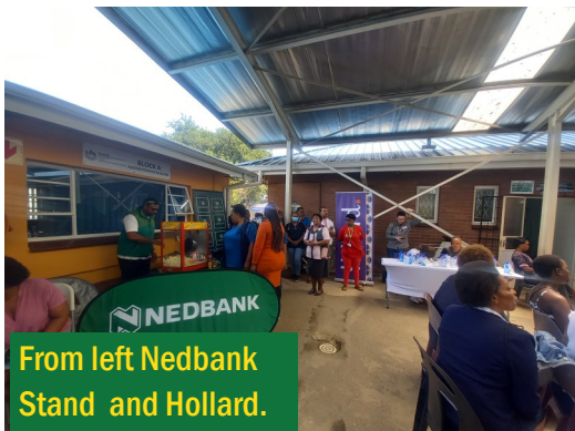
From left Nedbank Stand and Hollard.