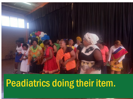
Pediatrics doing their item.