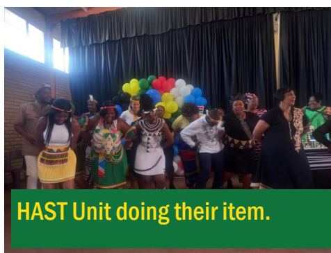
HAST Unit doing their item.