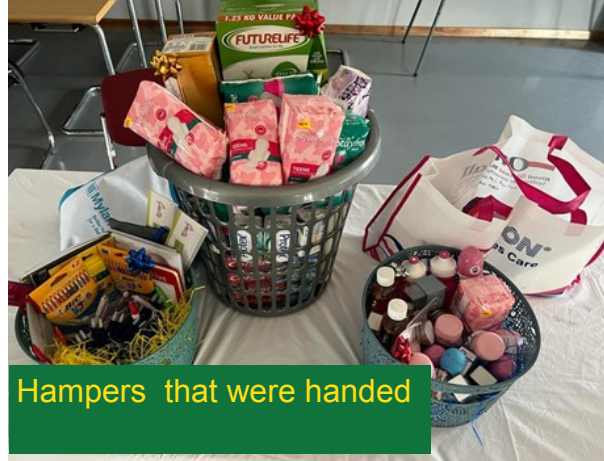
Hampers that were handed

color ons). presen- was a suc- and im- pactful the youth.