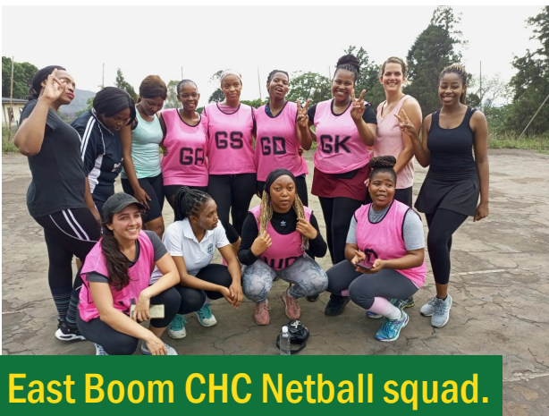
East Boom CHC Netball squad.

Work and play, under Health Awareness is part of the EAP. After the pandemic there was a need to tackle various circumstances that negatively affected staff emotionally, physically and financially. So work and play was conducted, staff were recruited and made aware about the guidelines stipulating how the program should run. It's compulsory for all employees to partake and practice two hours per week. Activities that are yet available are Rope pulling, Walking, Soccer, Netball and aerobics. This program started well although there were challenges especially with transportation, grounds for practice, funds as well as equipment. The achievements have been exceptionally excellent, as East Boom CHC under uMgungundlovu district, entered a tournament competing with employees from all 15 facilities. They received medals as well as a ball in recognition of their achievements. A week later after the tournament which took place on the 25th of November 2023, East Boom CHC was invited to an awarding ceremony at Natalia where they received a trophy for rope pulling and 1st price for Netball. Soccer team made it for the semi finals, which is still excellent.