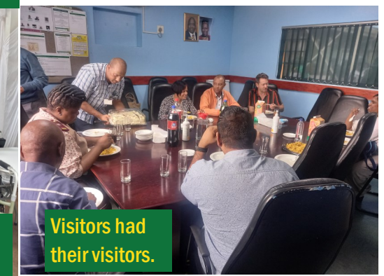
Visitors had their visitors.