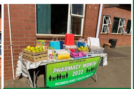
Set up for Pharmacy week that took place at East Boom Clinic.