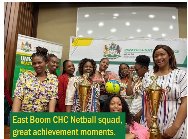
East Boom CHC Netball squad, great achievement moments.