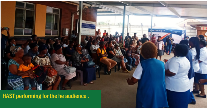
HAST performing for the he audience .

There was an answer quizz , and interactive game to educate when to take medication, how to take medication , importance of taking medication on the same time. Prices were given to those clients who gave the correct answers. Old clients were also given gifts as they were great example to the new HIV clients.