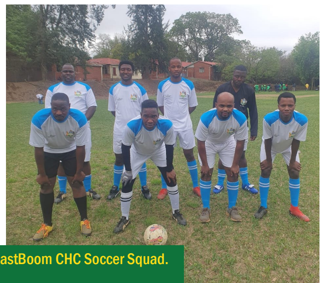
East Boom CHC Soccer Squad.