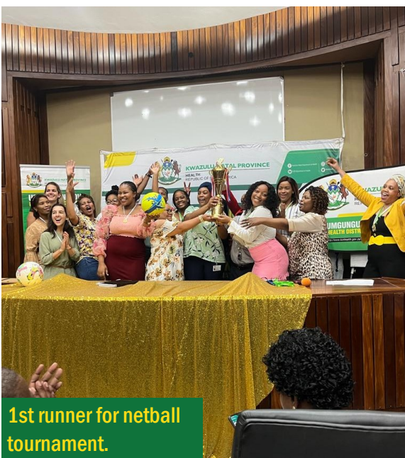
1st runner for netball tournament.