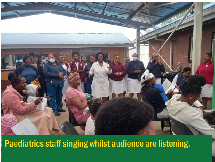
Paediatrics staff singing whilst audience are listening.