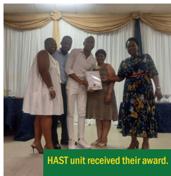
HAST unit received their award.