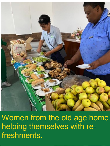
Women from the old age home helping themselves with refreshments.

color ons). presen- was a suc- and im- pactful the youth.