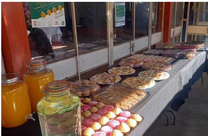
Refreshments for the day.