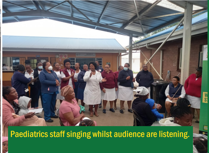
Paediatrics staff singing whilst audience are listening.