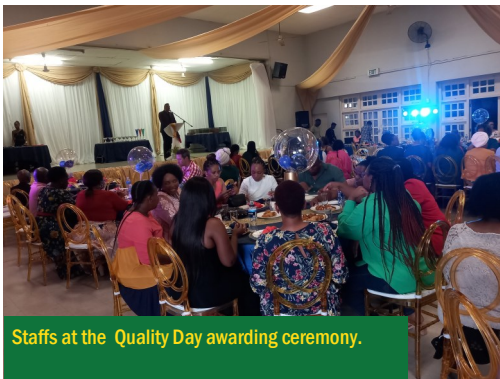
Staffs at the Quality Day awarding ceremony.