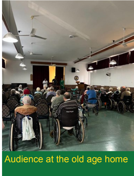
Audience at the old age home