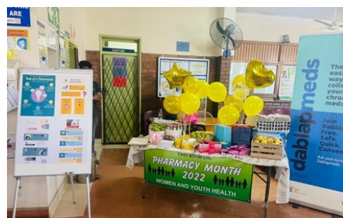
Pharmacy week set up.