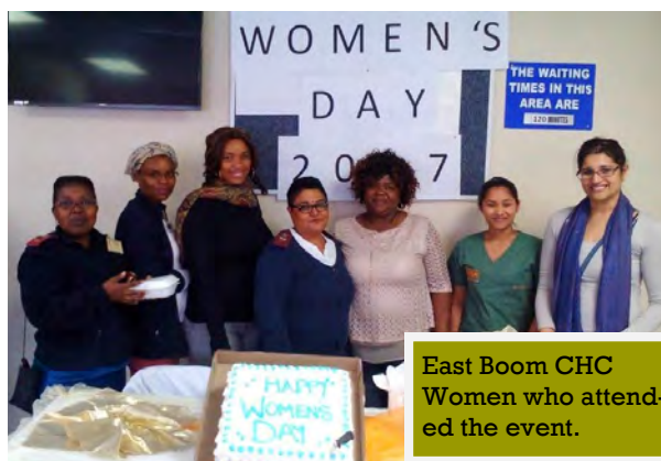
East Boom CHC Women who attended the event.