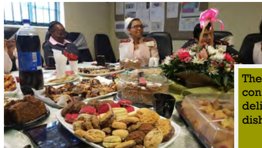
The management contributed towards delicious food and dished up food.