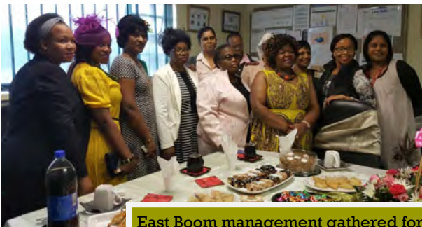
East Boom management gathered for the high tea at the East Boom CHC boardroom.