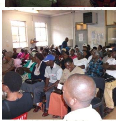
Umphakathi wase Mgungundlovu wawuphume ngobuningi bawo.