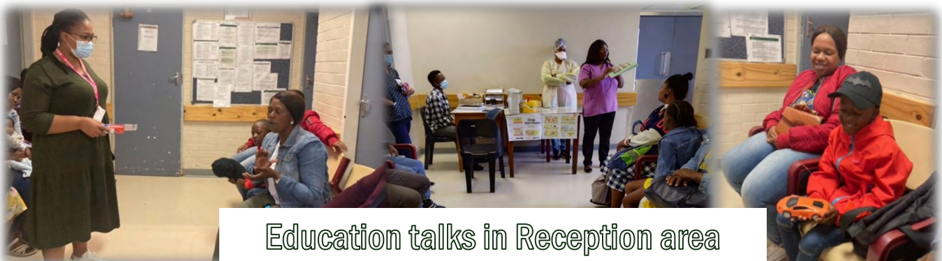
Education talks in Reception area

Our dental awareness day started in our reception area. Patients were educated on oral hygiene, gum disease and the different stages of tooth decay. Demonstrations were done on models to show how to properly brush and floss teeth. Patients had the opportunity to voice any concerns they had and to ask questions on oral health. Toothbrush and toothpaste kits were handed out to our patients.