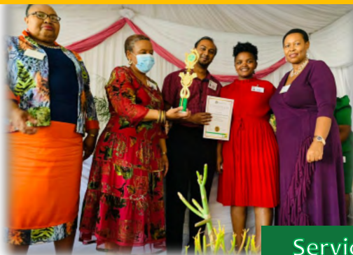
Service Excellence Awards...3