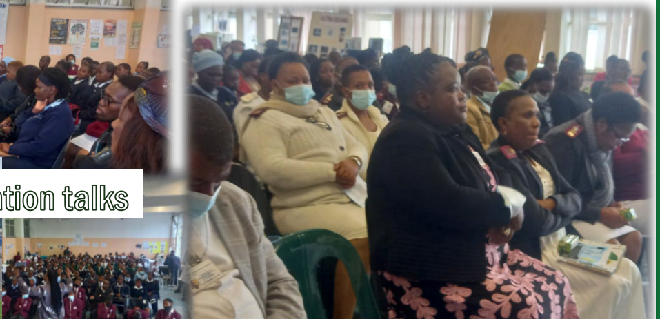
Audience listening attentively to the speeches