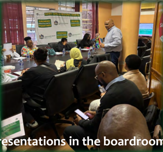
Presentations in the boardroom