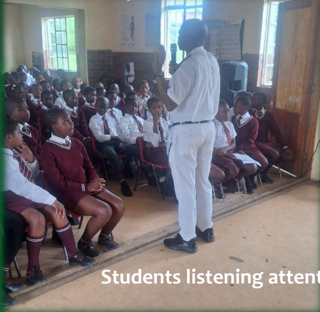
Students listening attentively to the speakers