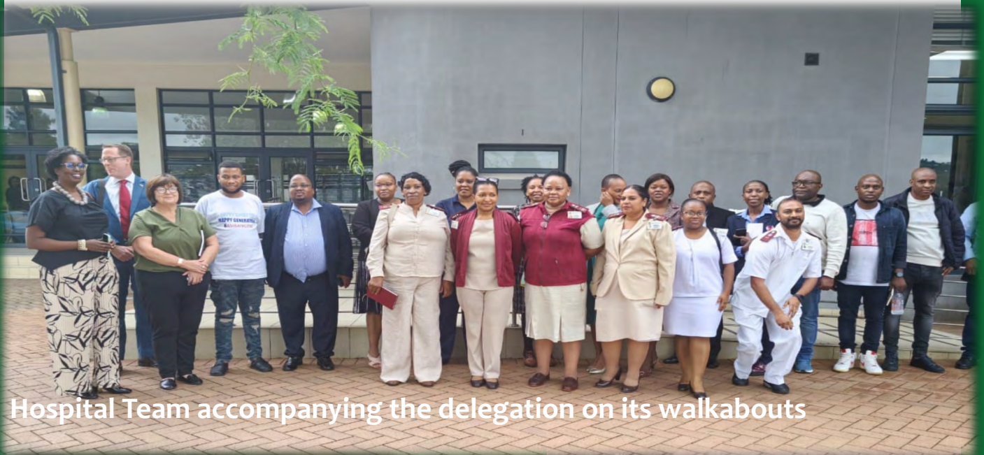
Hospital Team accompanying the delegation on its walkabouts

On the 27th of March 2025, the Provincial Committee visited the hospital with the aim to access to a briefing on the Dreams Programme provided by TB HIV Care. The Committee zoomed in to high rate of teenage pregnancy and other youth related matters. During the presentation various participants explained how TBHIV CARE has managed to help them grow their businesses by supplying them with starter kits e.g. sewing machines, baking equipment including stoves etc.. It was amazing to hear and see how the youth have grown to be young successful business men and women.