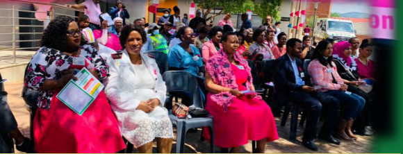
Audience listening attentively