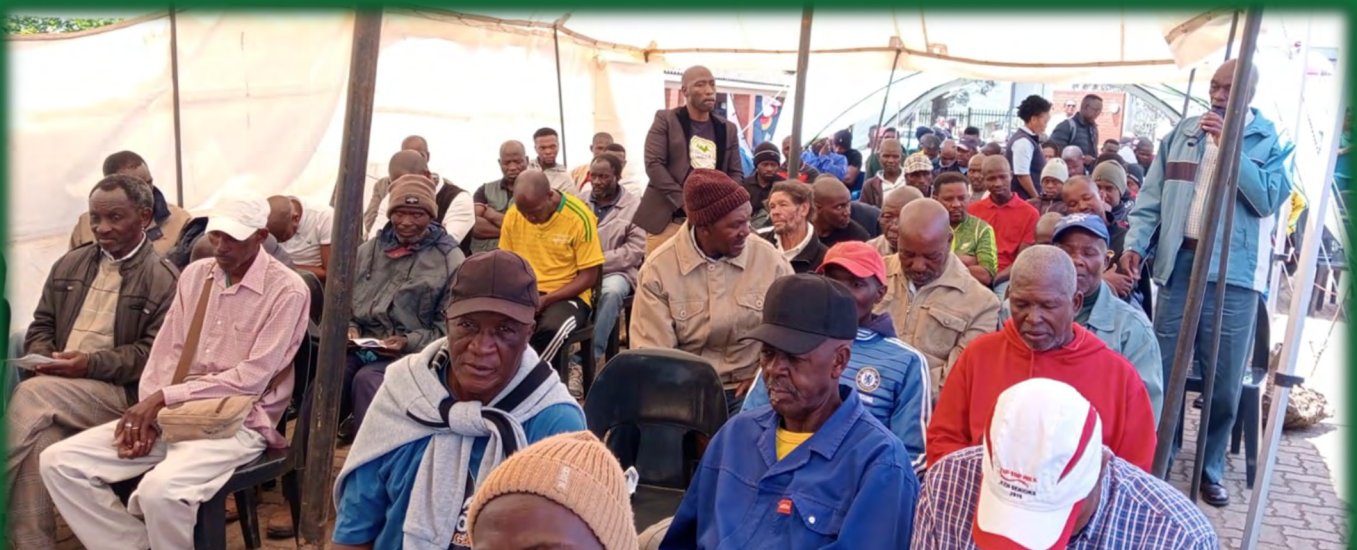
Audience interacting during community dialogues

Mafakatini Clinic launched its Men's Health Service on the 3rd of November 2023 to encourage greater participation of local men in seeking health services. The following services were provided on the day of the event: HIV testing, Pre-exposure Prophylaxis, post exposure prophylaxis, Sexual transmitted diseases management, recruitment and booking for male medical circumcision, male sexual reproductive health, prostate cancer screening, TB Screening, hypertension screening, referral services and acute services. Men's health services targets all males above the age of 24 years old and there is youth friendly services that accommodates younger males. The poor attendance of males in the clinic was noted and clinic management decided to approach the community structures which includes traditional, political leadership and partners so as to have a community dialogue; identifying the issues and come up with remedial actions. The event was a success; male community fill up the tent and they were interacting during the dialogue session.