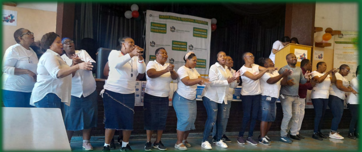
Harry Gwala Regional Hospital IPC Team rendering musical item

The best pledge was judged based on its originality, Creativity, Relevance and how educational part of it. The Winners of the best pledges were as follows: Internal Medicine; Critical Care/Burns/ED; O & G and Physiotherapy Department. This was an educational day of fun. The aim of the campaign was to strengthening awareness on the importance of hand washing with clean water and soap or using sanitizers ; Promoting and creating conducive environments for good hygiene practices in schools and health facilities .