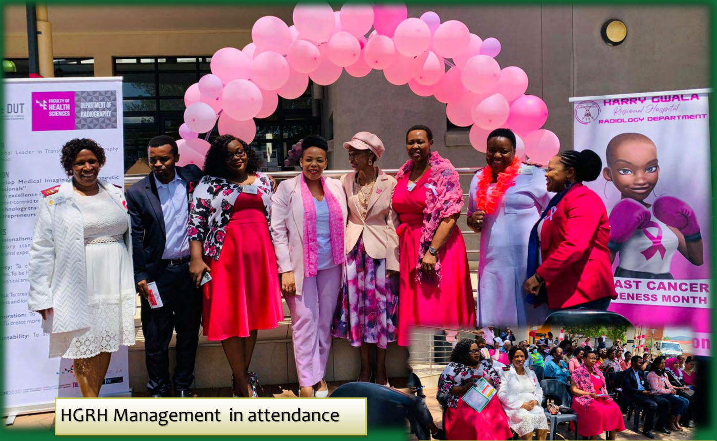
HGRH Management in attendance