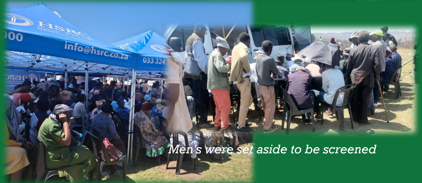
Men's were set aside to be screened