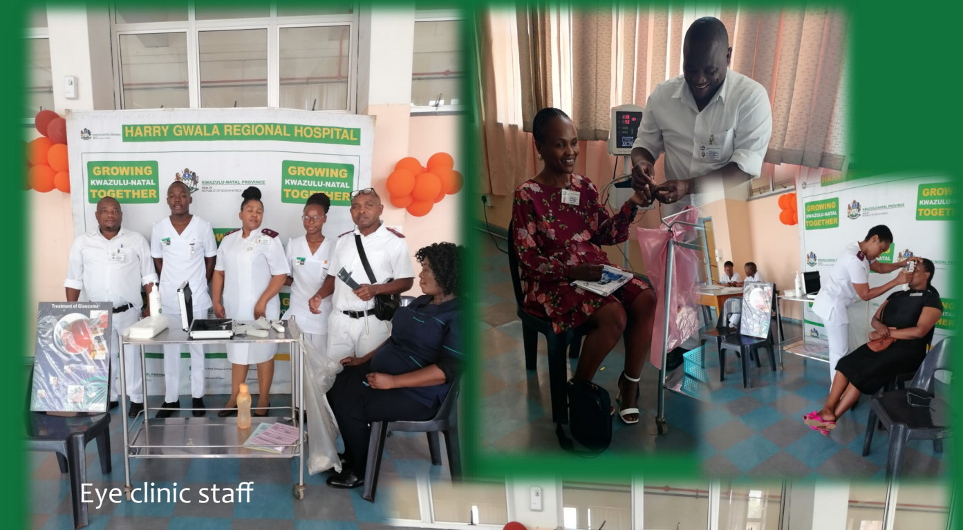
Eye clinic staff

On the 11th of October 2024 the hospital held its Glaucoma awareness day . The aim was to educate people about glaucoma which is the second most common cause of blindness. But its possible that nearly half of the people with glaucoma don't realize they have. This is because there are no noticeable symptoms in the early stages . Educational talks were given to the patients , glaucoma tests were also done .