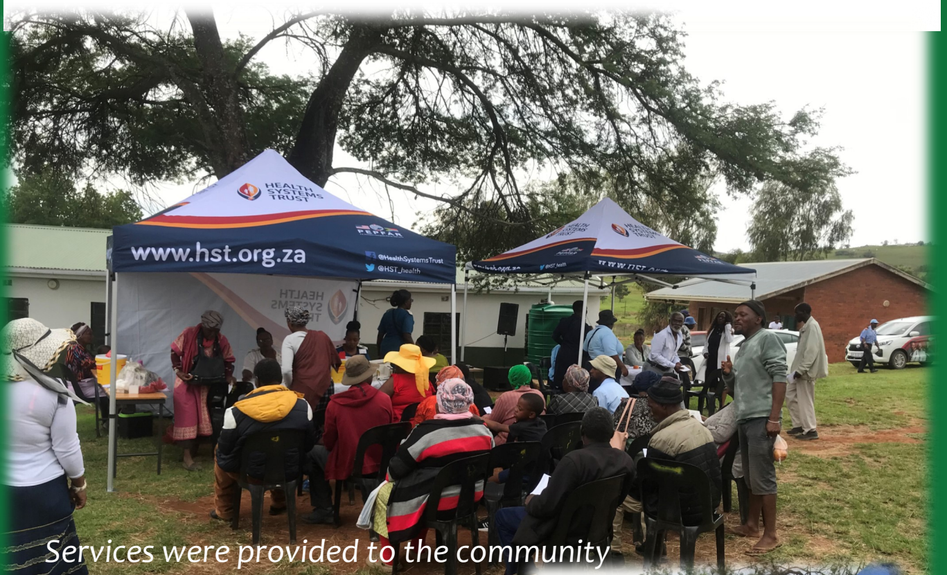
Services were provided to the community

On the 5th of December 2024 HGRH took the services to the community of Impendle( Stoffelton). The aim was to show that through dedication , innovation and community involvement even a struggling institution could become a model of service delivery, empowering the community. HGRH realized that to improve service delivery , they needed to understand communities needs. The services offered included dental services, chronic illnesses, TB screening , HIV Testing and a men’s clinic. The physiotherapy and Occupational Therapy department handing out wheelchairs and crutches to the adults. HGRH increased access to services by innovative thinking, collaboration and a deep commitment to serving the community. Stakeholders that were present were from HST, HSRC, NHI PILOT PROJECT and Impendle Municipality , the day was a monumental success.