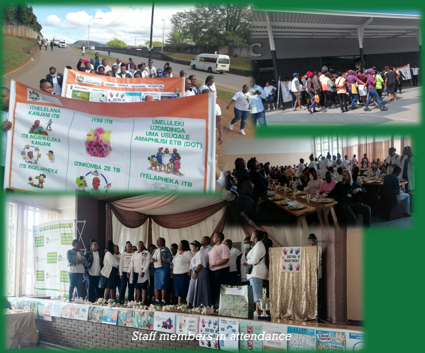
Staff members in attendance

On the 23th of October 2024 HGRH celebrated its Global handwashing day that was led by Infection Prevention and Control Team. Edendale Mall was visited by the IPC Team to promote handwashing; donated hand washing packs (including hand soap, toothpaste, face towels etc.) This day was dedicated to spreading awareness about the importance of hand hygiene . The institutional event commenced at 11H00, which involved the following activities : each department was requested to present a poster on its departmental pledge and commitment to handwashing. Certain departments created posters and slogans to promote handwashing. The best presented pledge was judged by our guests representatives from local schools. The pledges were judged based on the creativity, originality and how educational it was. The winners of the best performance was the Physiotherapy Department. The day was indeed fun and very educational at the same time. The aim of the campaign was to educate about the importance of handwashing with clean water and soap. The day was a success.