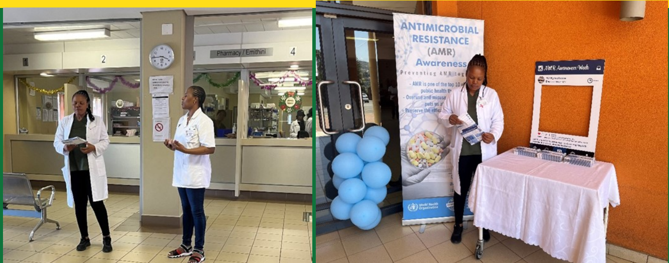
Pharmacy staff with a stand outside the main entrance to raise awareness to the public and staff members. Additionally, pharmacy in CDC pharmacy waiting area educating the patients.