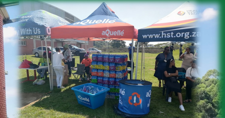
Staff having fun with aerobics and other sports codes

On the 25th of October 2024 the hospital held its sports day staged by HGRH employees and in which they participate in competitive sporting activities. "Sport for the Promotion and Peaceful and Inclusive Societies" was the theme for the 2024 HGRH Sports Day. The day is celebrated to promote physical activity, health, and sportsmanship. It is an opportunity to showcase athletic skills, bring together people of all ages and backgrounds to participate in a fun and competitive environment. Stakeholders that were present included Aquelle, Khwezi FM, and Metropolitan life and HST.