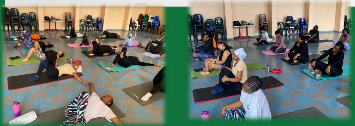
Physical activity – Pilates session (9-10am) at Njozela hall. Staff members supported by participating on Pilates session and there was staff education prior to the session.

Harry Gwala Regional Hospital participated in World Antimicrobial Resistance Awareness Week (WAAW), a global campaign which raises awareness and understanding of AMR and encourages global action amongst healthcare workers and other stakeholders (including the public) to tackle the emergence and spread of drug-resistant pathogens. The awareness week was on the 18 – 22 November 2024 and the theme was; Educate, Advocate and Act now. Pharmacists and other Health Care Workers counselled patients on the importance of taking antibiotics as prescribed.