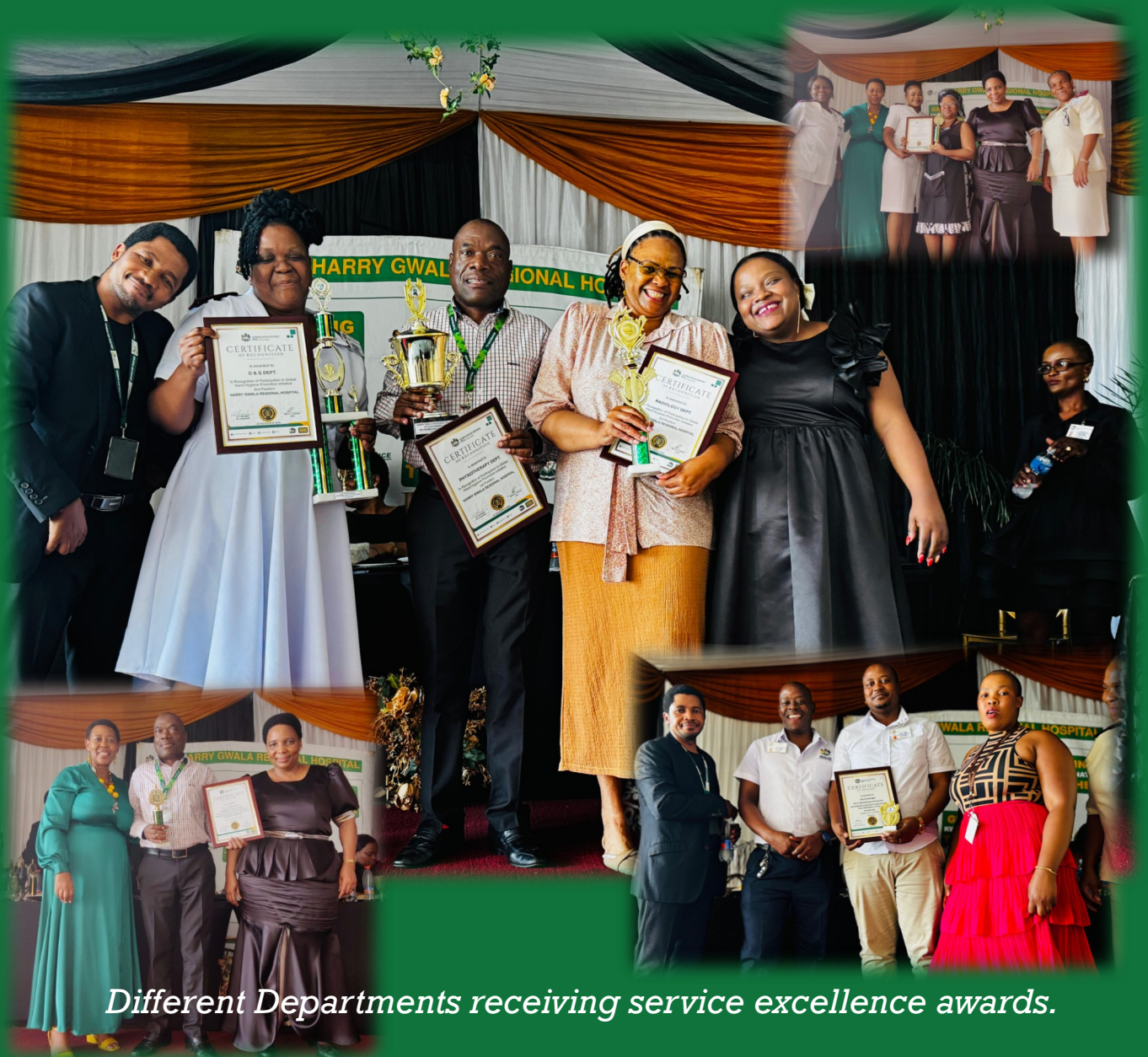
Different Departments receiving service excellence awards.