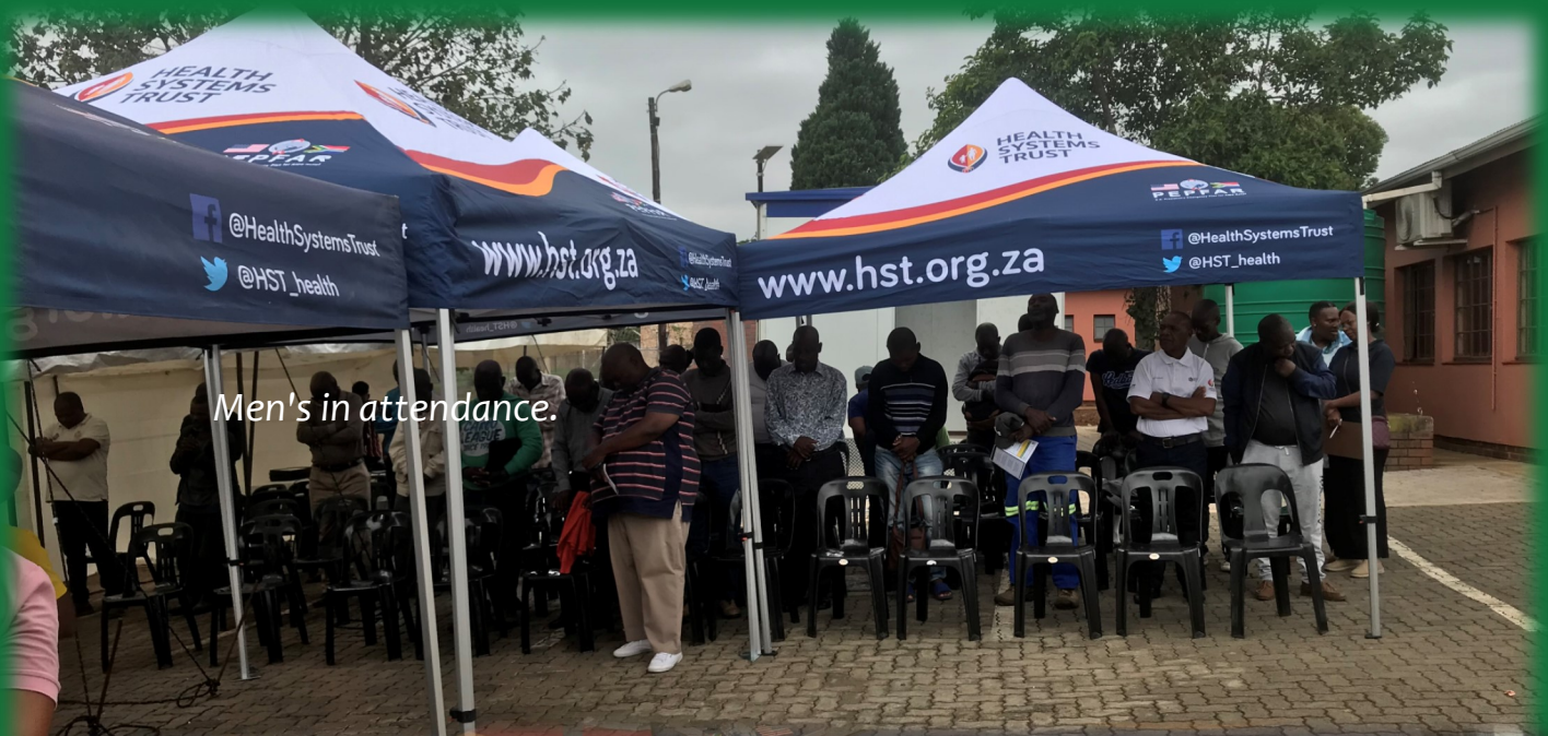
Men's in attendance.