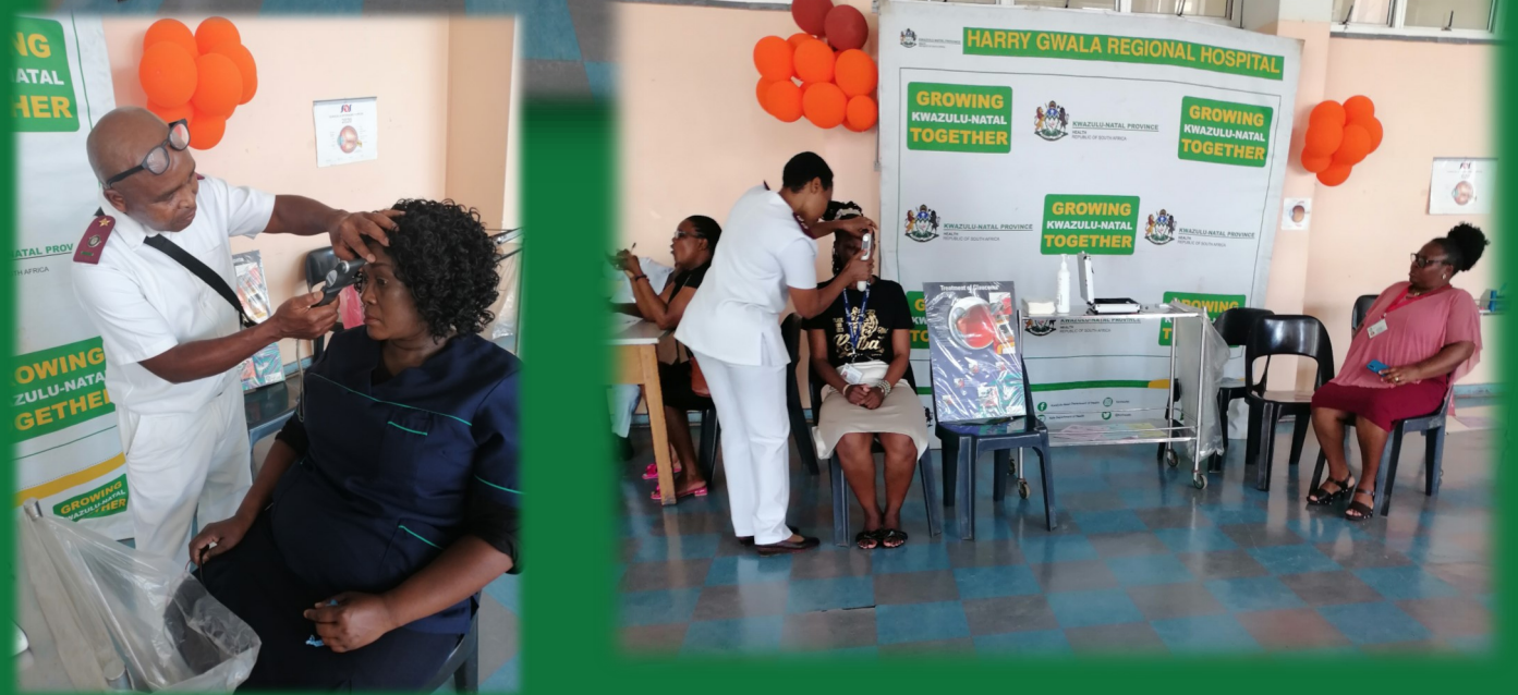
Staff members screening for glaucoma