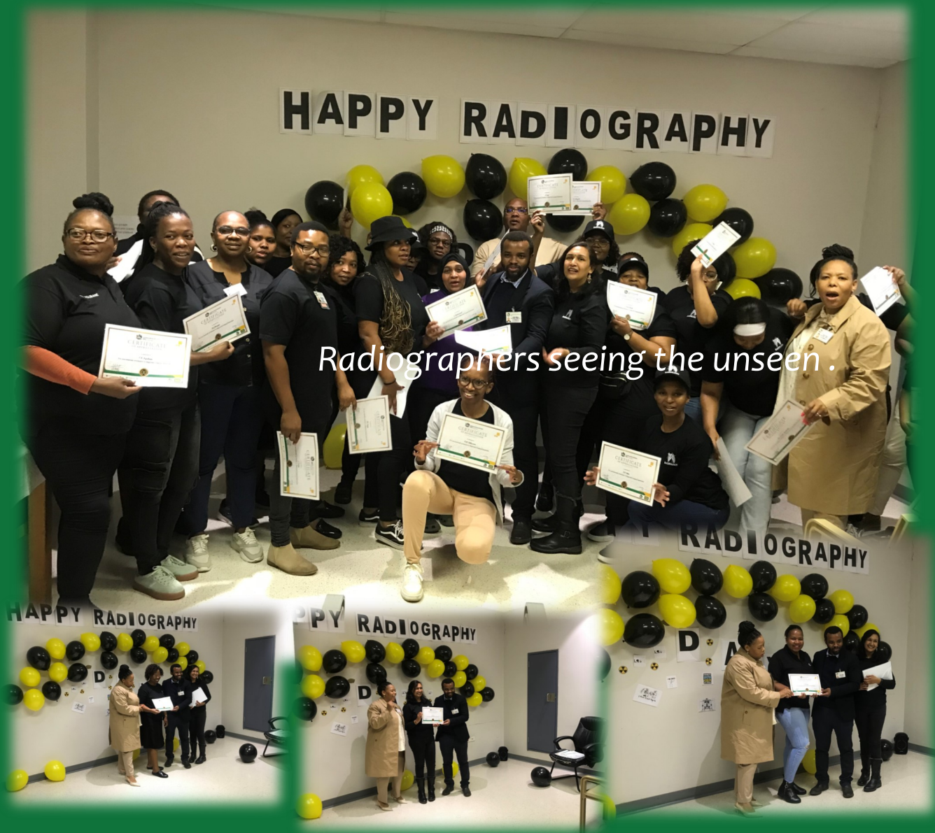
Radiographers seeing the unseen .