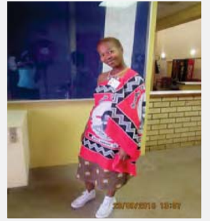
SPHE Dlamini Transport Intern