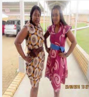
Sthe & Nombuso Laboratory