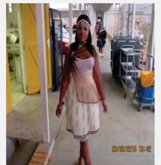
E/N S.P. Mbokazi MOBILE UNIT