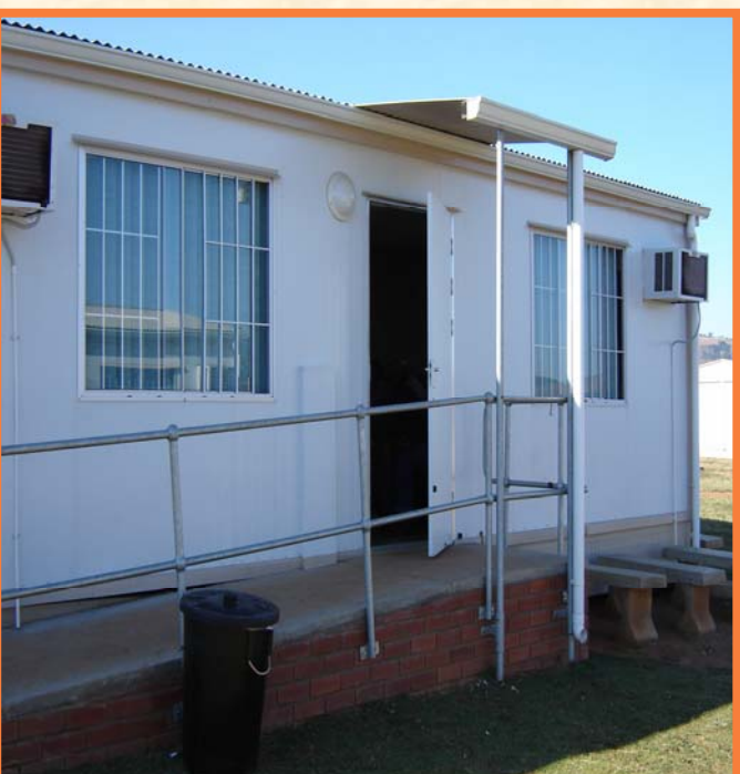
FRONT VIEW OF THOLIMPILO CLINIC