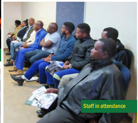
Staff in attendance