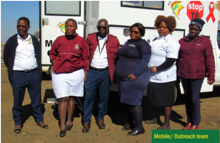
Mobile/ Outreach team