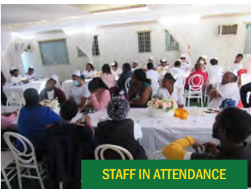
STAFF IN ATTENDANCE