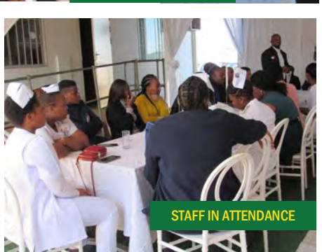
STAFF IN ATTENDANCE