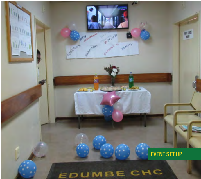
EVENT SET UP

In pictures are officials within the department of health's maternity ward and Patients.