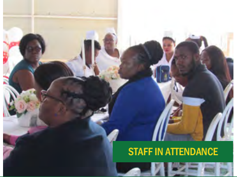
STAFF IN ATTENDANCE