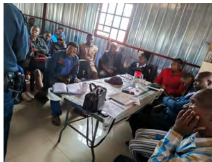
Community member asking questions