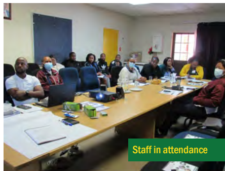
Staff in attendance