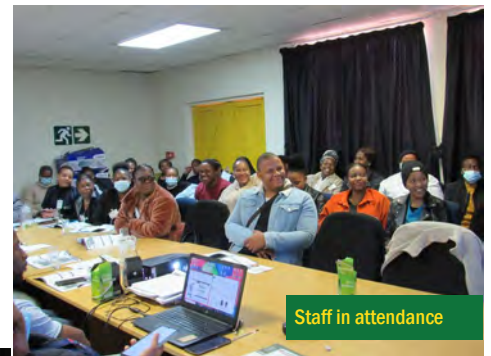
Staff in attendance