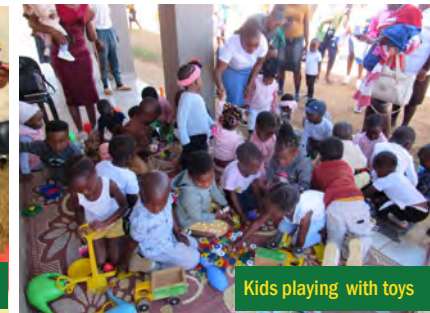
Kids playing with toys