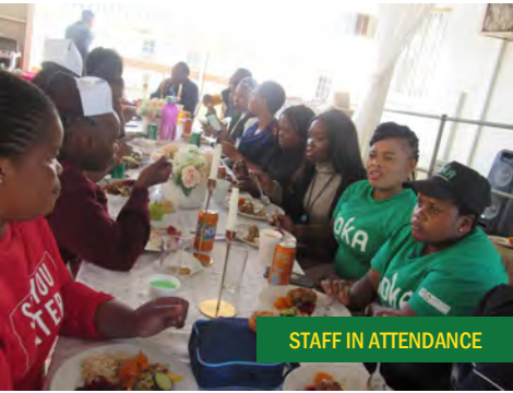
STAFF IN ATTENDANCE