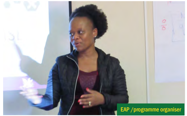
EAP /programme organiser