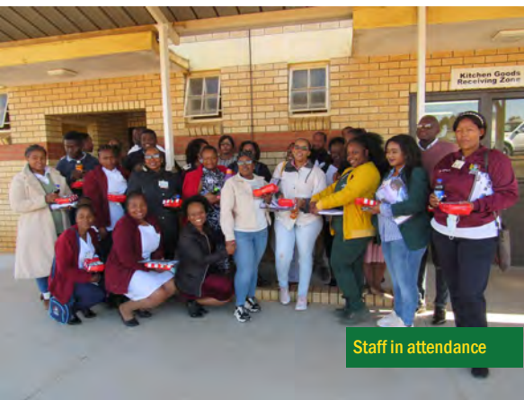
Staff in attendance