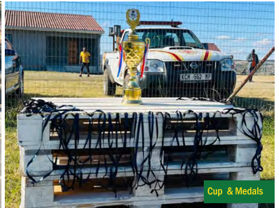
Cup & Medals