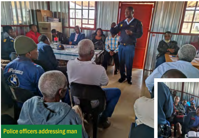
Police officers addressing man