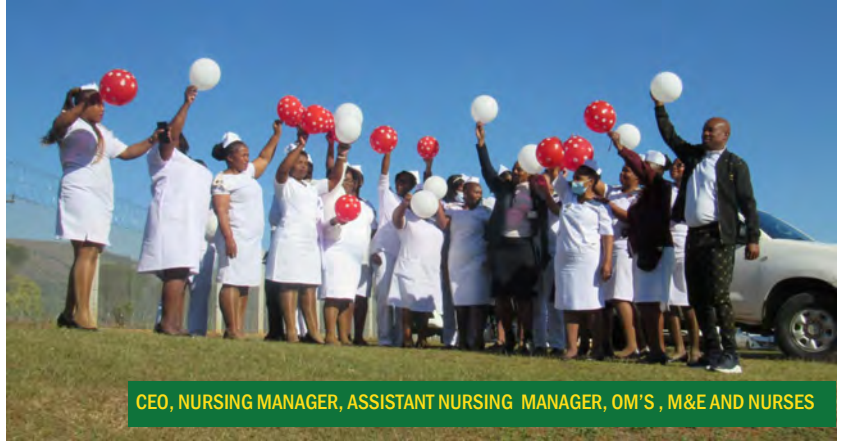
CEO, NURSING MANAGER, ASSISTANT NURSING MANAGER, OM'S , M&E AND NURSES