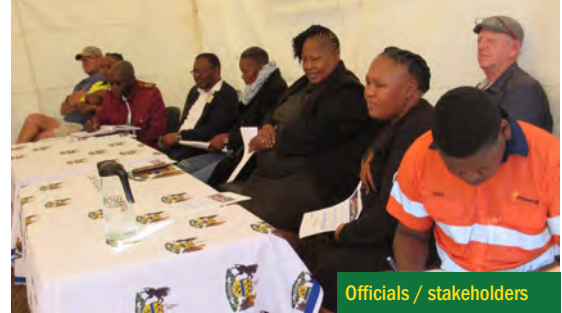
Officials / stakeholders