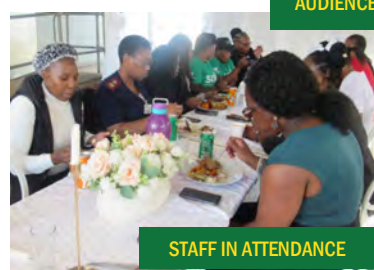
STAFF IN ATTENDANCE