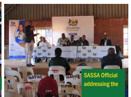
SASSA Official addressing the