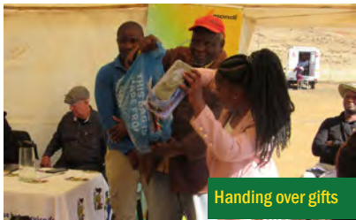
Handing over gifts