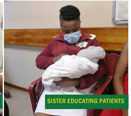
SISTER EDUCATING PATIENTS