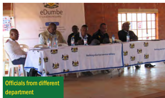
Officials from different department