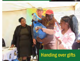
Handing over gifts