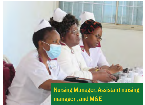
Nursing Manager, Assistant nursing manager, and M&E