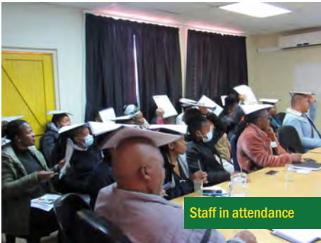
Staff in attendance