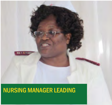
NURSING MANAGER LEADING