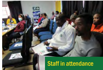
Staff in attendance