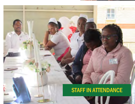
STAFF IN ATTENDANCE