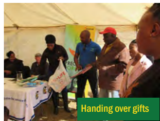
Handing over gifts