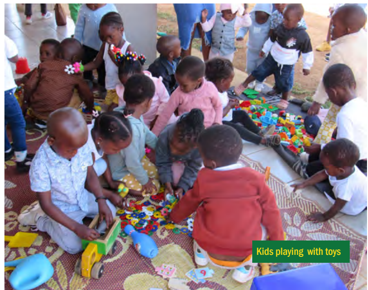
Kids playing with toys