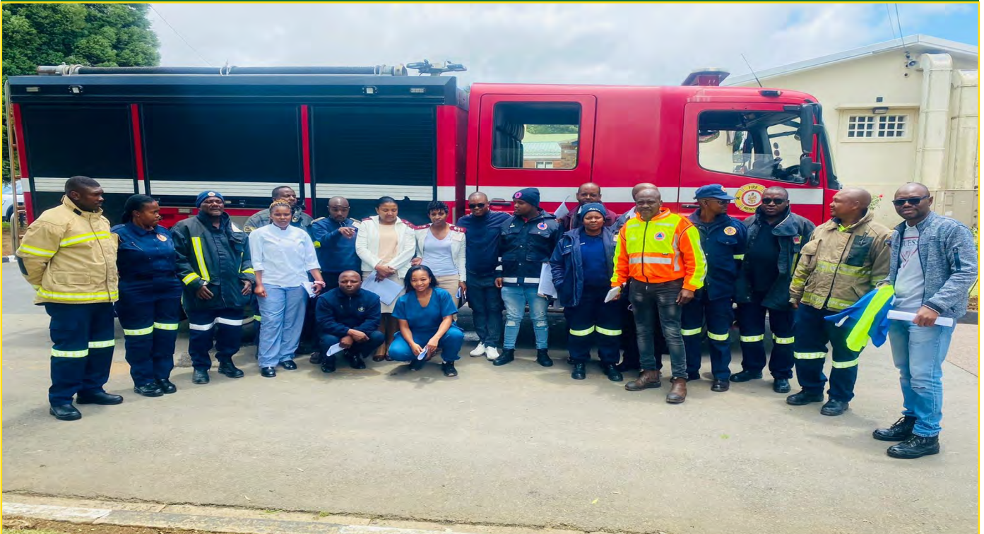
GKM fire department, GKM disaster team and EGUM fire brigade

An Emergency fire drill is a structured and planned exercise that aims to familiarize the staff and patients with the necessary precautions to take when a fire emergency takes place within the premises of the Hospital. The primary goal is to promote a quick, orderly, and safe evacuation of the individuals while avoiding the risk of injuries or casualties. On the 13th of December 2023, EG & Usher Memorial Hospital conducted an unannounced Emergency Fire Drill Exercise. A sound of a continuous siren was let off unannounced to see how the patients and Staff members would react and it was announced that there is fire in admitting, OPD and in casualty, and therefore everyone should evacuate those building. A team of Fire brigades was deployed to observe and ensure that all the mentioned departments are evacuated correctly.