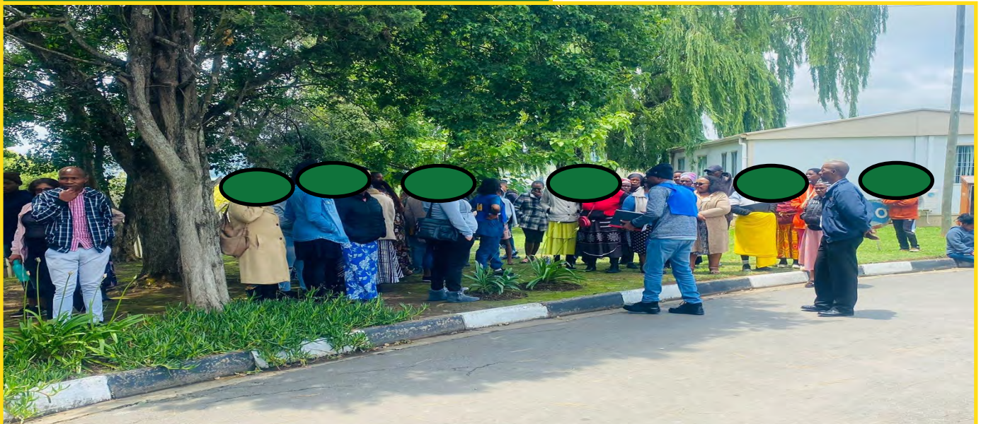
Staff and Patients being engaged on Safety at the assembly point

Fire drills are crucial for safety preparedness as they allow the practice of emergency procedures, minimize panic, and ensure effective evacuation during fire emergencies. Practicing fire drills will also educate participants on fire safety measures and promote compliance with regulations.