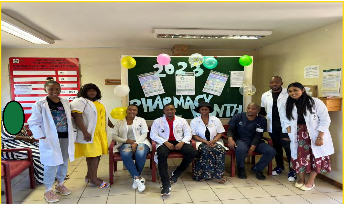
The Dedicated Pharmacy team that was responsible for EGUM'S Pharmacy month celebration.

On the 19th and 20th of September 2023, EG and Usher Memorial Hospital's pharmacy hosted its pharmacy month celebration. This was done under this year's theme, "Pharmacy United in Promoting Healthcare for Patients". The Pharmacy Month 2023 theme was aimed at educating the public on the role of pharmacists and pharmacy support personnel in delivering primary healthcare services to the community; promoting the uptake of immunisation and educating the public on adverse drug identification and reporting; and promoting antimicrobial stewardship, including infection prevention and control (IPC).