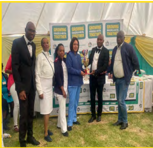
OPD receive an award for 2nd place project presentation