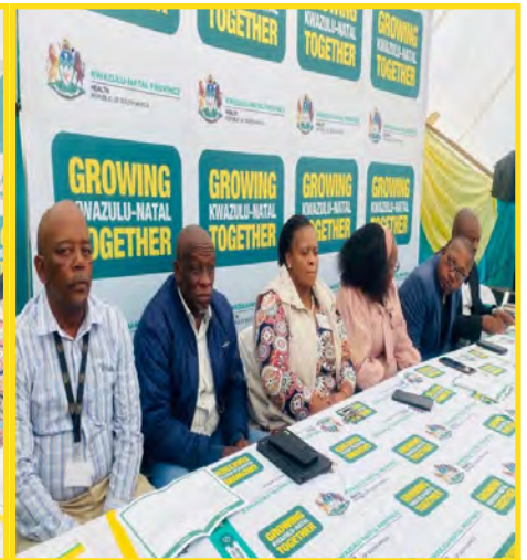
Management and Guests

In an effort to recognize the excellent work that is being done by the staff, EG & Usher Memorial Hospital hosted its annual service excellence awards commonly known as Quality Day on the 29th of November 2023. This is a day that is celebrated each year in November and its purpose is to promote quality in the workplace and to show appreciation to those who are dedicated towards improving quality in their line of operation.