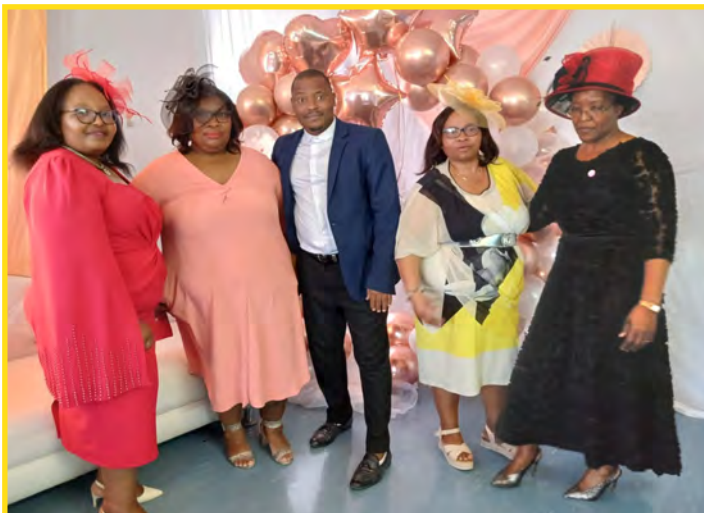
Management During women's Day