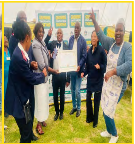
Gateway Clinic receives a Certificate for OHSC Good and Compliant