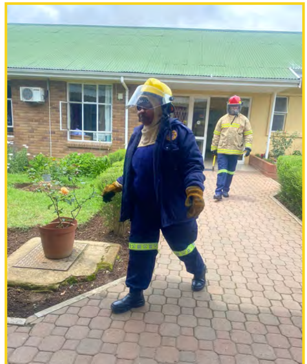
GKM FIRE TEAM MEMBERS

A team of firefighters that were deployed from Greater Kokstad Municipality were on site during this exercise which made it even more real to the colleagues as the team came with a truck and the siren was loud.