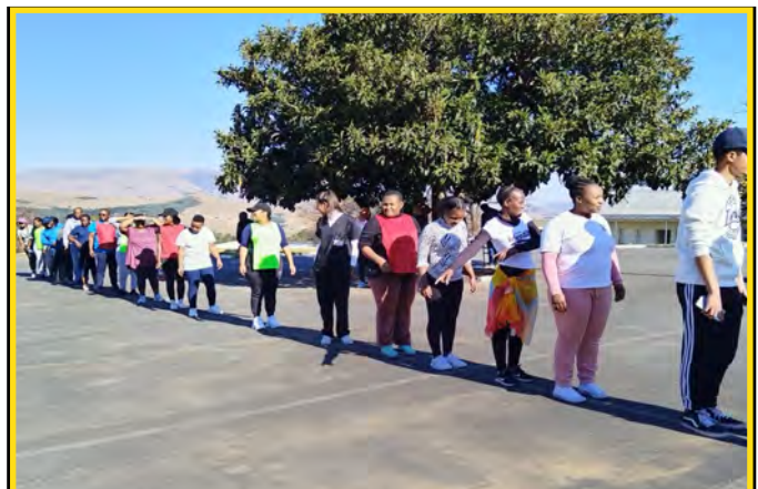
Employees participating in aerobics.