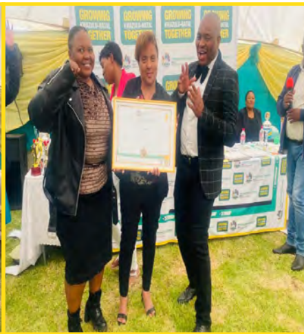
GKC receives a Certificate for OHSC Excellence and Compliant