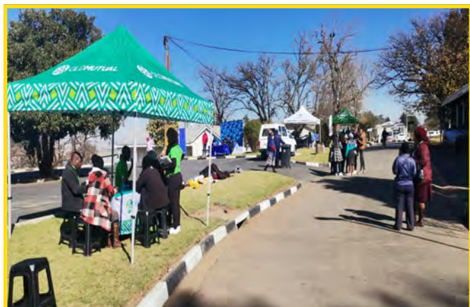
Event Sponsors Gems, Old Mutual, Metropolitan and Avbob