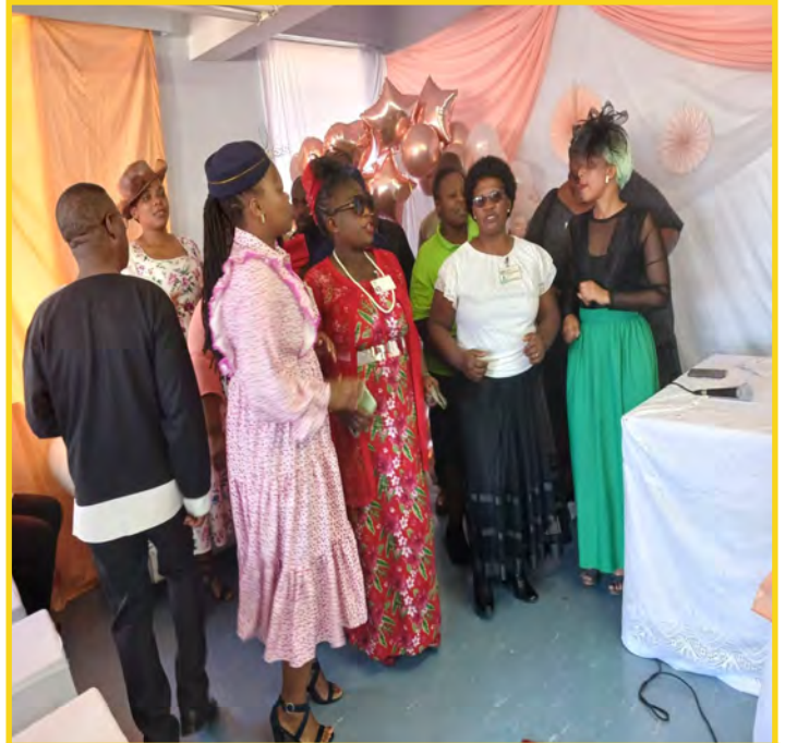
EGUM Choir During Women's Day