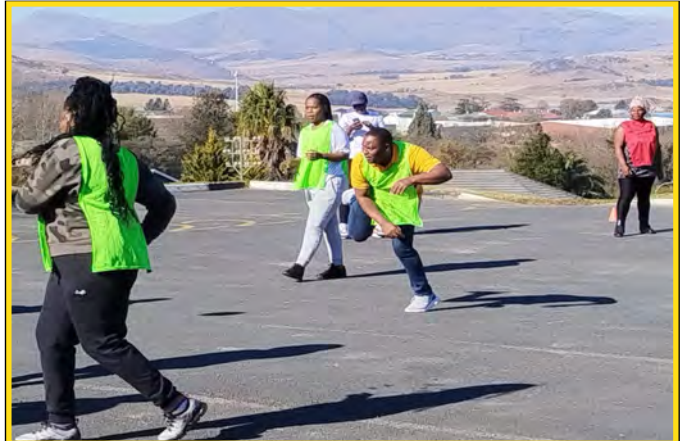
Employees participating in aerobics.