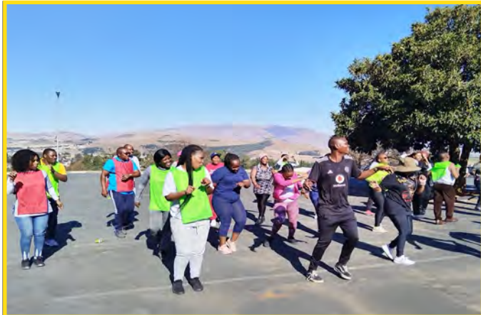
Employees participating in aerobics.