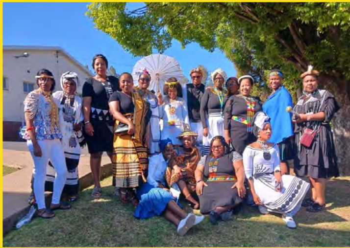
Group Photo During Heritage Day