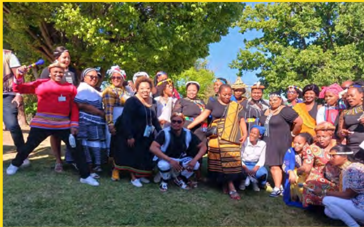
Group Photo During Heritage Day