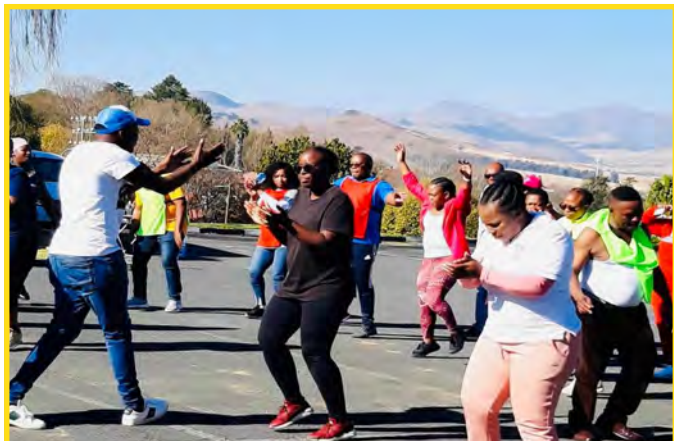
Employees participating in aerobics.