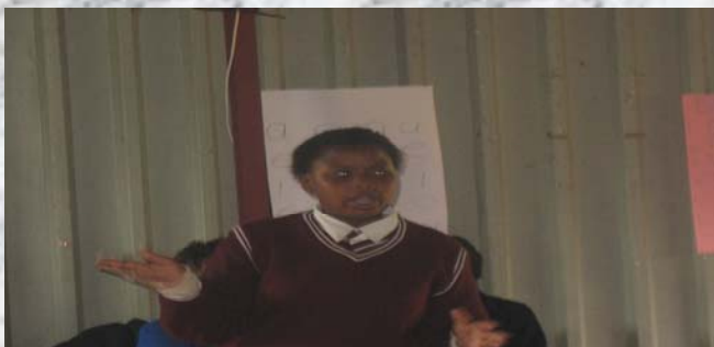
Learner from Thibane C. School asking questions