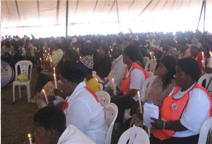
SISONKE COMMUNITY CAME IN NUMBERS TO WITNESS THE MEMORABLE DAY