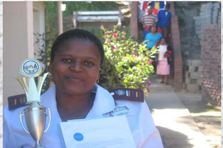
SMILE YOU'VE DONE IT: MRS FOR AN AWARD SHE FULLY DESERVED.