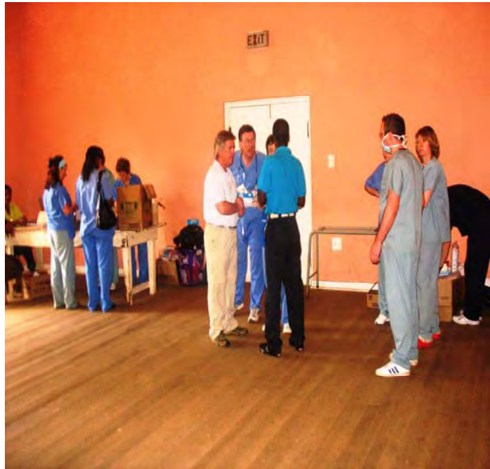
SPECIALISTS GETTING READY TO SERVE THE FRANKLIN COMMUNITY .