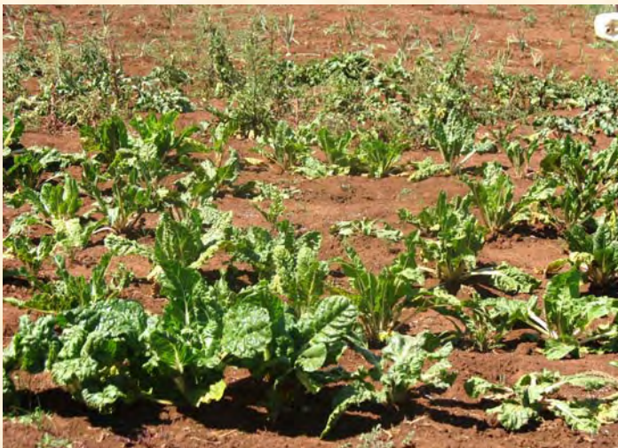
THUTHUKANI COMMUNITY GARDEN