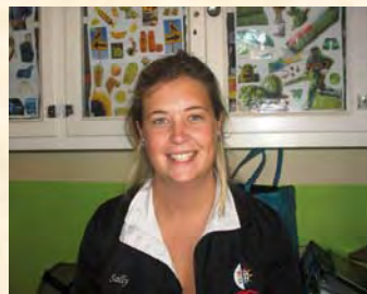
ODETTE OLIVER PHYSIOTHERAPY