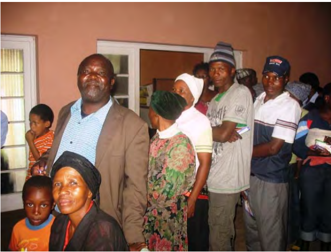
FRANKLIN COMMUNITY LINING TO GET SERVICE FROM THE SPECIALISTS, SASSA AND HOME AFFAIRS